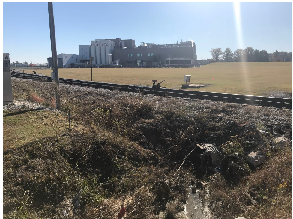
DESCRIPTION: Acquisition Right facing INITIALS: JLA DIRECTION: SE DATE: 11/5/2020