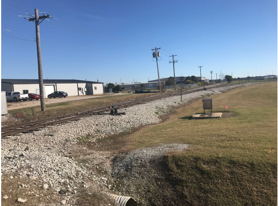
DESCRIPTION: Acquisition Left facing INITIALS: JLA DIRECTION: E DATE: 11/5/2020