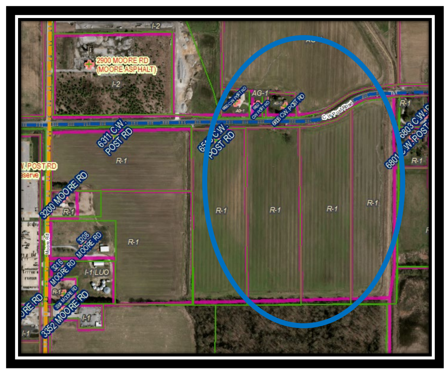
Master Street Plan Map