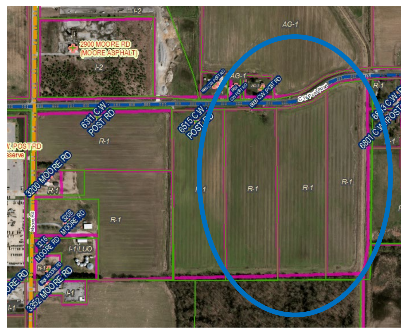
Master Street Plan Map