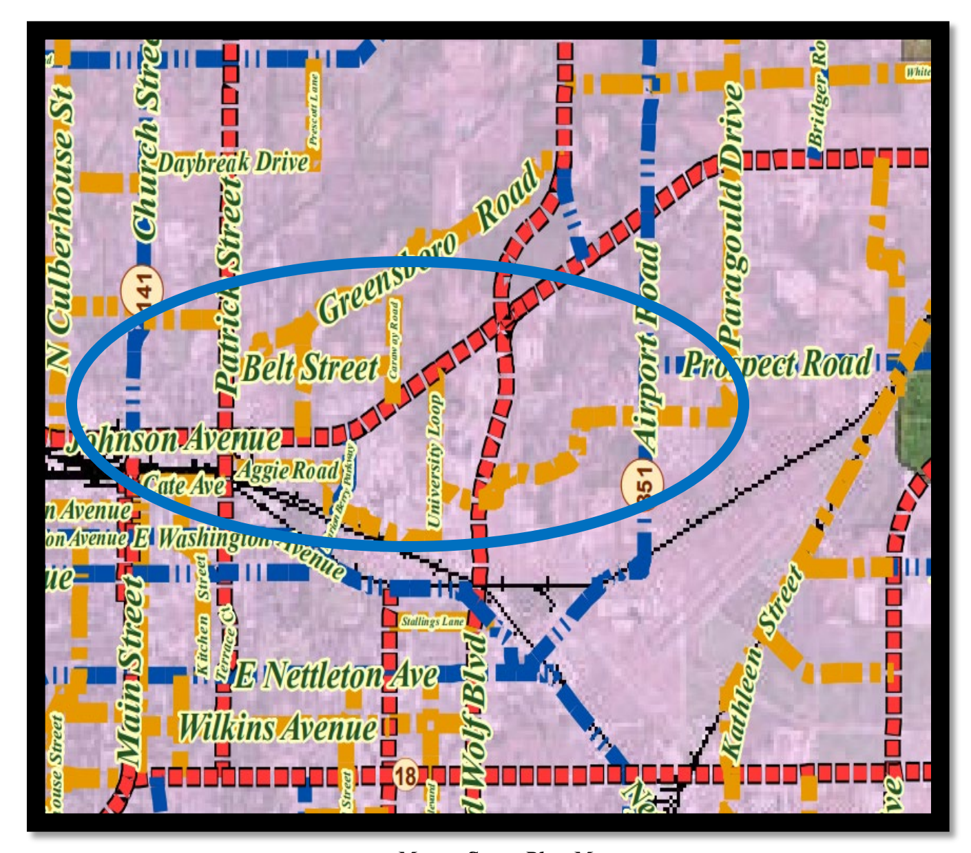
Master Street Plan Map