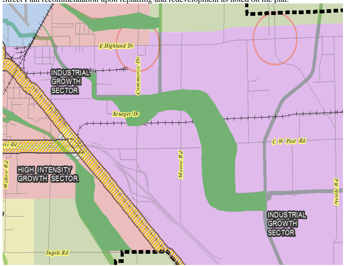
Adopted Land Use Map

Street Plan recommendation upon replatting and redevelopment as noted on the plat.