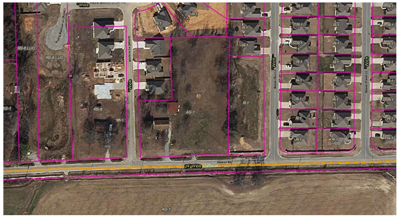
View of Larger Area Showing Current Zoning

Definition: RS-5 Single Family residential district with minimum 8.712 square foot lots required.