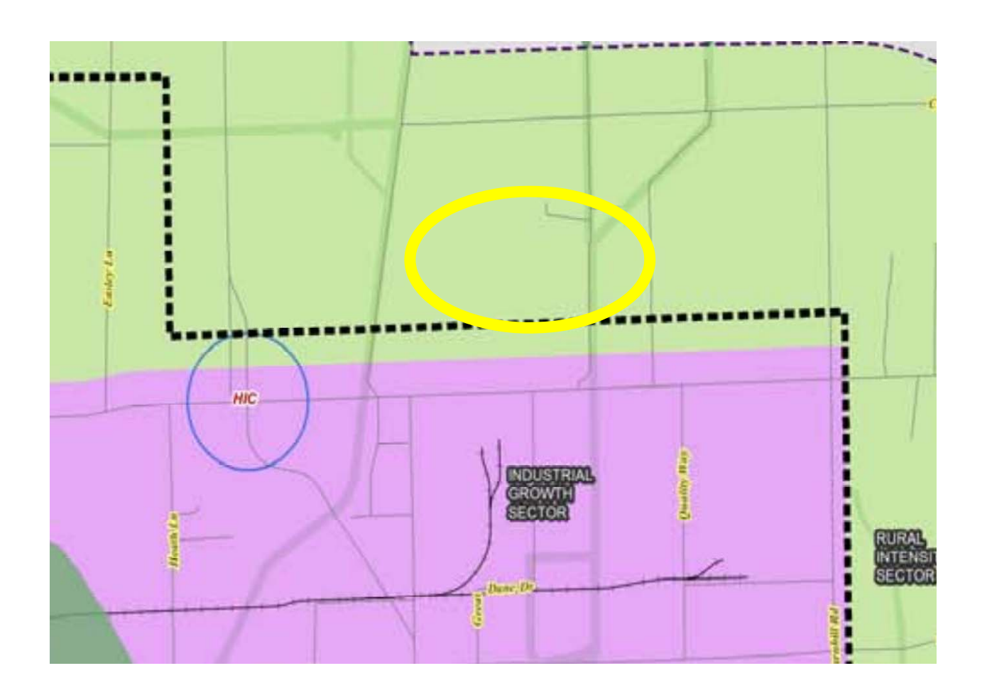
Adopted Land Use Map

The subject site is served by Highland Drive and Grisham Road. The street right-of-ways must adhere to the Master Street Plan.