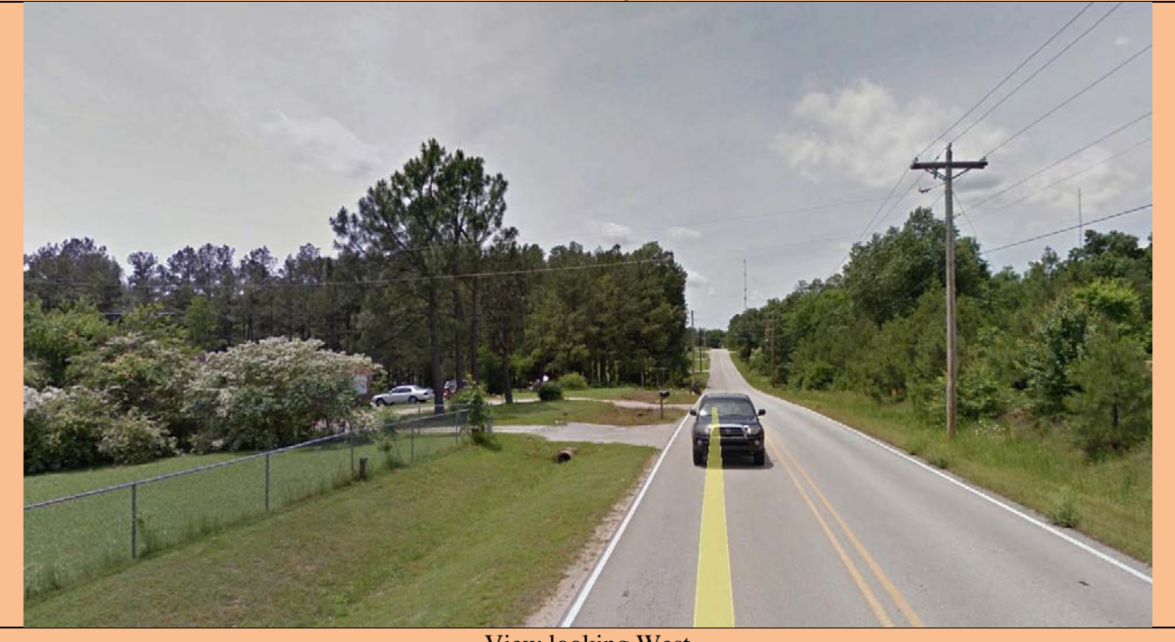
View looking West