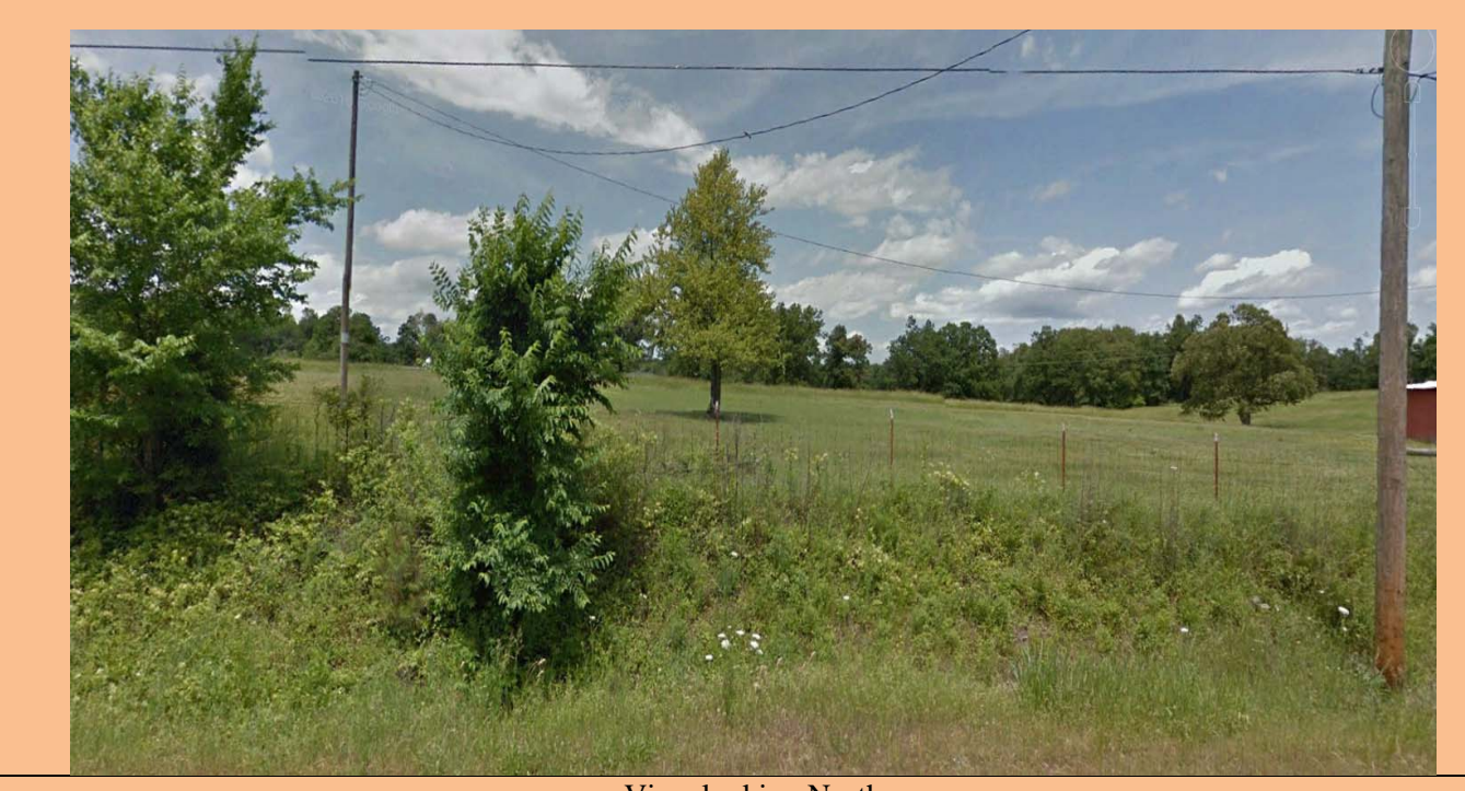
View looking North