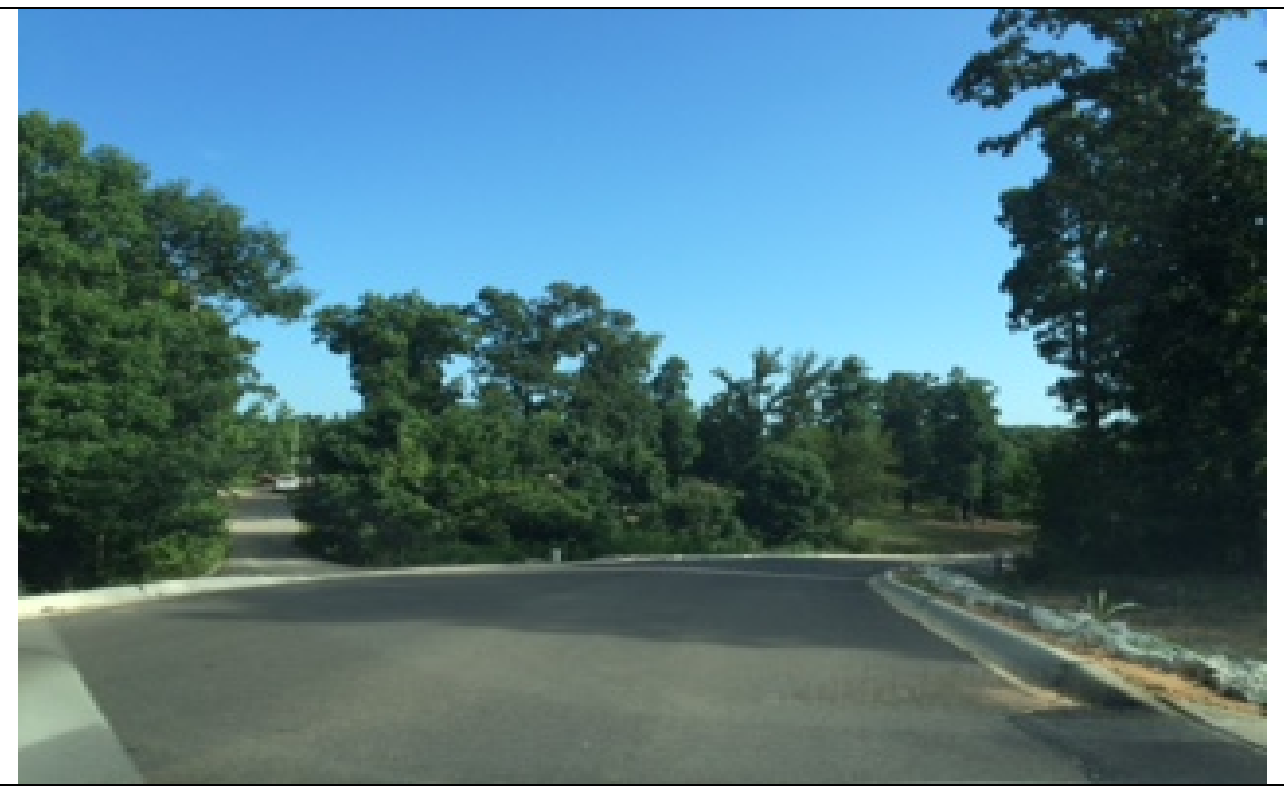
Second access to Sage Meadows - located to the West of the proposed property annexation