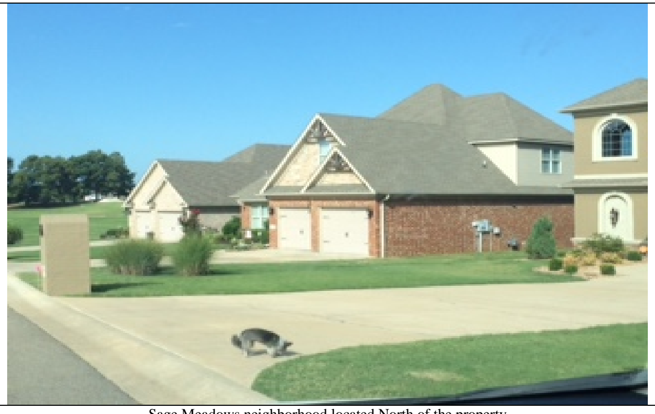
Sage Meadows neighborhood located North of the property