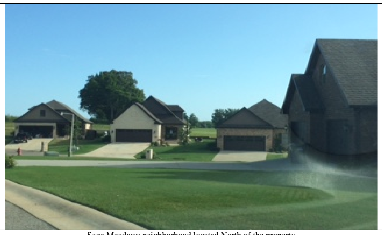
Sage Meadows neighborhood located North of the property