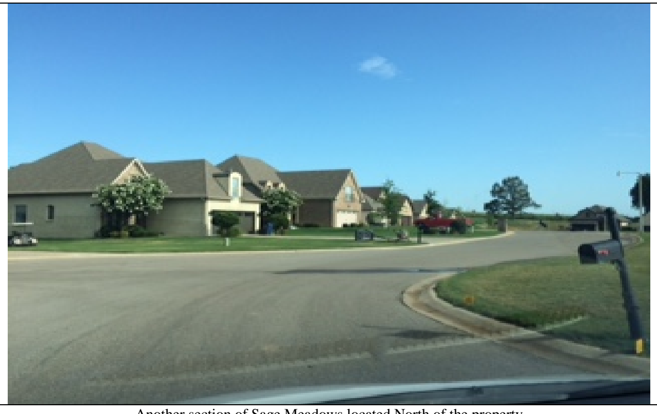
Another section of Sage Meadows located North of the property