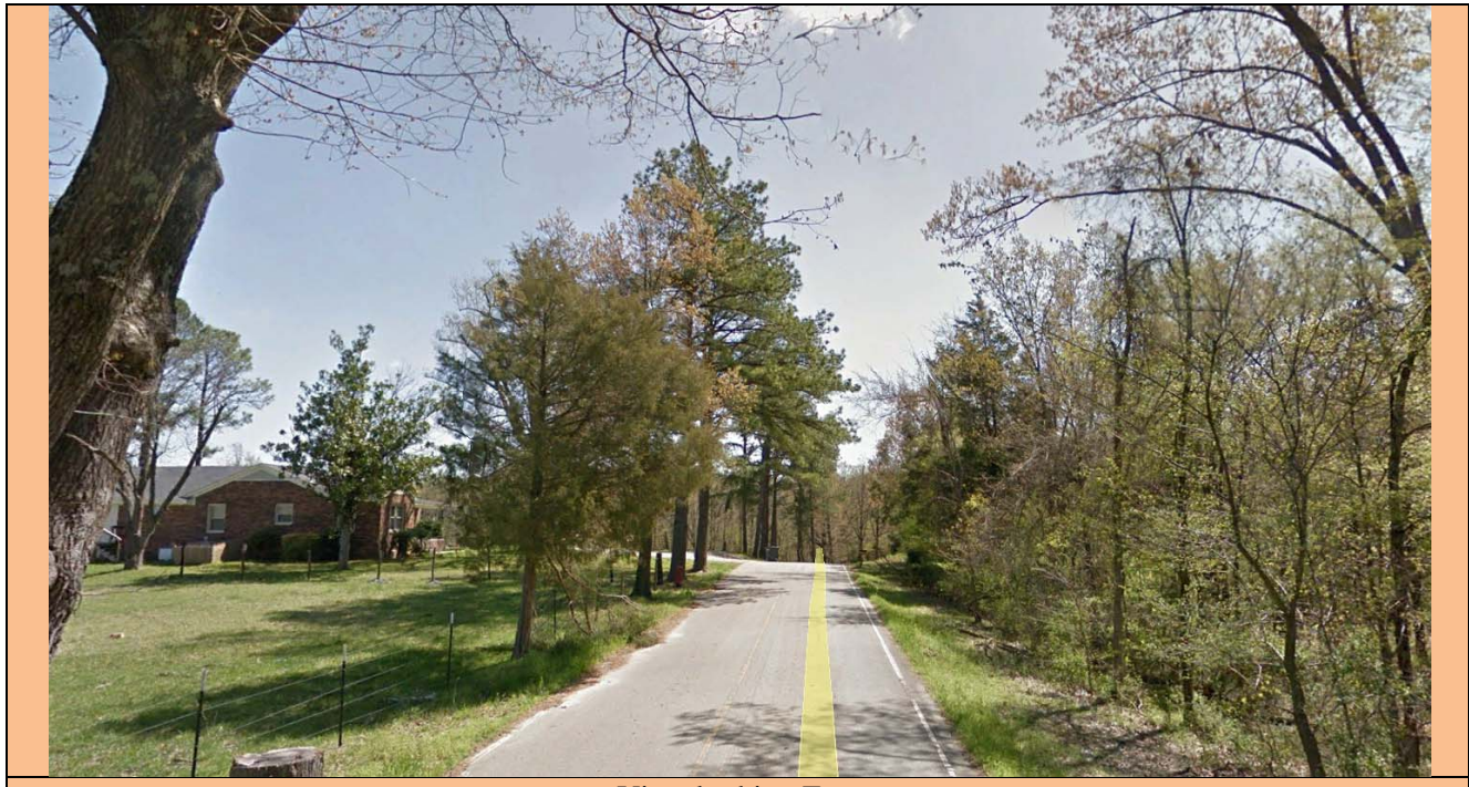
View looking East