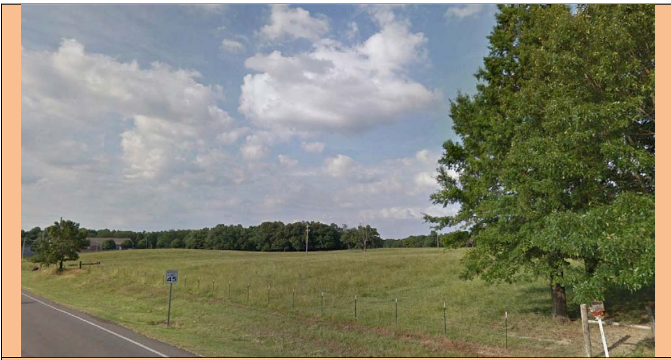
View looking North