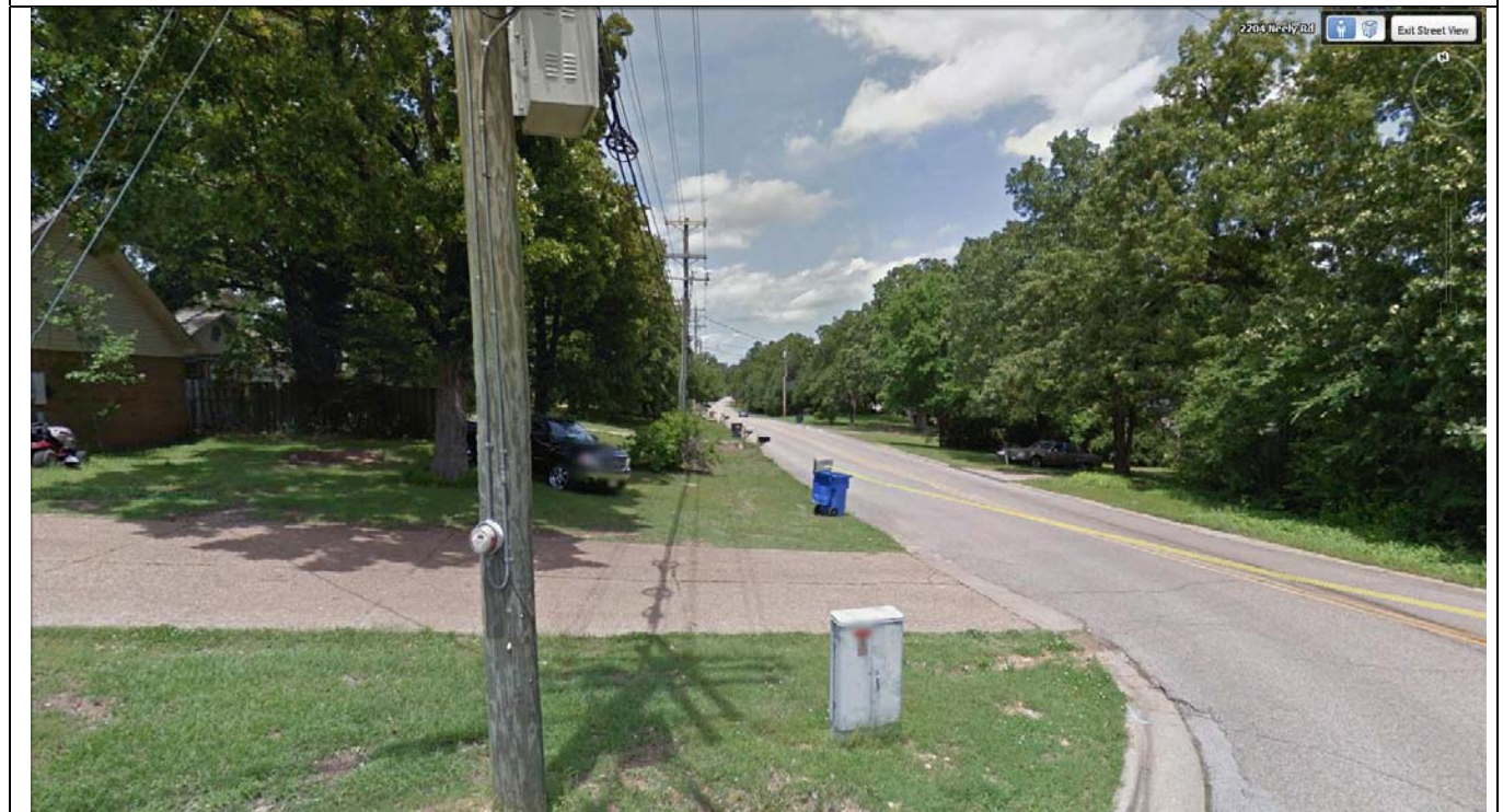
View from Neely Rd. Looking North on Wood St.