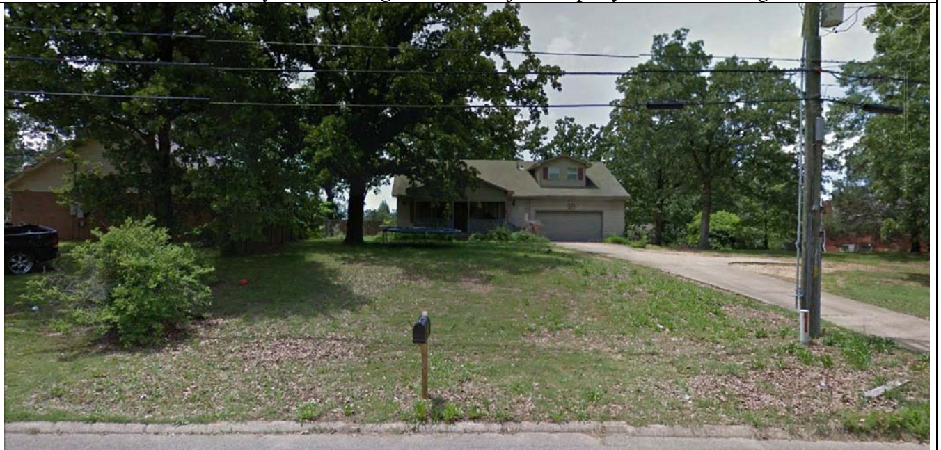
View of property looking West toward home