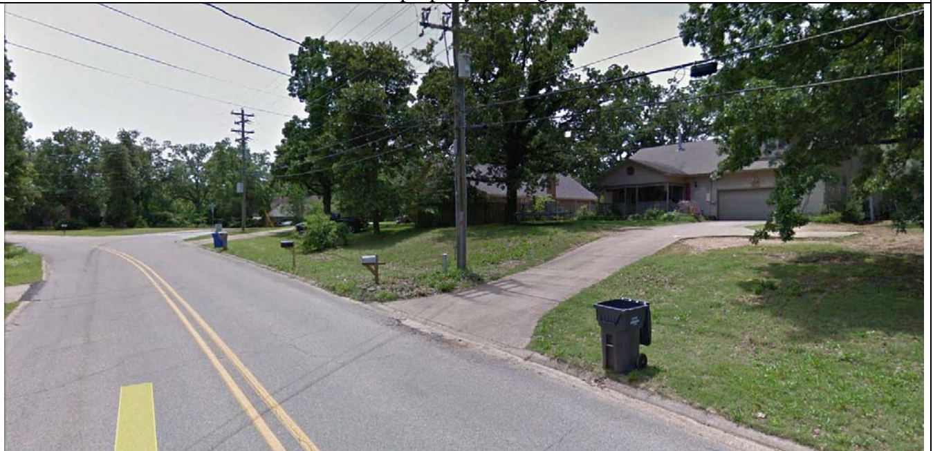
View looking South towards Neely Rd., Subject site on right