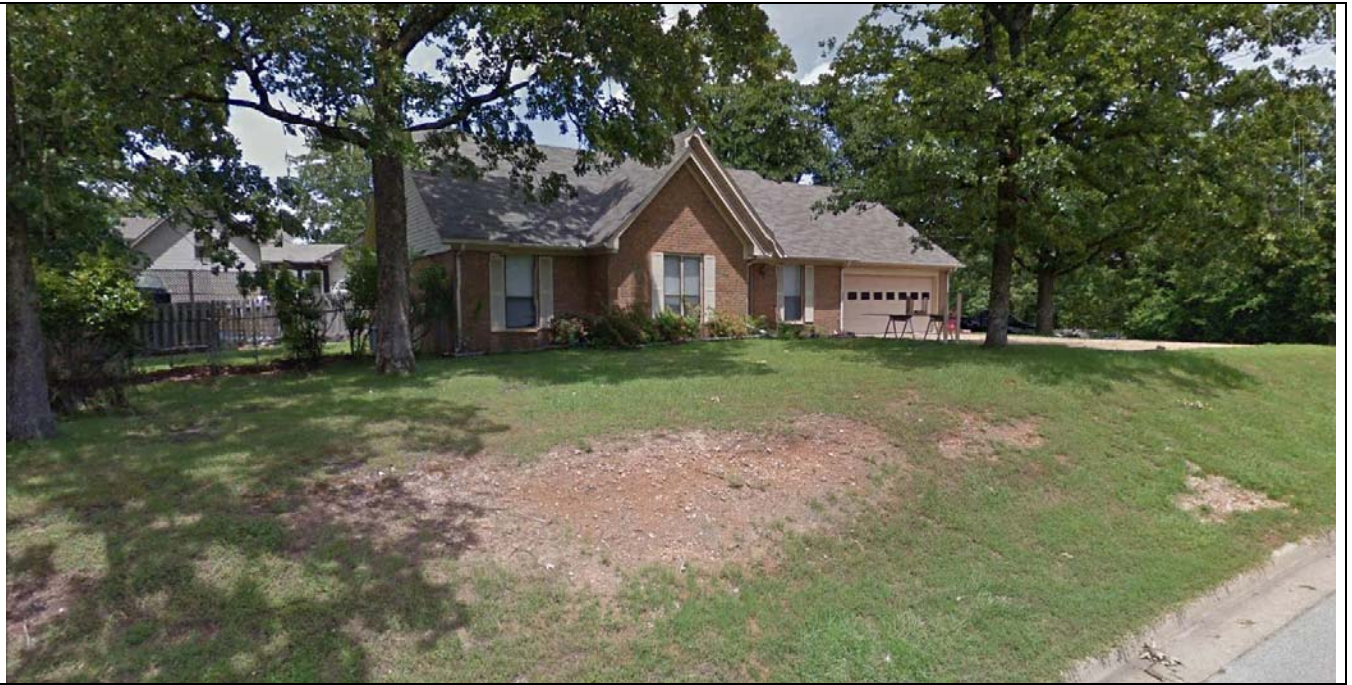
View from Neely Rd. Looking towards Subject Property / Southern Neighbor