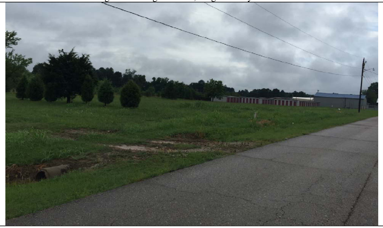
View looking West along Jonathan, from the site