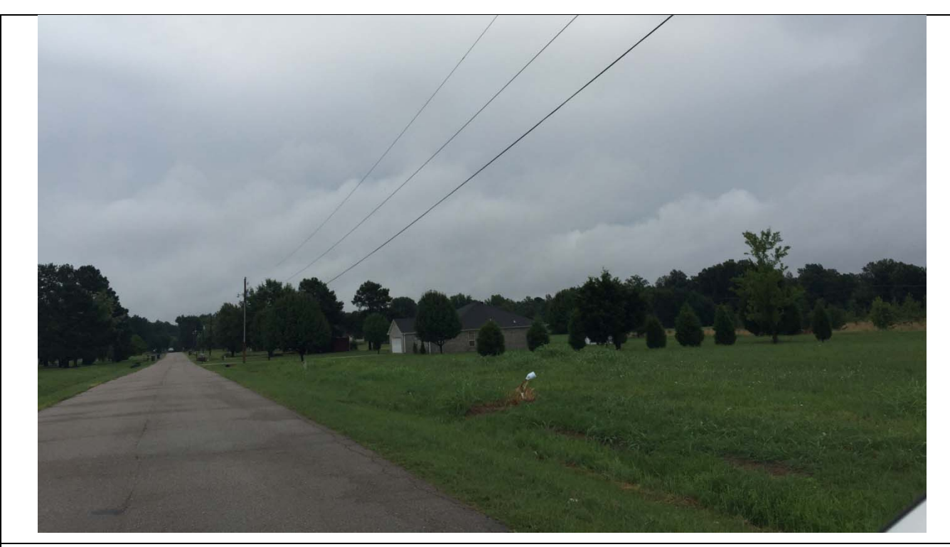
View looking East along Jonathan, Property on the Left