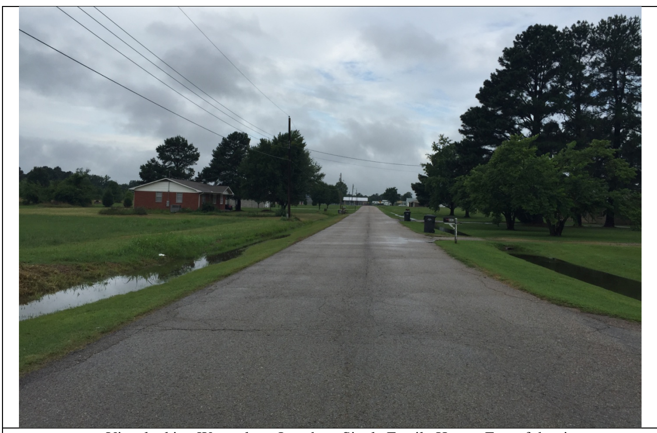
View looking West along Jonathan, Single Family Homes East of the site