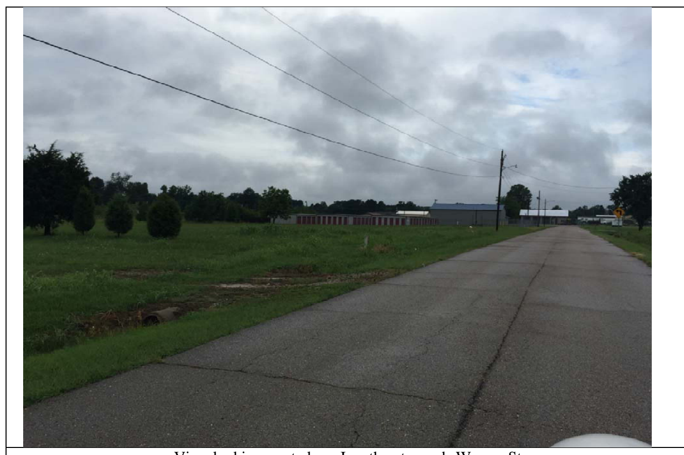
View looking west along Jonathan towards Warren St.