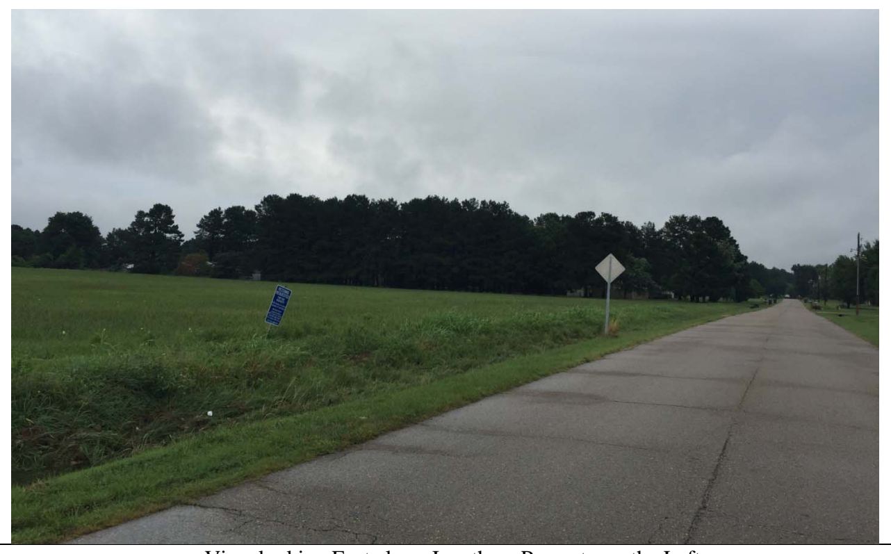
View looking East along Jonathan, Property on the Left