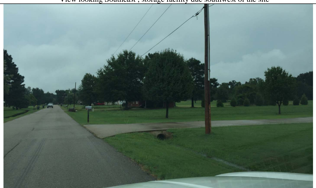
View looking East along Jonathan past the property location

View looking Southeast , storage facility due southwest of the site