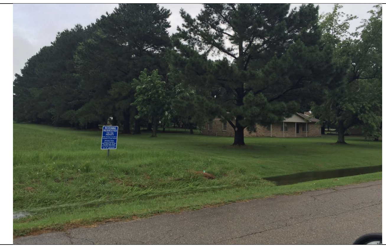
View looking Northeast toward Neighbor, along the East property line of the subject property