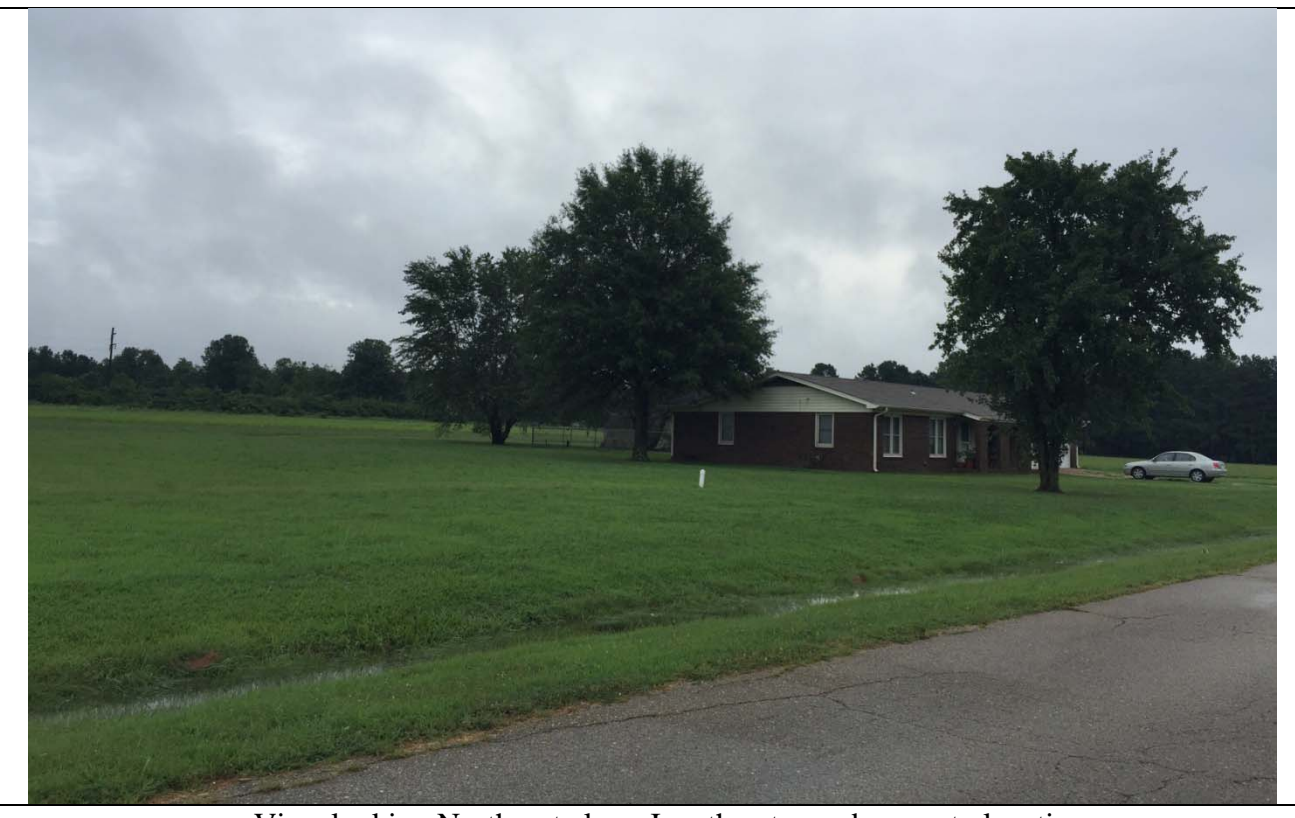
View looking Northeast along Jonathan toward property location