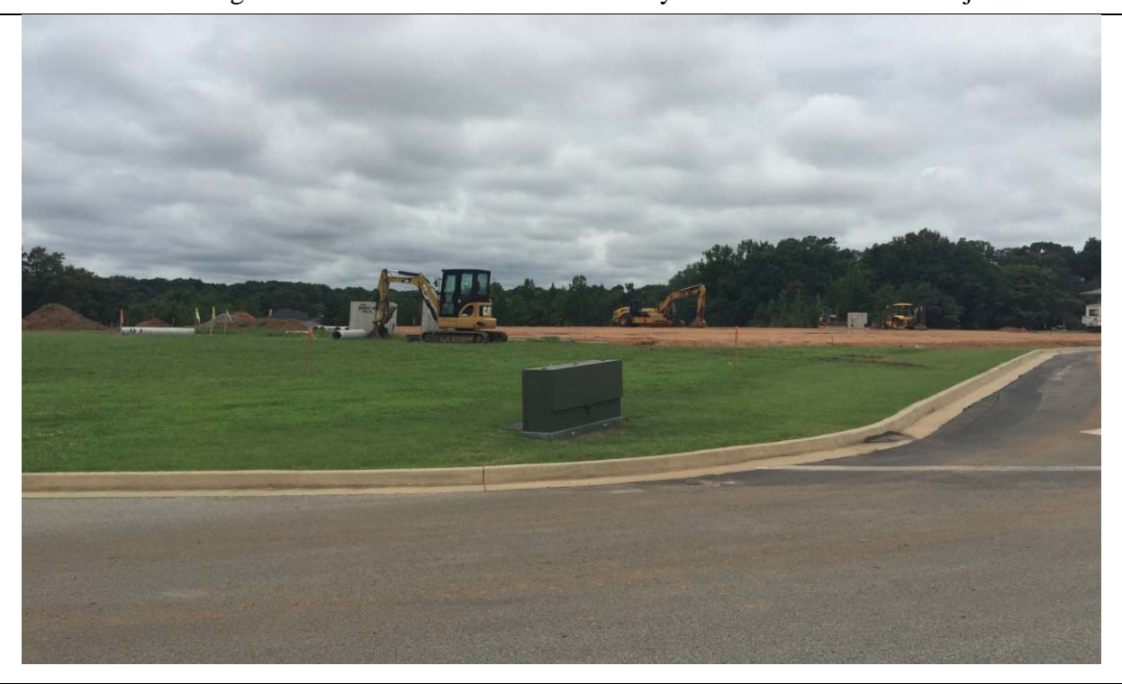
View looking Northwest from Ritter Drive towards the Forest Home Church Campus