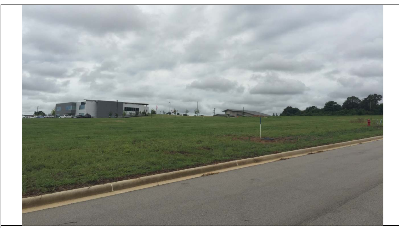
View looking Southwest from Hill Park Drive