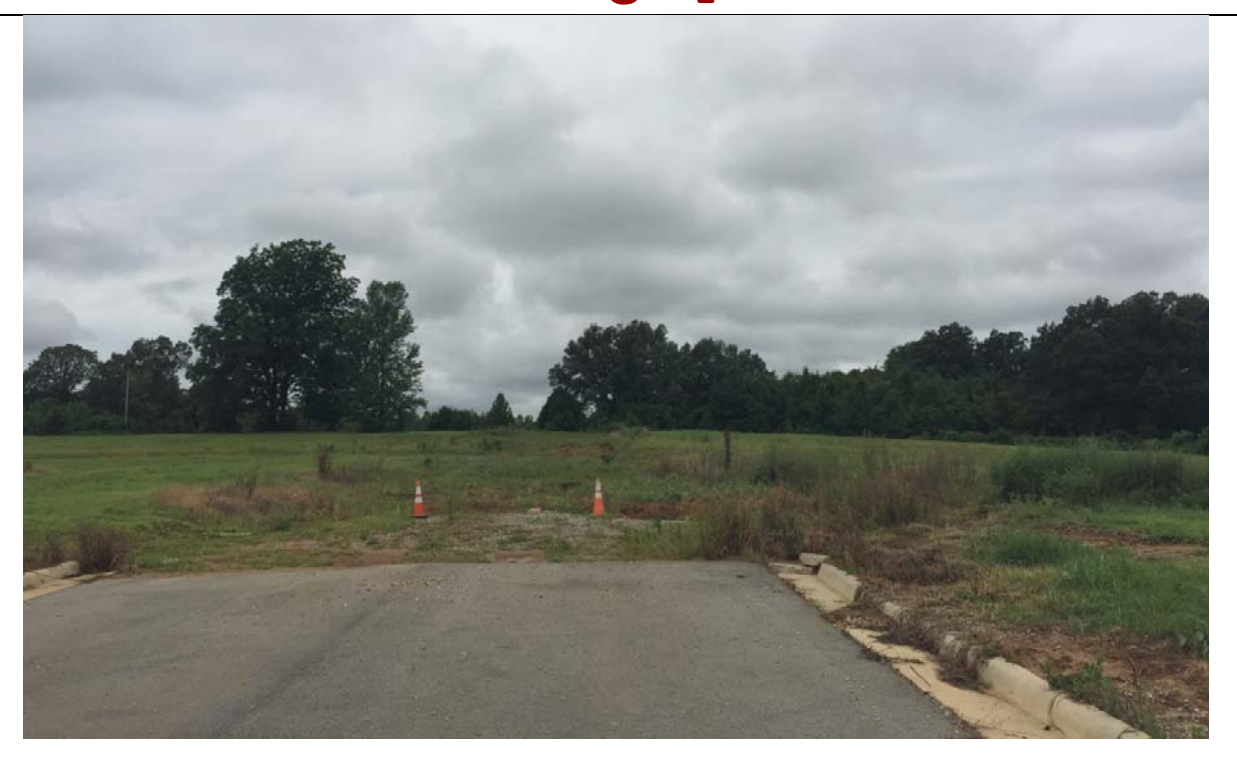
View looking West toward to subject property @ the terminus of Hill Park Dr.