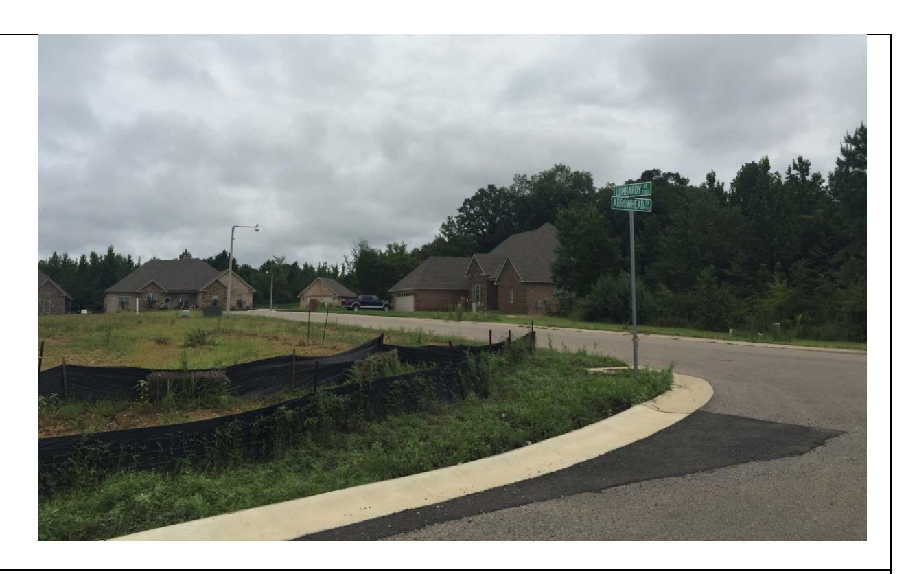
View looking Northeast from Lombardy Circle