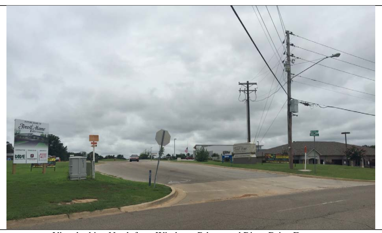
View looking North from Windover Rd. toward Ritter Drive Entrance