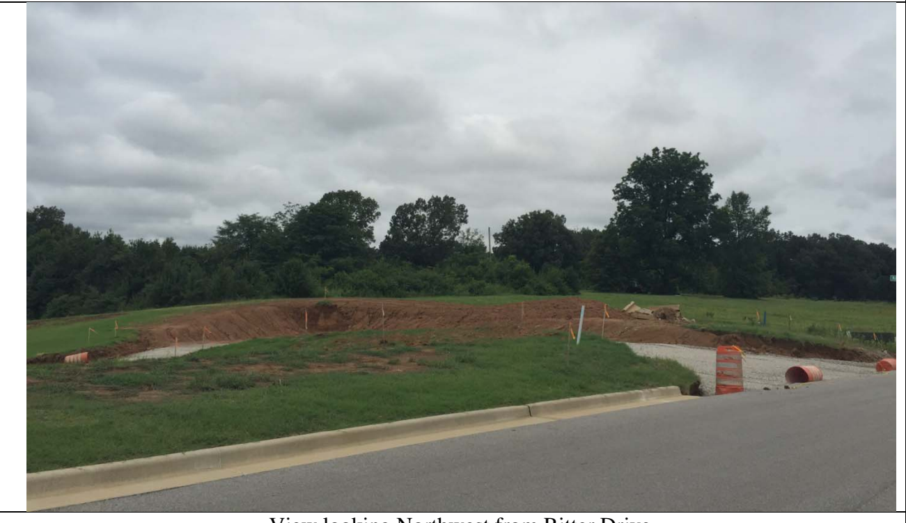
View looking Northwest from Ritter Drive