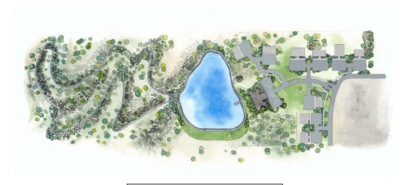
The Reserve at Hill Park

Ritter Drive and Hill Park Drive are unrecorded but approved street right of ways that have not been completed and connected; however each will serve the proposed entry to the development. The schematic layout/concept plan shows approximately 10 office spaces to be accessed from said street terminus points.