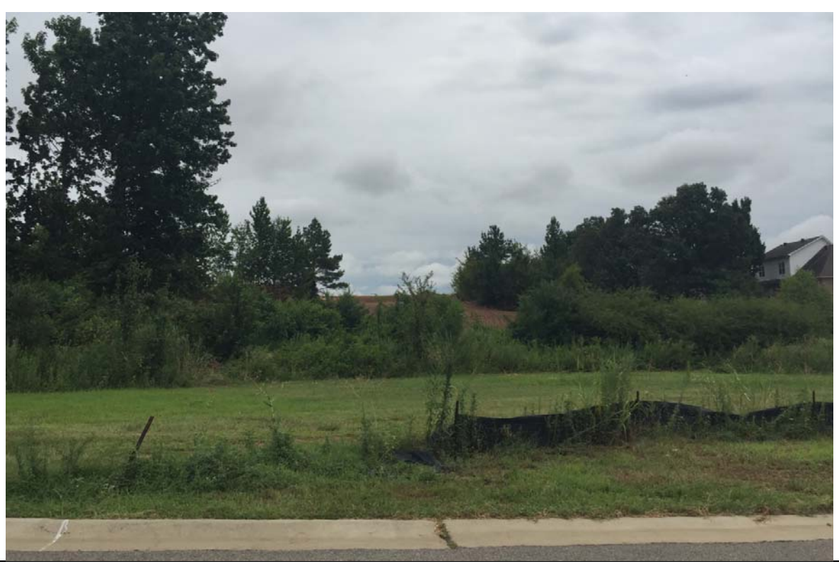
View looking East toward Forest Home Church Property from Lombardy Dr.