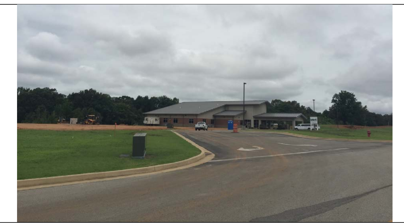
View looking Northwest from Ritter Drive towards the Forest Home Church Campus