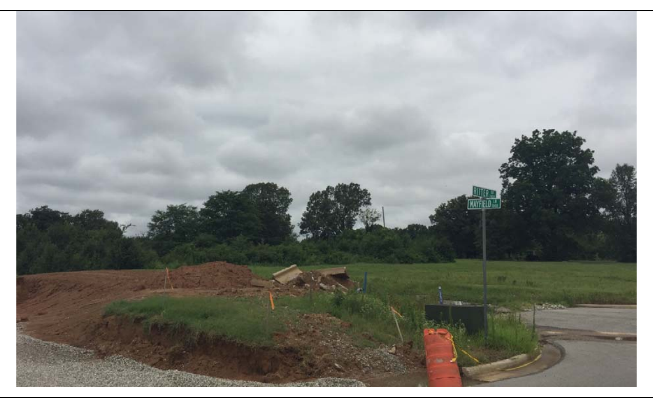
View looking Northwest from Ritter Drive @ Mayfield Dr. towards the Subject Site