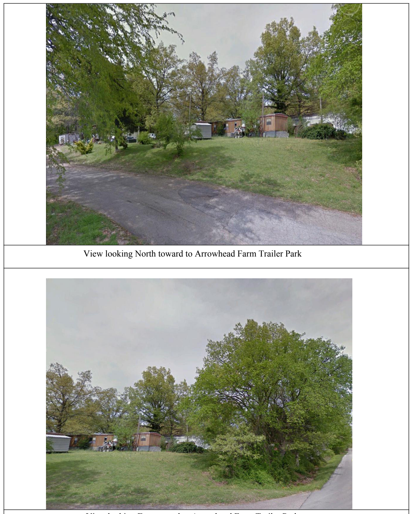
View looking East toward to Arrowhead Farm Trailer Park