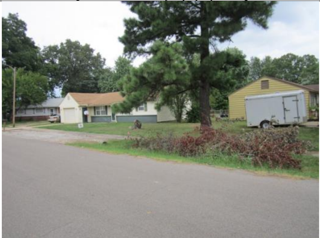
View looking north toward properties located on the east side of Fair Cove.