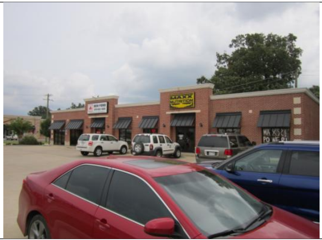
View looking northeast toward property located at the northwest corner of the subject property