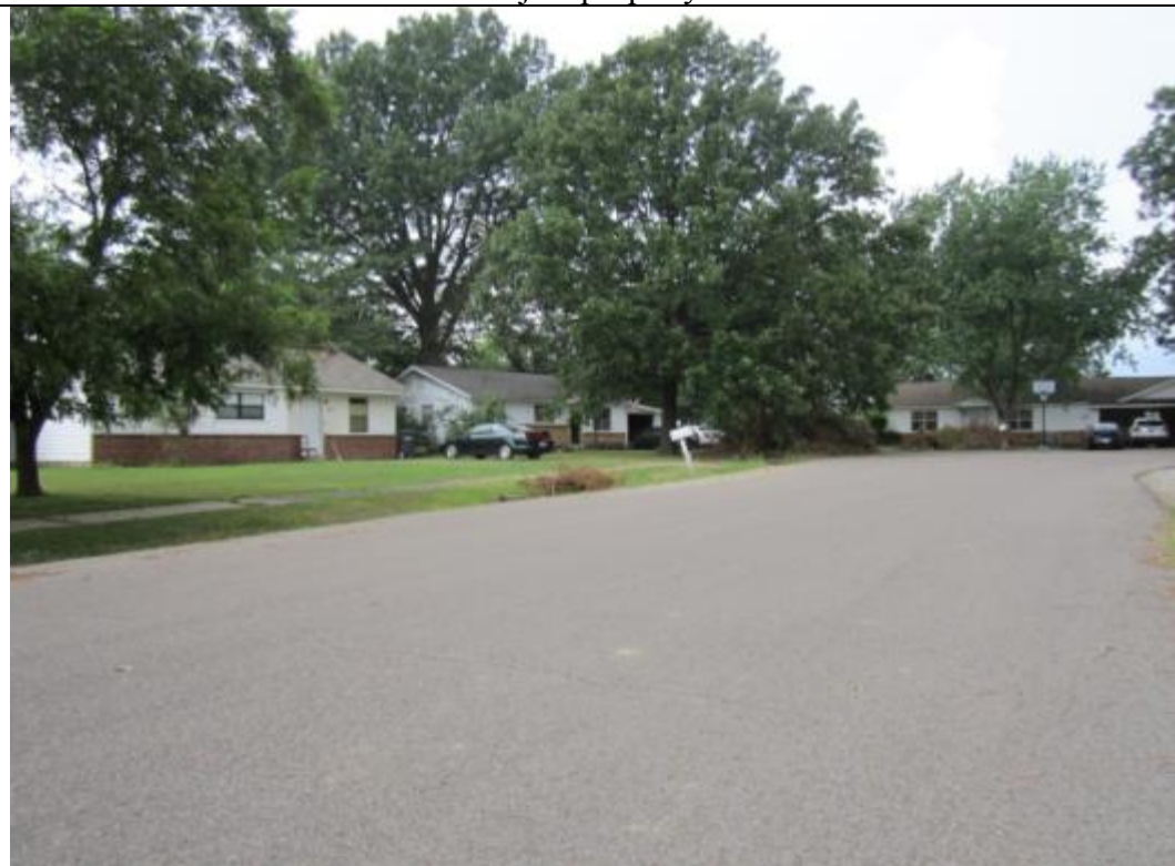
View looking northwest toward subject property fronting Fair Cove.