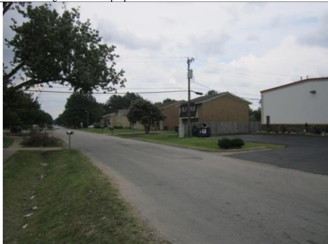
View looking east toward properties located on the south side of Fairview Drive.

View looking west toward properties located on the south side of Fairview Drive.