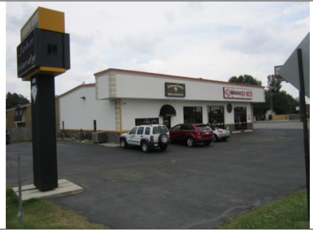
View looking southeast toward property located on the southeast corner of Red Wolf Blvd. and Fairview Drive.