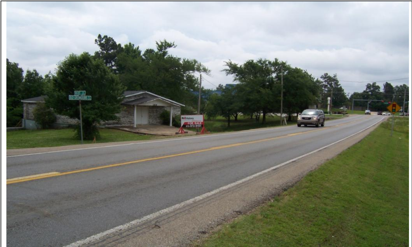
View looking to the east along Old Greensboro Rd of C-3 L.U.O. property.