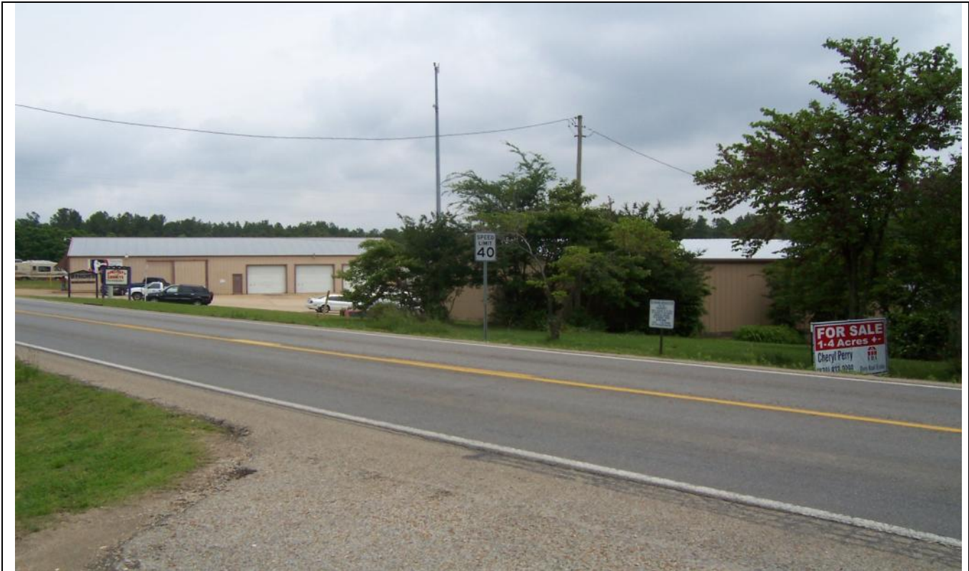
View looking northeast along Old Greensboro Rd.