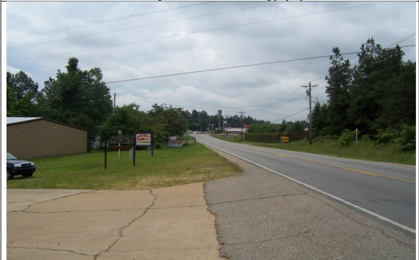
View looking to the south from area north of the site.