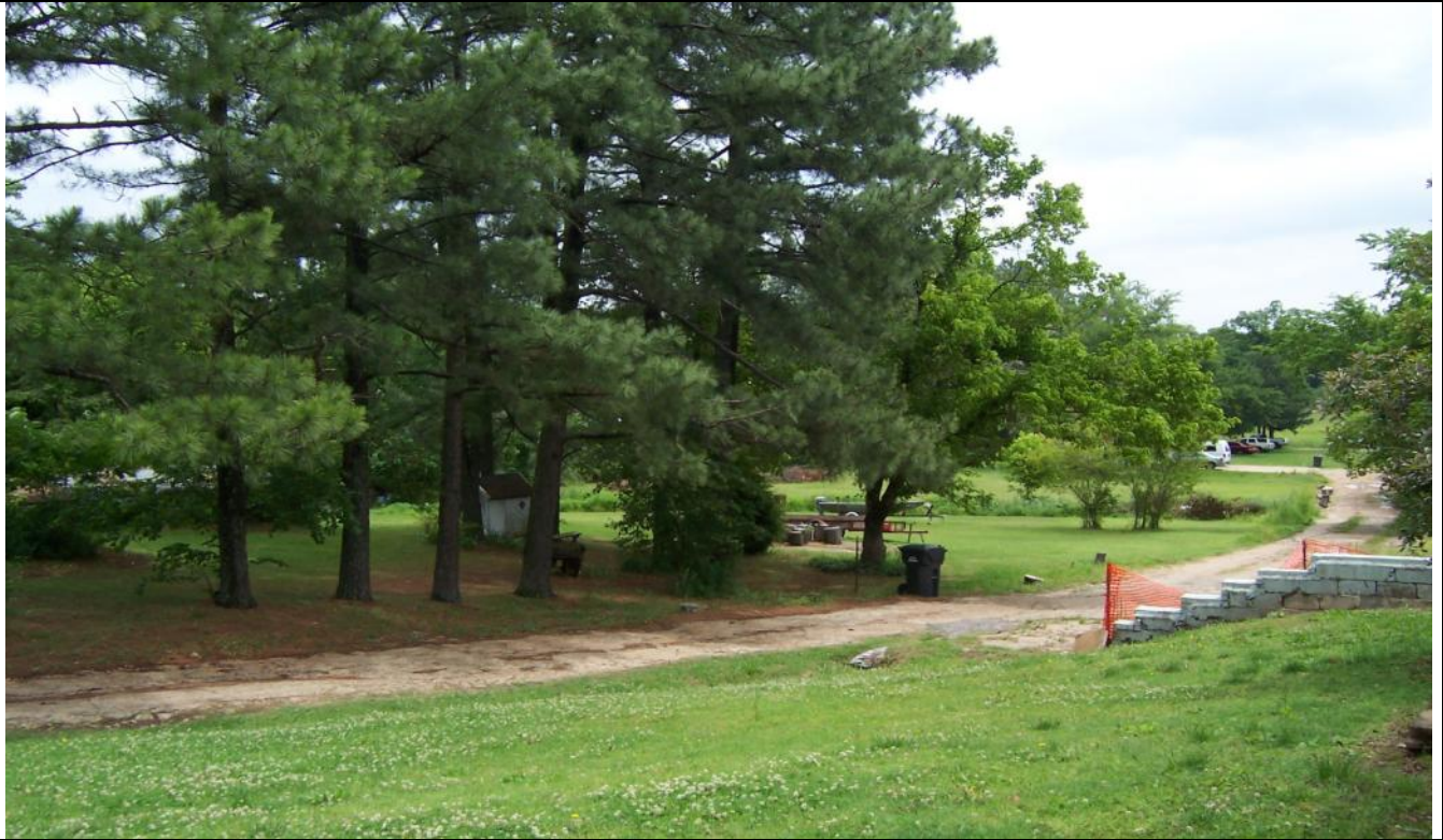
View looking northeast of the subject site's ingress/egress easement.