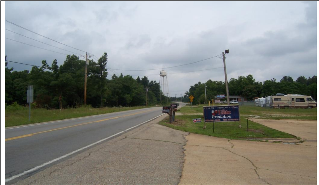
View looking to the north from the abutting property.