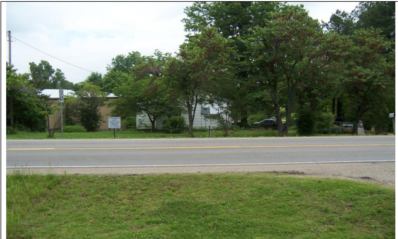
View looking east at the subject property.