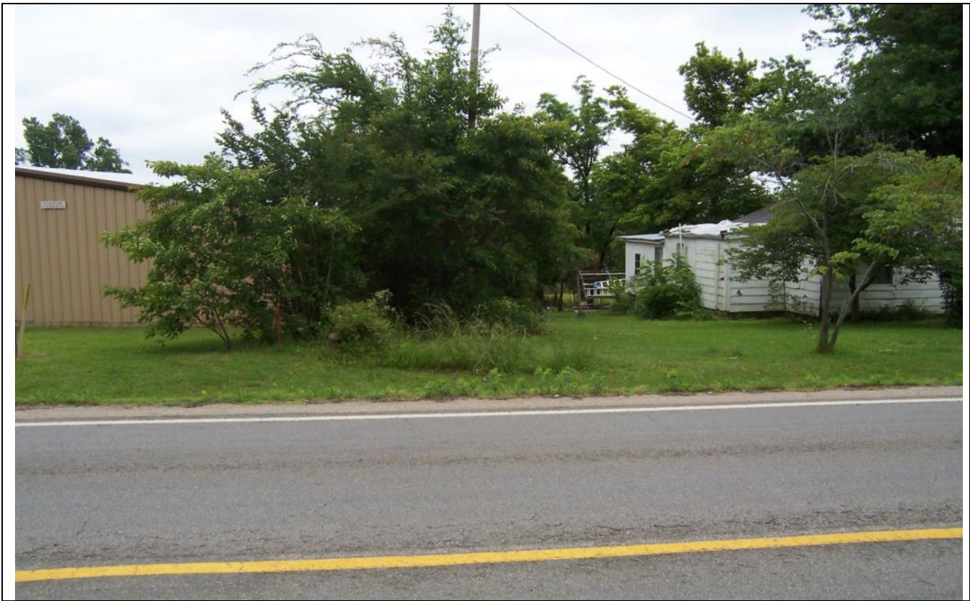
View looking to the east from Old Greensboro Rd.