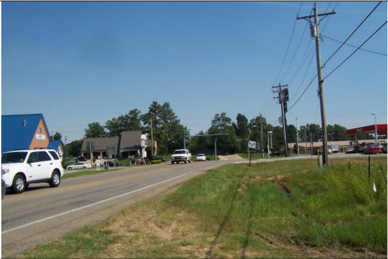
View looking South on Old Greensboro Rd.