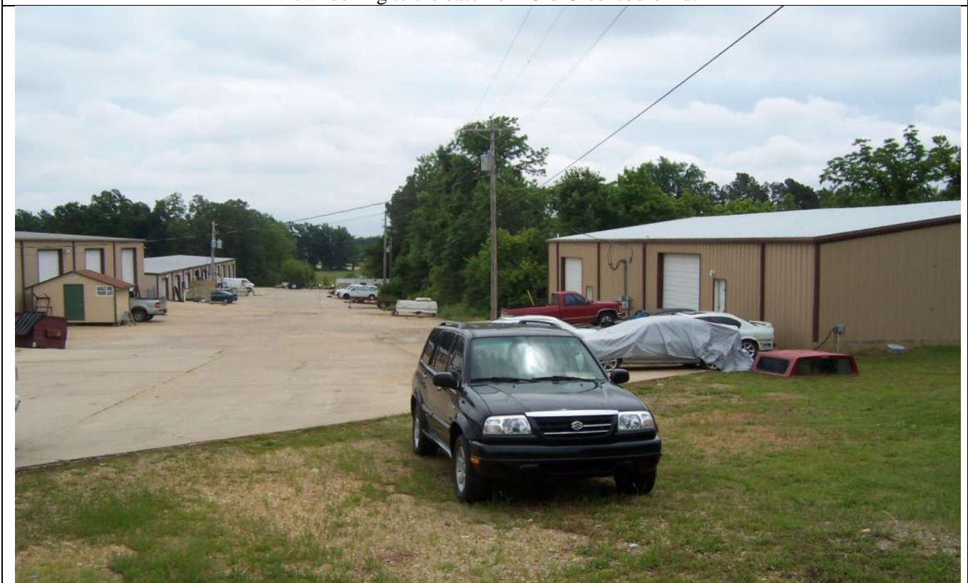
View looking at the abutting industrial properties.