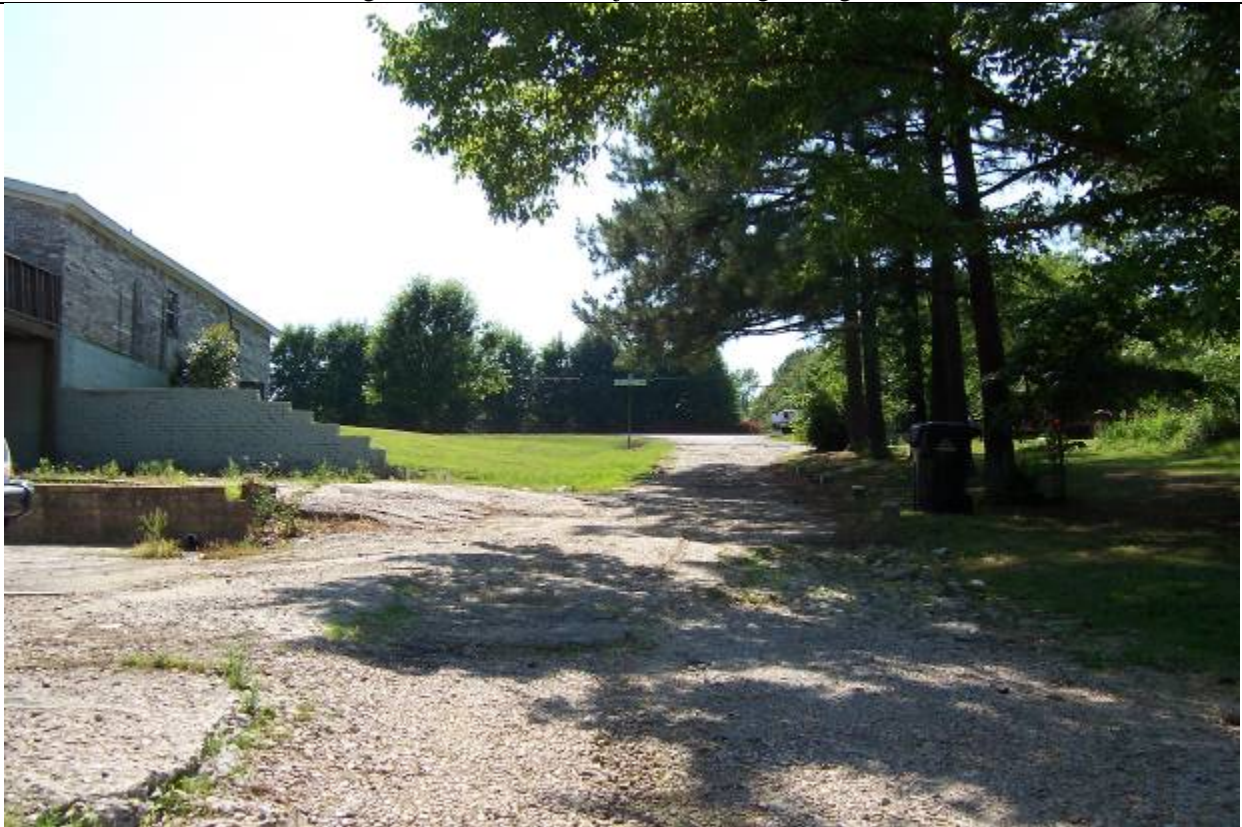
View looking West from site towards Greensboro Rd. 351