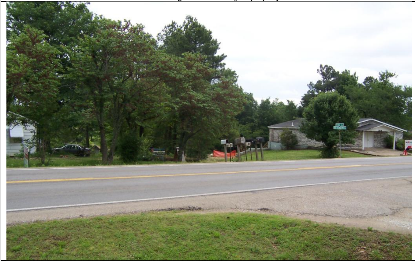
View looking east of the subject site's ingress/egress easement.