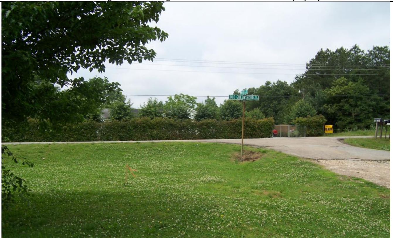
View looking west from intersection.