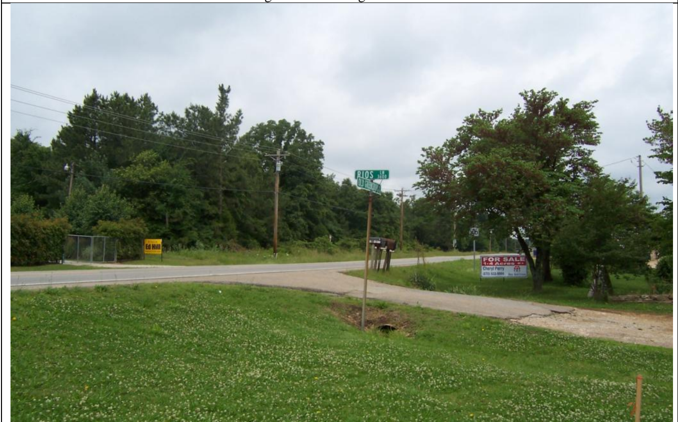
View looking to the northwest along Old Greensboro Rd.