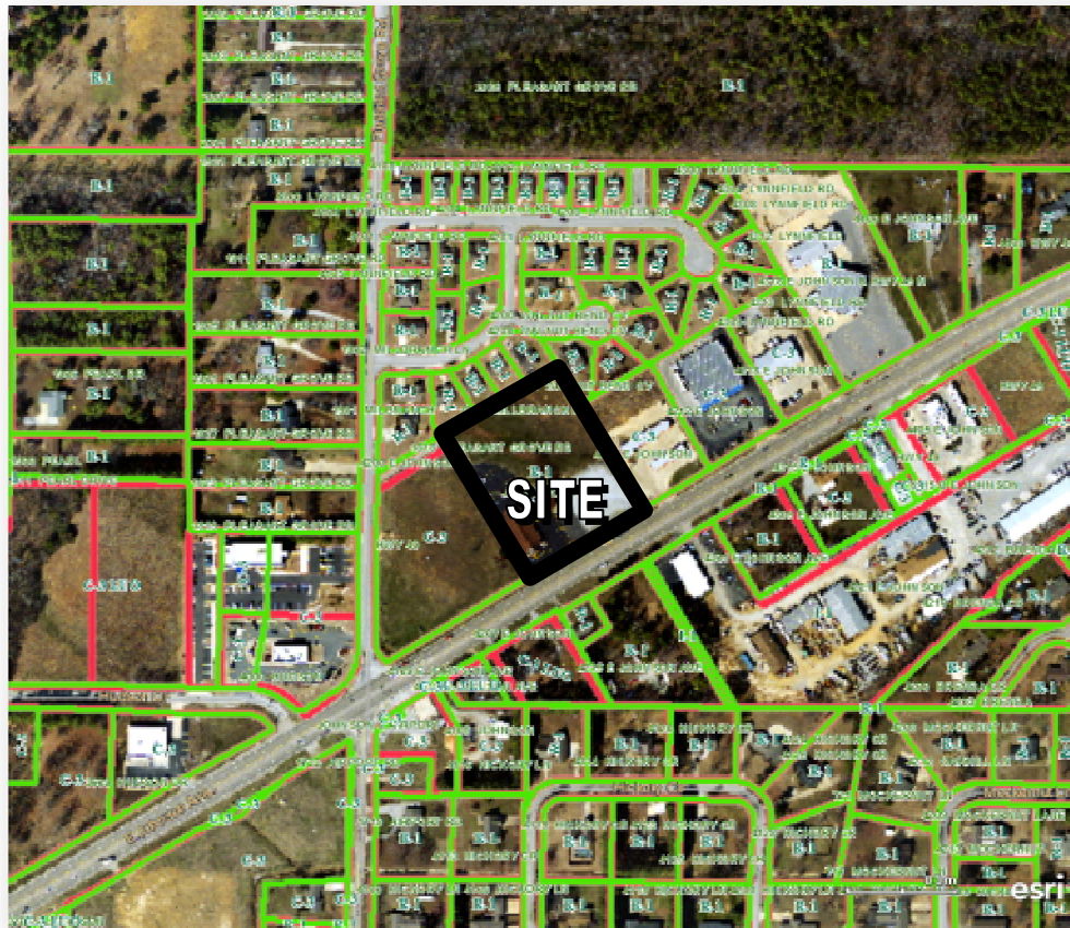
Vicinity Zoning Map