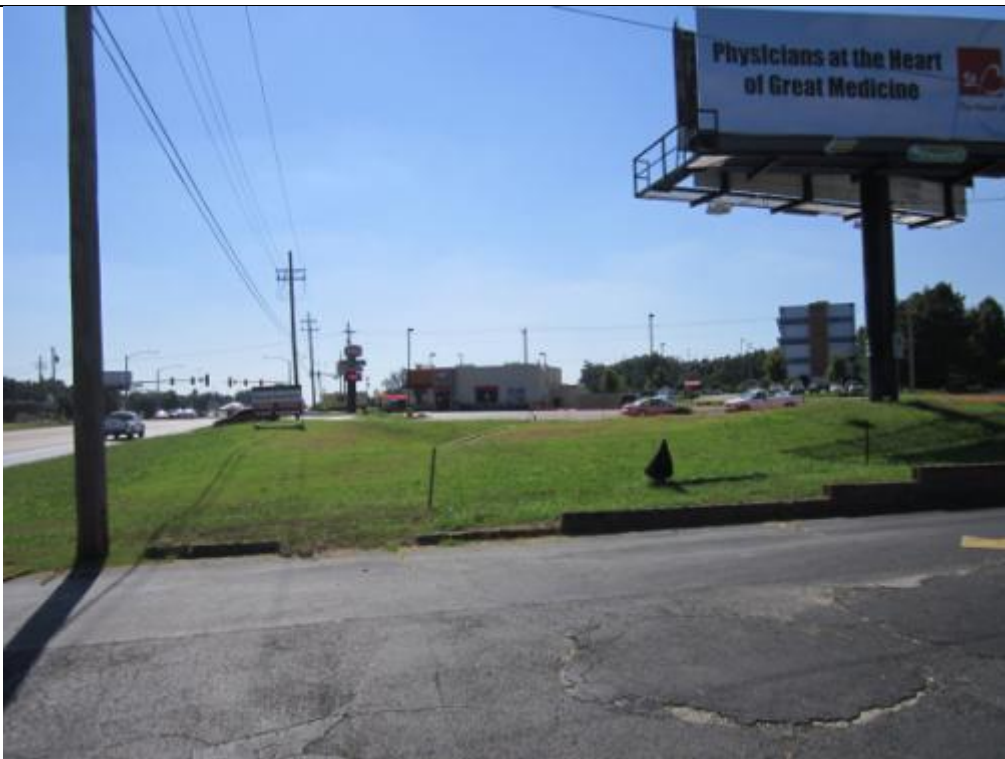
Property located west of site. Zoned C-3.