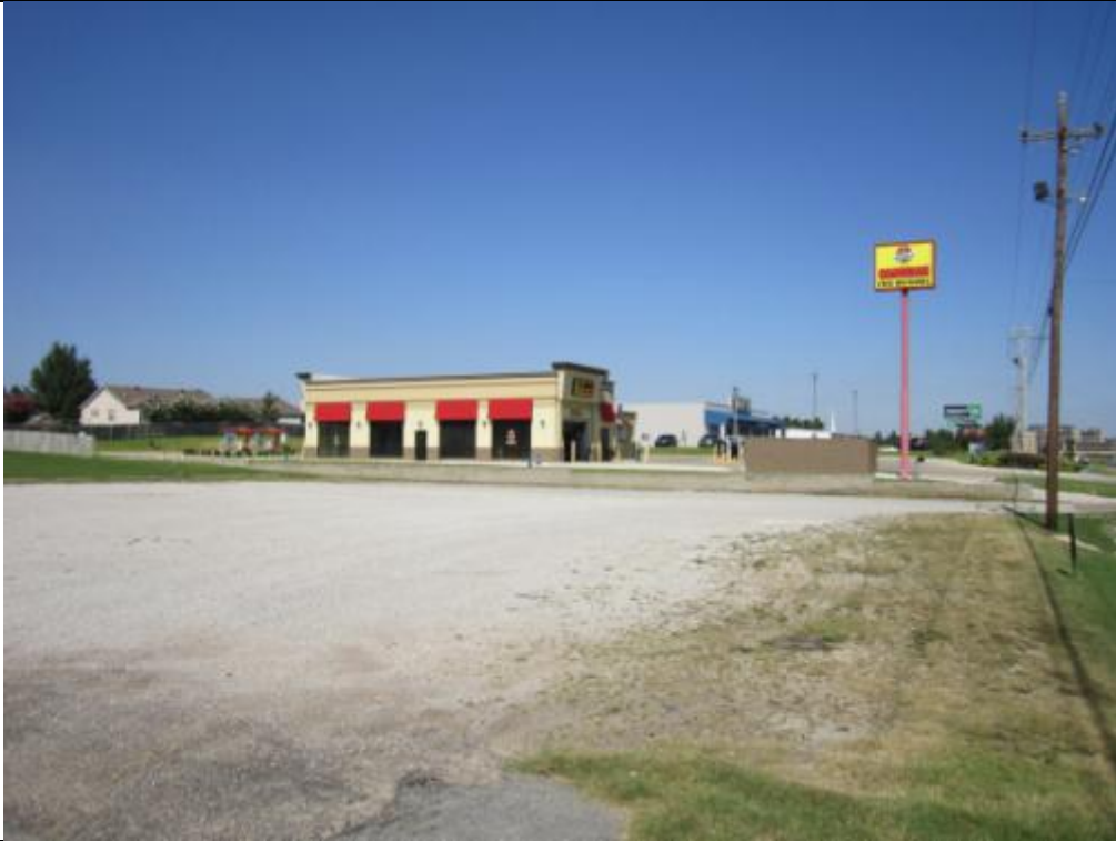
Property located east of site. Zoned C-3.