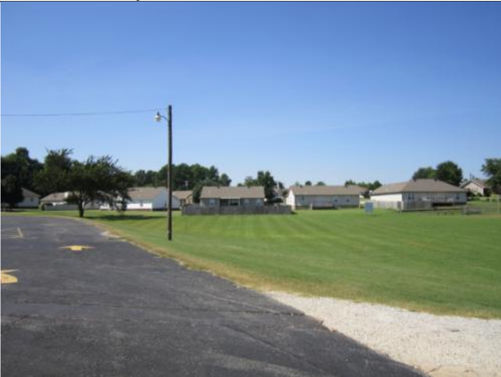
Residential neighborhood located north of site. Zoned R-1.