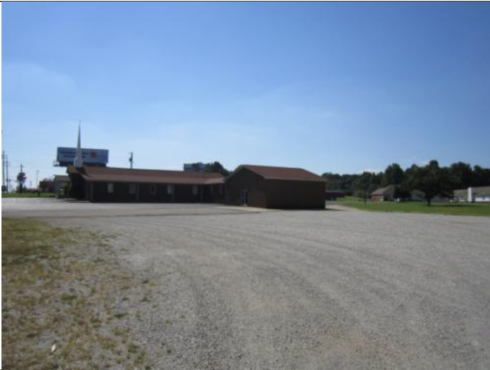
Subject site located at 4200 East Johnson Ave.