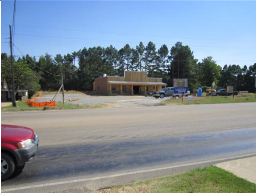
Property located southwest of site. Zoned C-3 LUO.