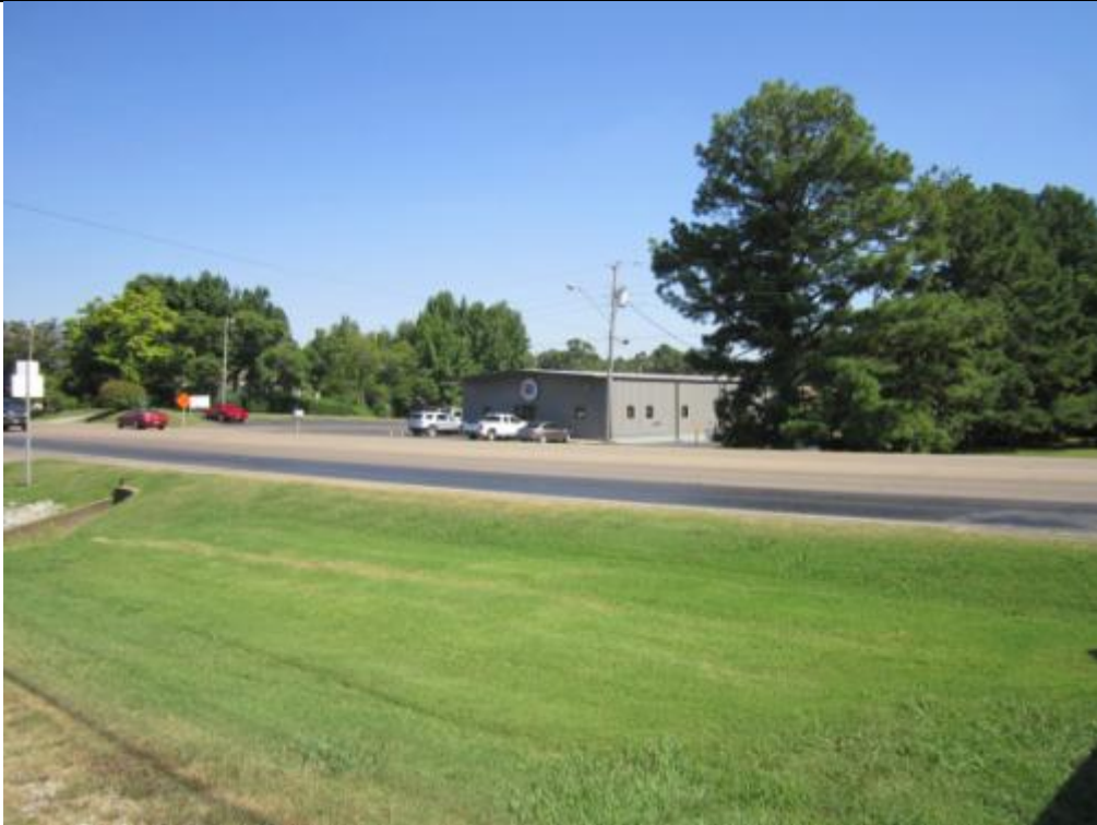
Property located southeast of site. Zoned I-1