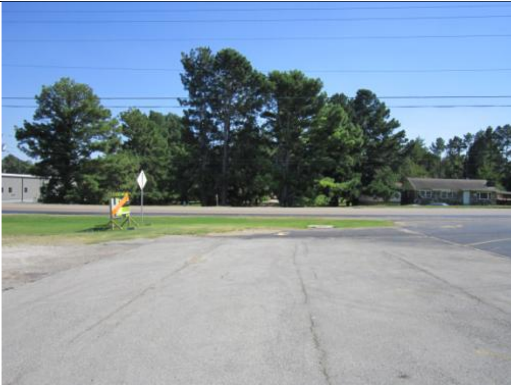
Residences located south of site. Zoned R-1.