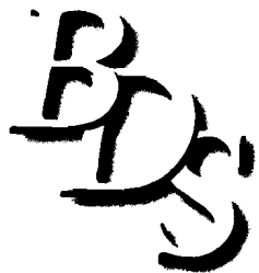
Exhibit "B" – Hourly Fee Schedule