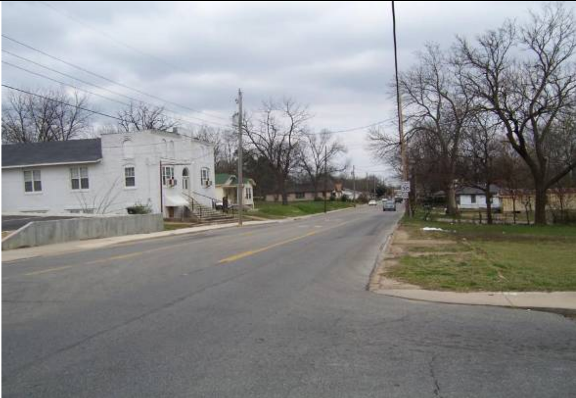
View looking West along Washington Ave.