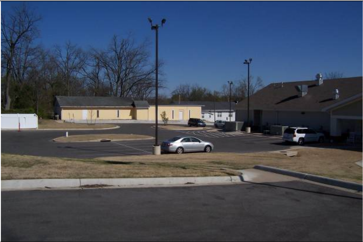
View looking West towards subject site