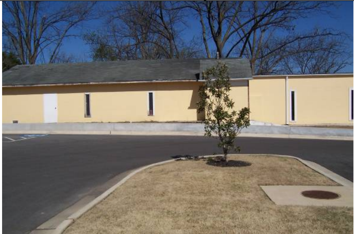
View of Site looking East