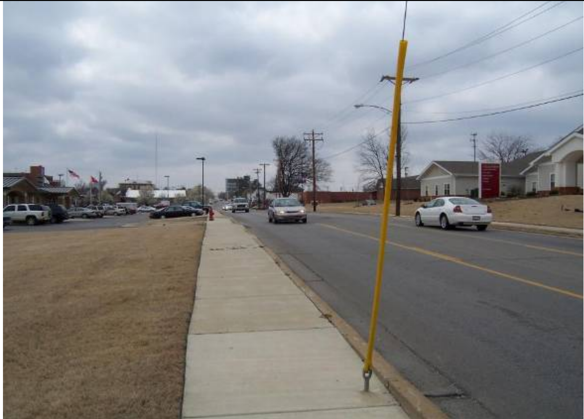
View looking toward the West along Washington Ave.