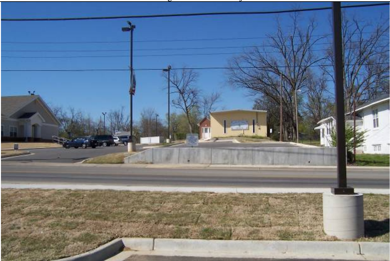
View of the site looking North