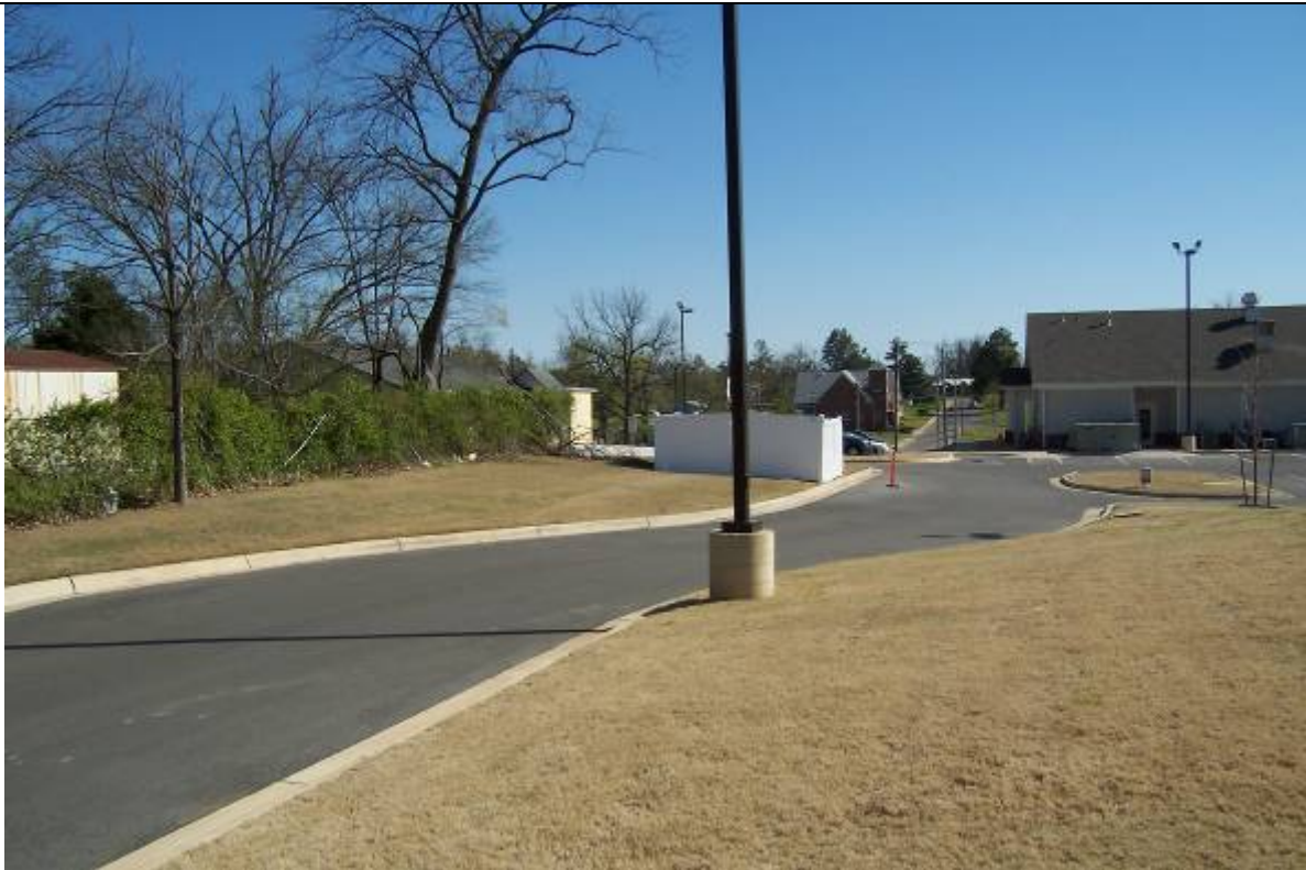
View of the site looking South