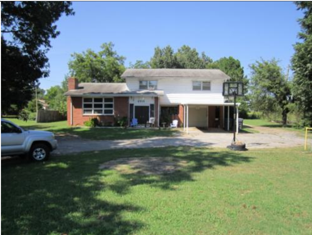
One of two residences located east of site. Zoned C-3 LUO