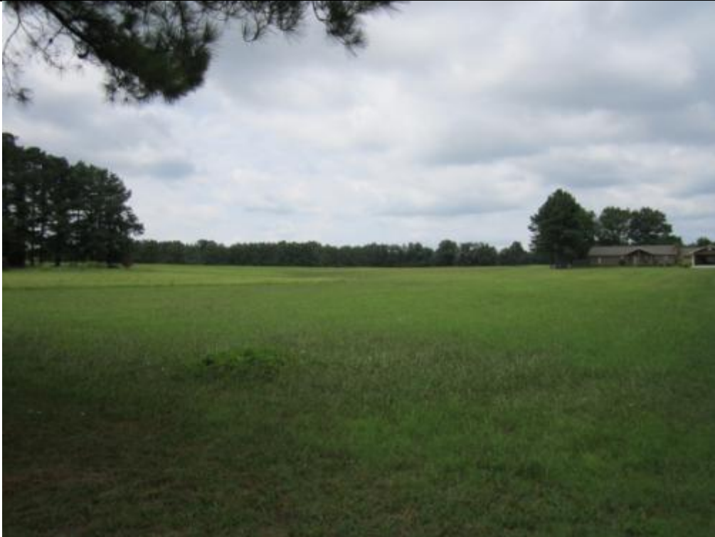
View of adjacent property located to the west of site. Zoned C-3 LUO.