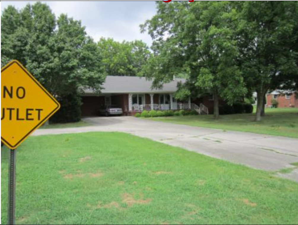
Residence located on southern portion of site at 5710 East Johnson Ave.