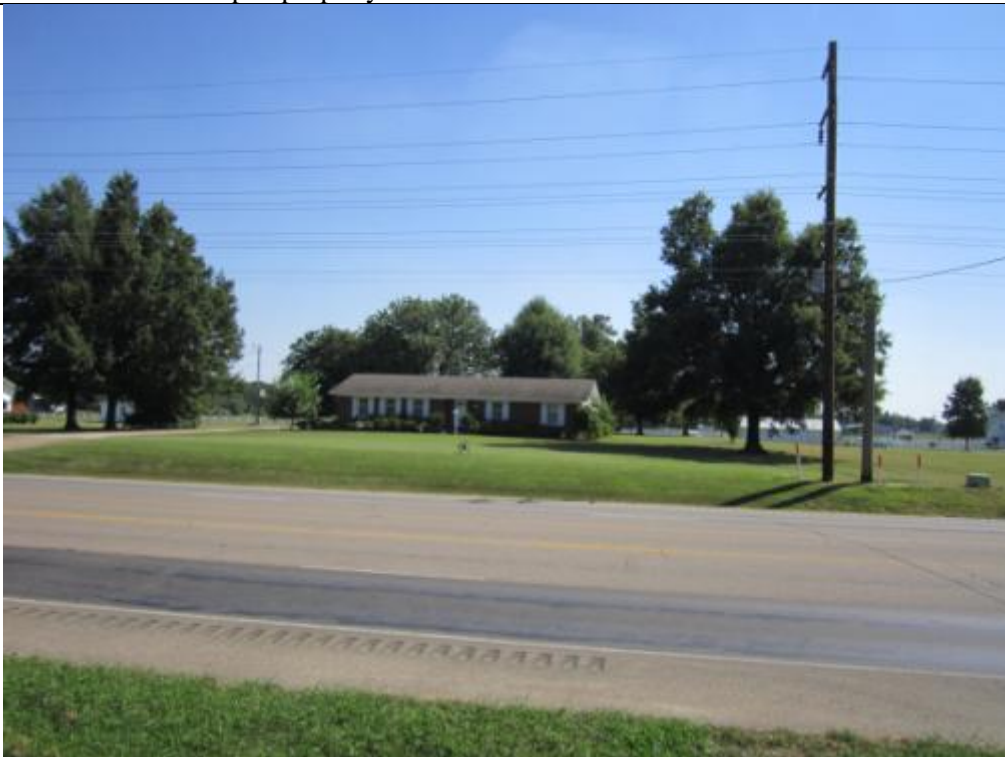
Residence located southeast of site. Zoned R-1.