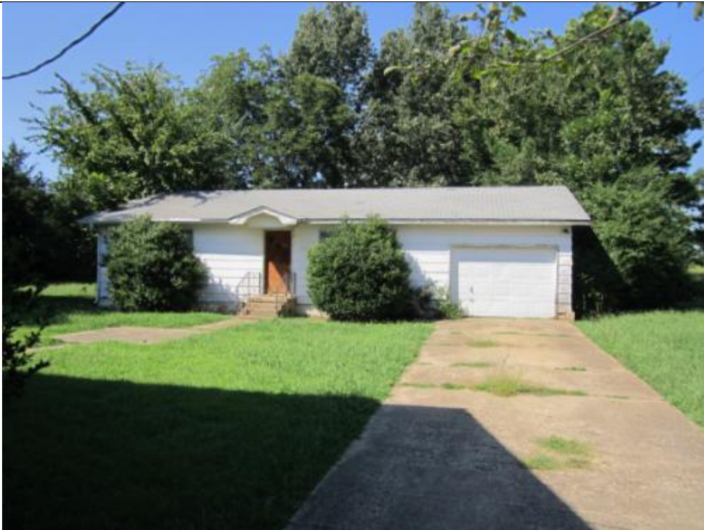
One of two residences located east of site. Zoned C-3 LUO