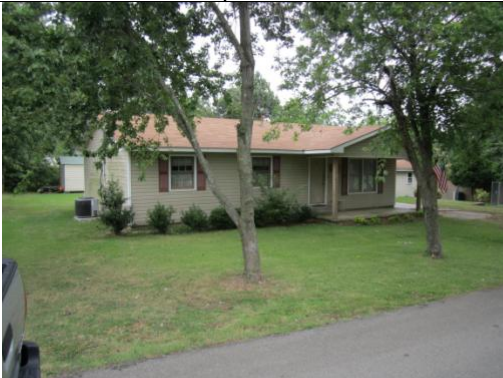
Residence located on northern portion of site at 2006 Greenway Lane.