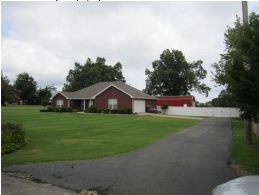
Residence located north of site at 2010 Greenway Lane. Zoned R-1.