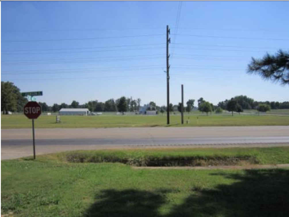
Undeveloped property located southwest of site. Zoned C-3 LUO.