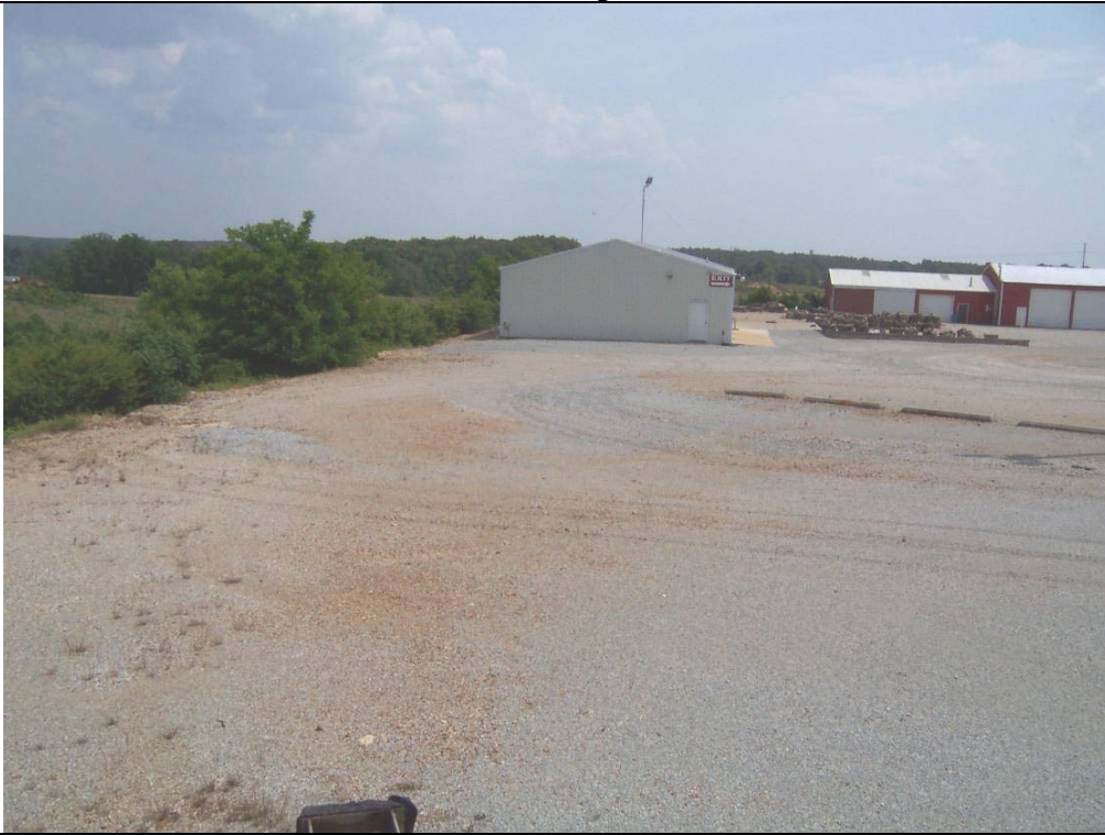
View of the rear property site looking to the southeast