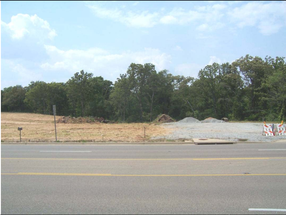
View looking west