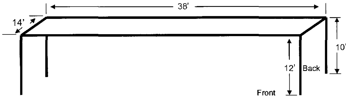
Bleacher & Dugout Covers 2 - 38' Sections connected using same Center Columns