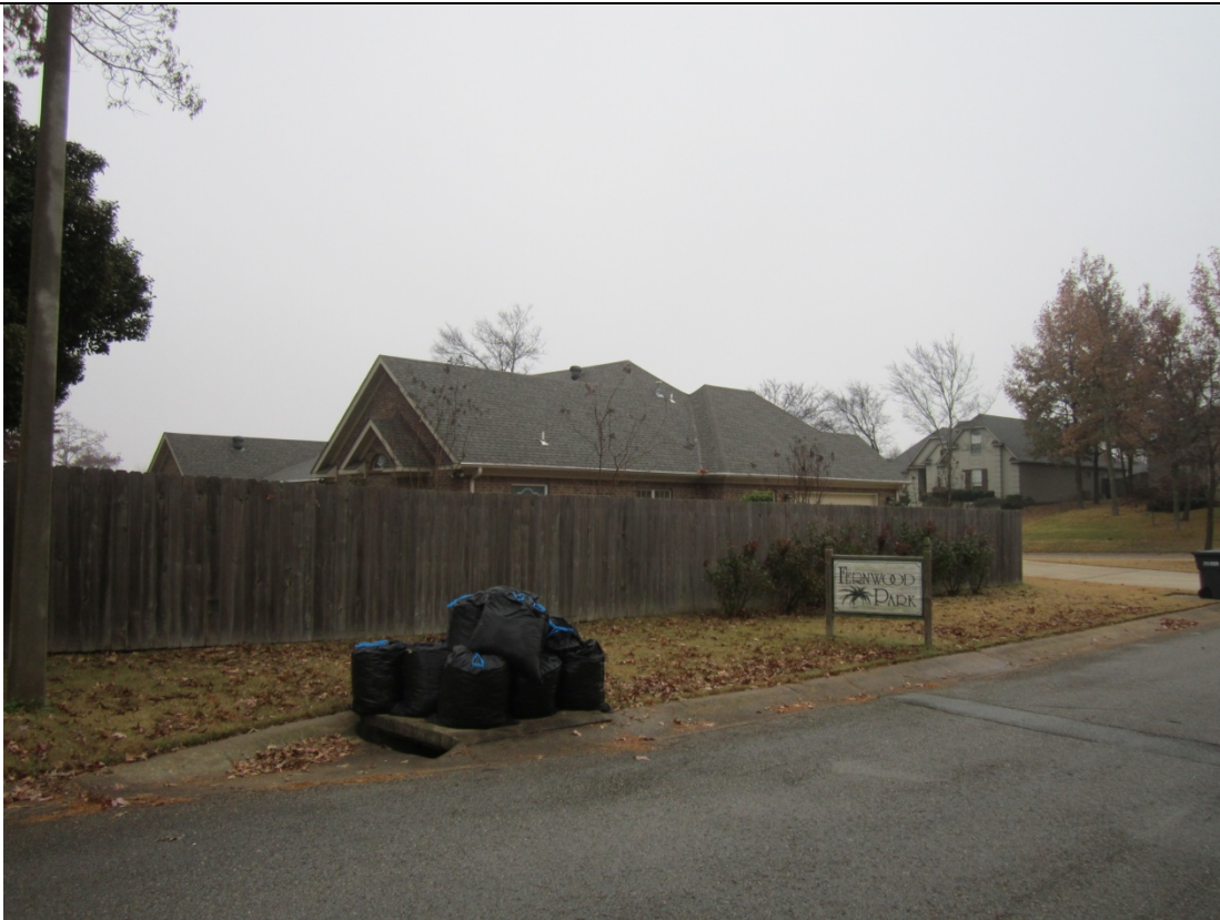
Property located south of subject site at 902 Fernwood Dr.