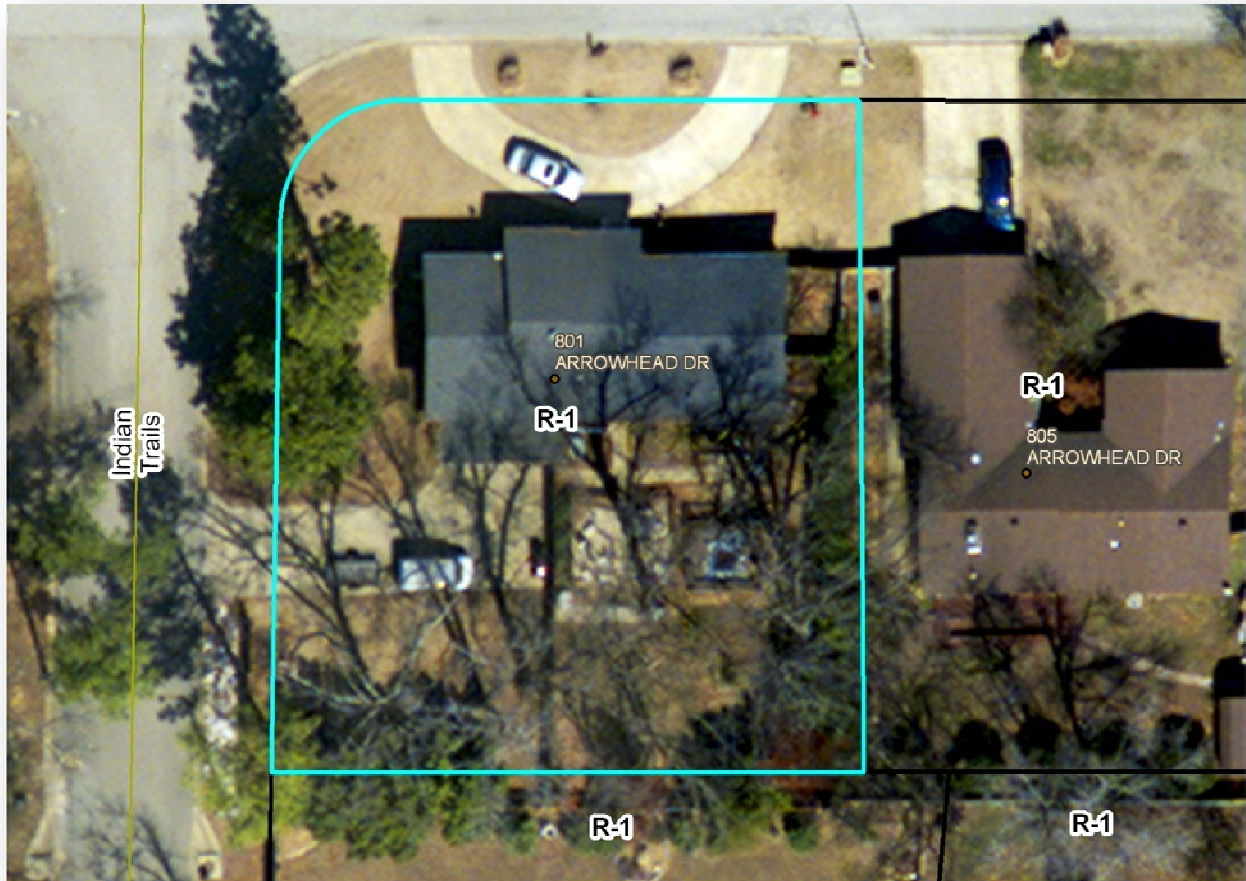
Enlarged Aerial View

In review of the current application, there were no reasons or findings of conflict of Section 117-199, (Zoning Ord., § 14.24.02), that would deem the propose use unfit for the site location. As illustrated in the photographs, the home location has ample space area to ensure child safety and assurance that traffic congestion never occurs. Staff recommends that the outdoor play area be fenced in, defined and secured as an added amenity. It appears that there is ample stacking of 4 or 5 cars for drop off. Hours of vehicular pick-up needs to be coordinated to prevent any impact on the current traffic volume in the area.