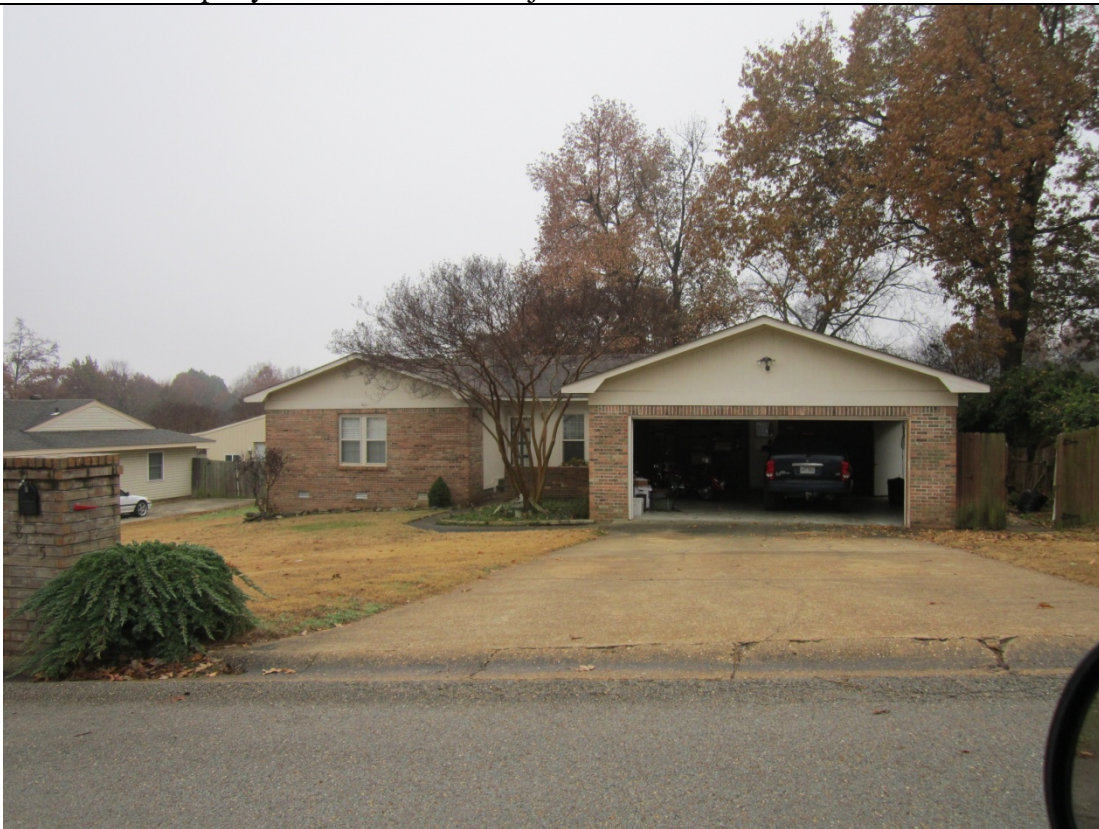
Property located east of subject site at 805 Arrowhead Dr.