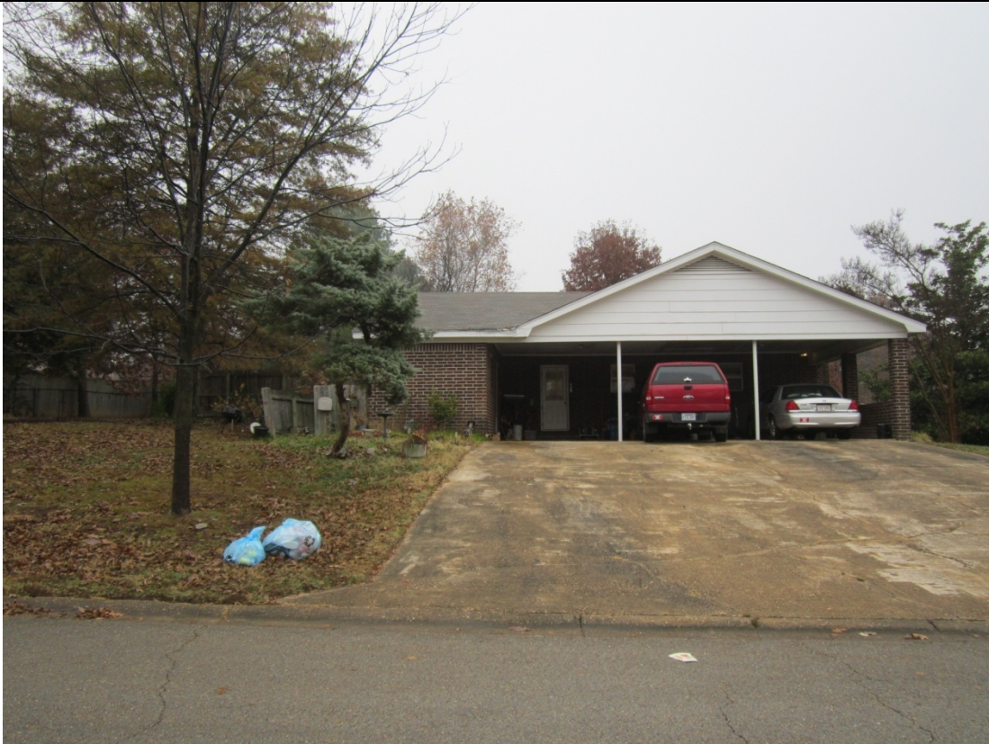
Property located north of subject site at 2204 Indian Trails St.