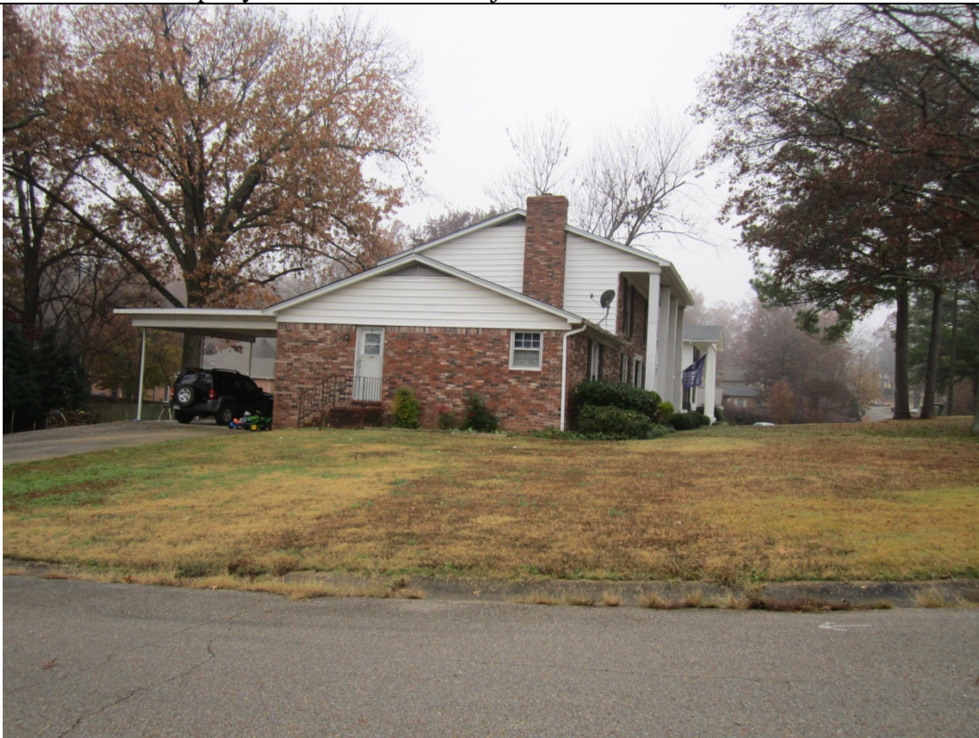
Property located west of subject site at 729 Arrowhead Dr.