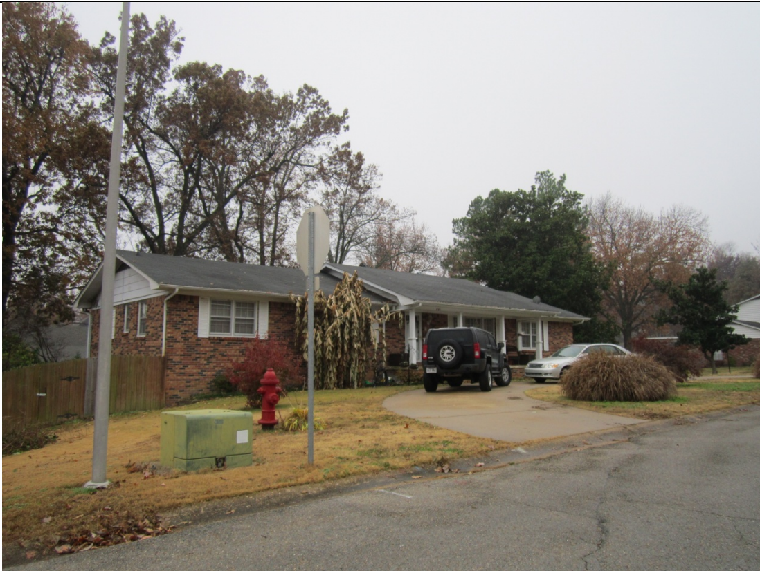
Subject site located at 801 Arrowhead Dr.