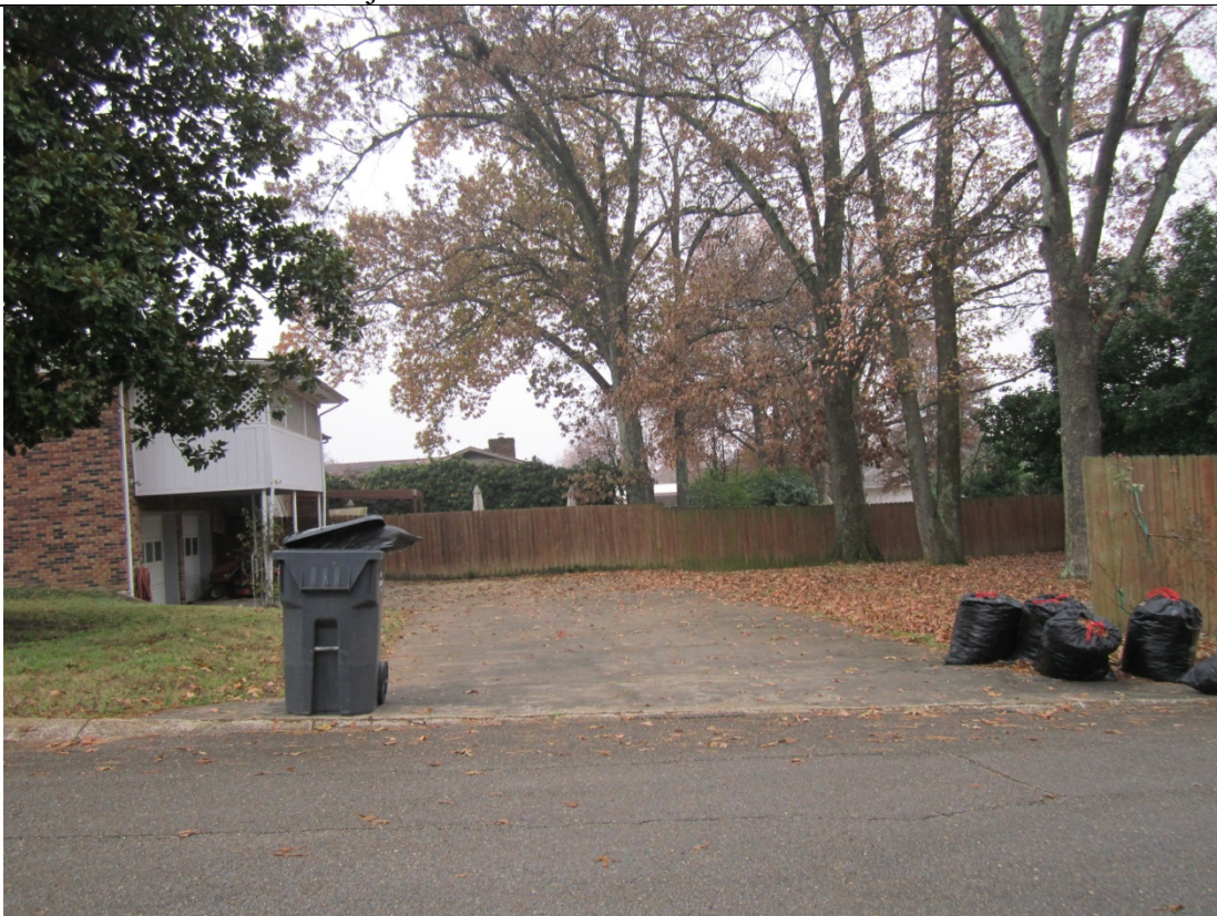
Back yard of subject site.