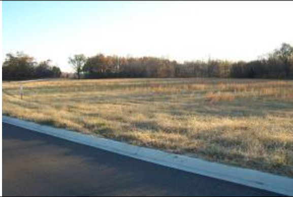
View looking Northeast-Christian Valley Dr.