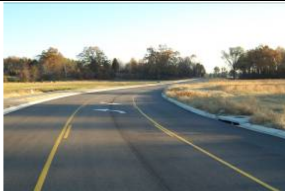
View looking Northwest on Christian Valley Dr.