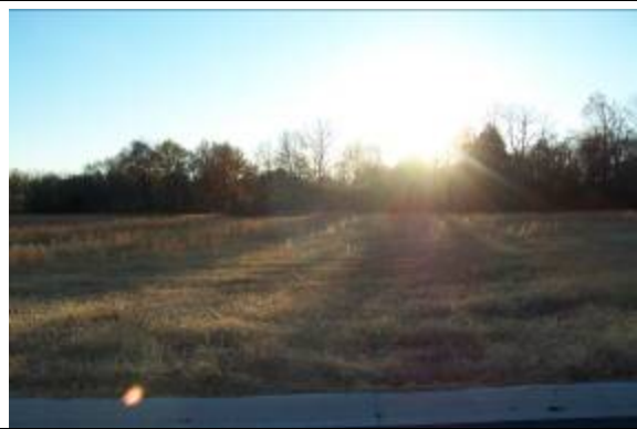
View looking Southwest - Christian Valley Dr.