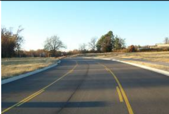
View looking Northwest on Christian Valley Dr.