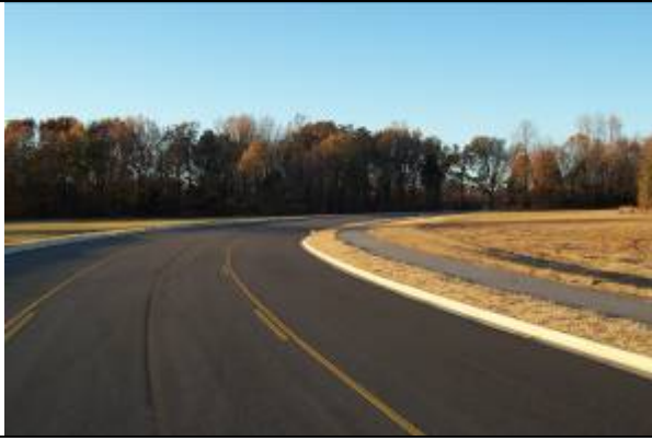
View looking North on Christian Valley Dr. (CVD)