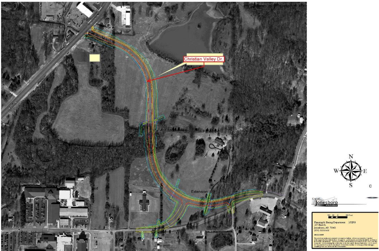
Aerial View of the Vicinity