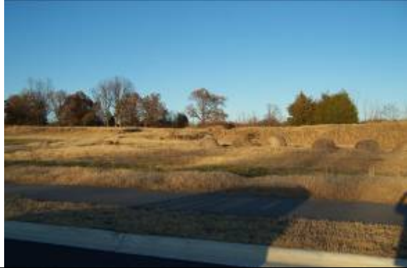
View looking East on Christian Valley Dr.