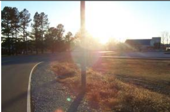
View looking Southwest towards Valley View Dr.