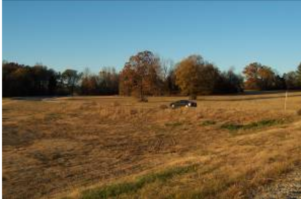
View looking North on Christian Valley Dr.