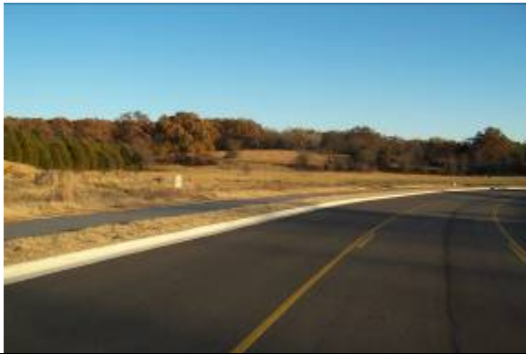
View looking Southeast on Christian Valley Dr. (CVD)