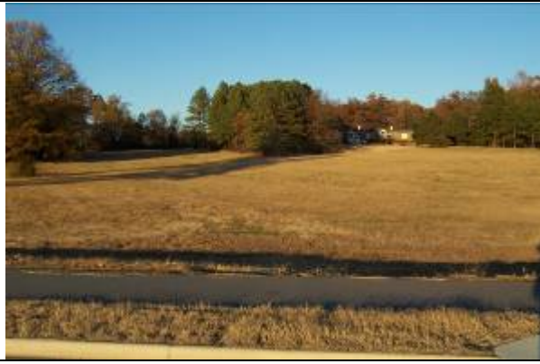
View looking East