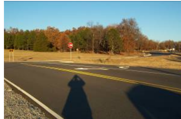
View looking North @ Inters.of Valley View/CVD