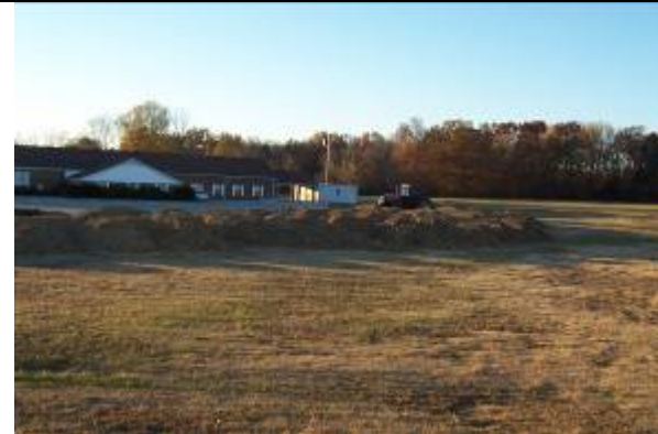
View looking Southwest at Christian Valley Church