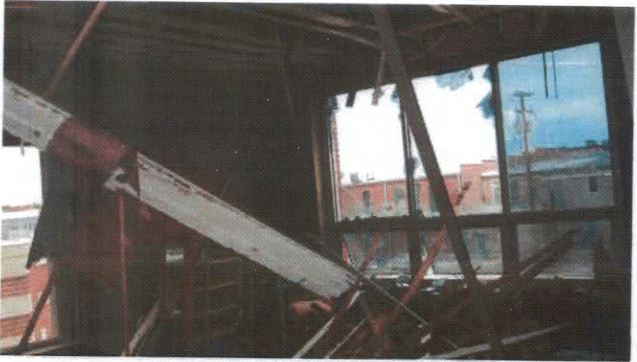
Photo 35 - Loft northeast unit looking at northeast corner of building. Ceiling collapse.