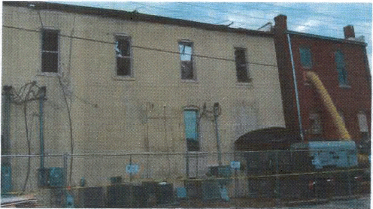
Photo 42 - West face of building.