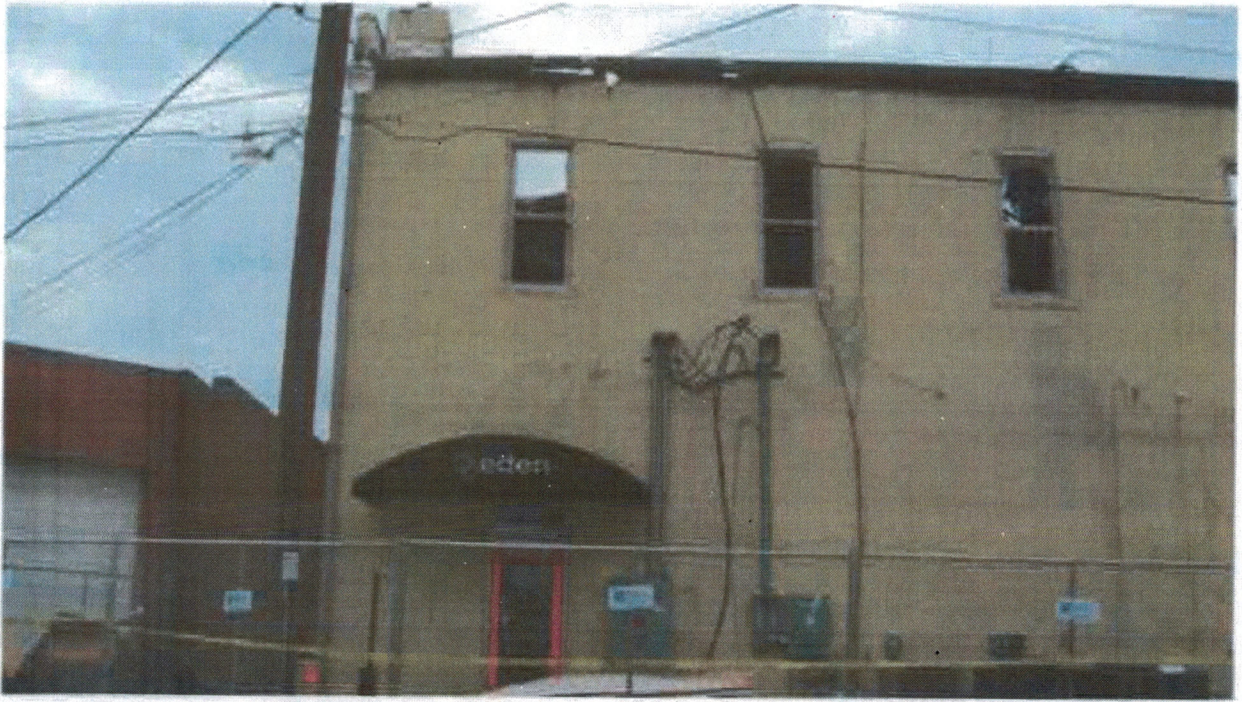
Photo 41 - West face of building.