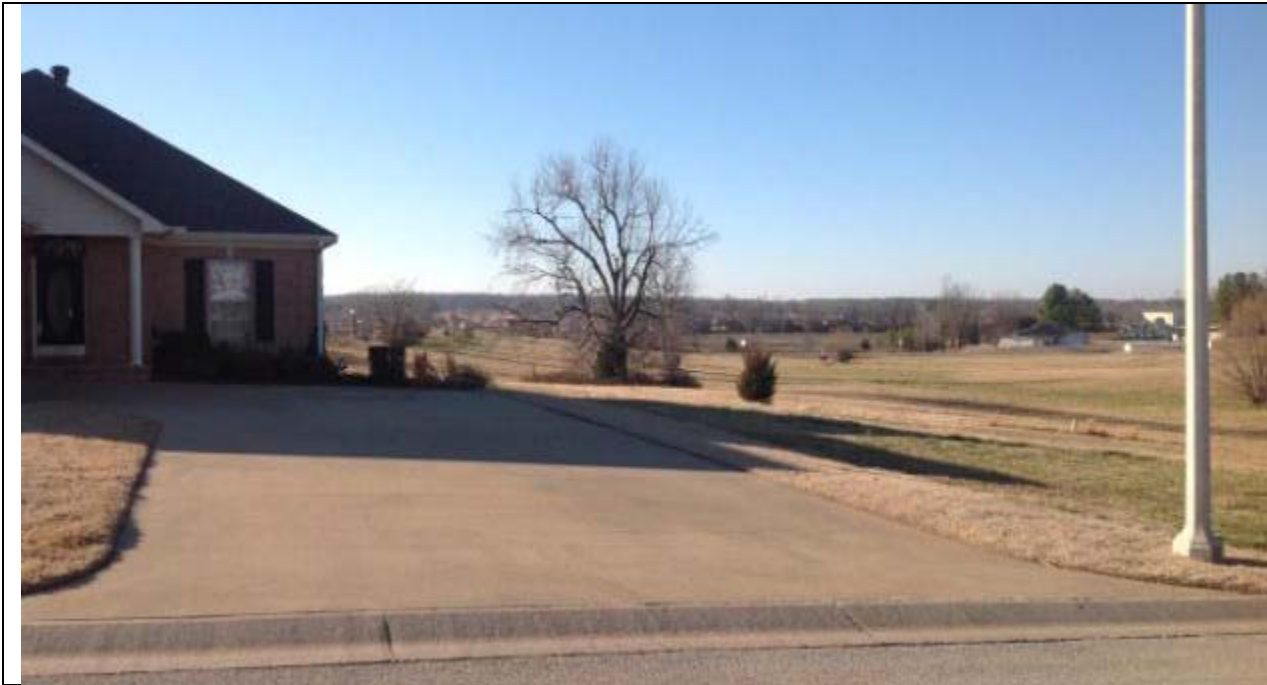
View looking west from Western Gales Dr. (Site in background)