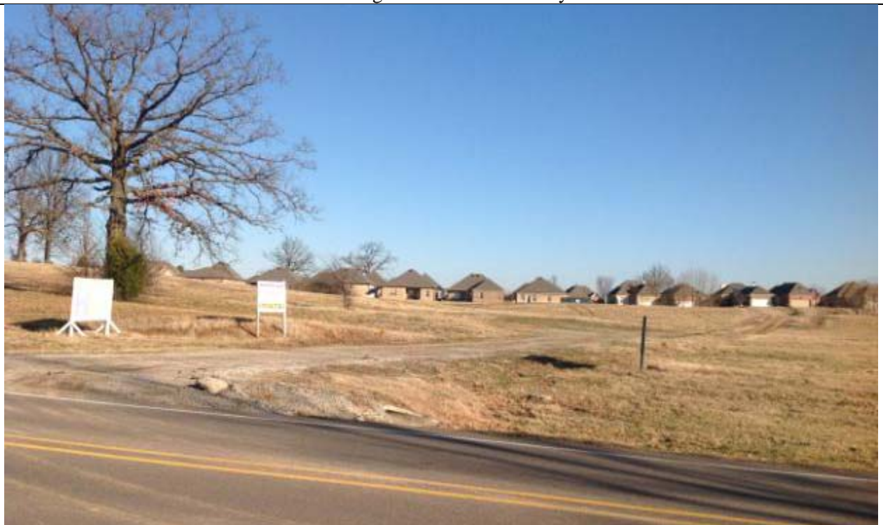
View looking east at site from Hwy. 351