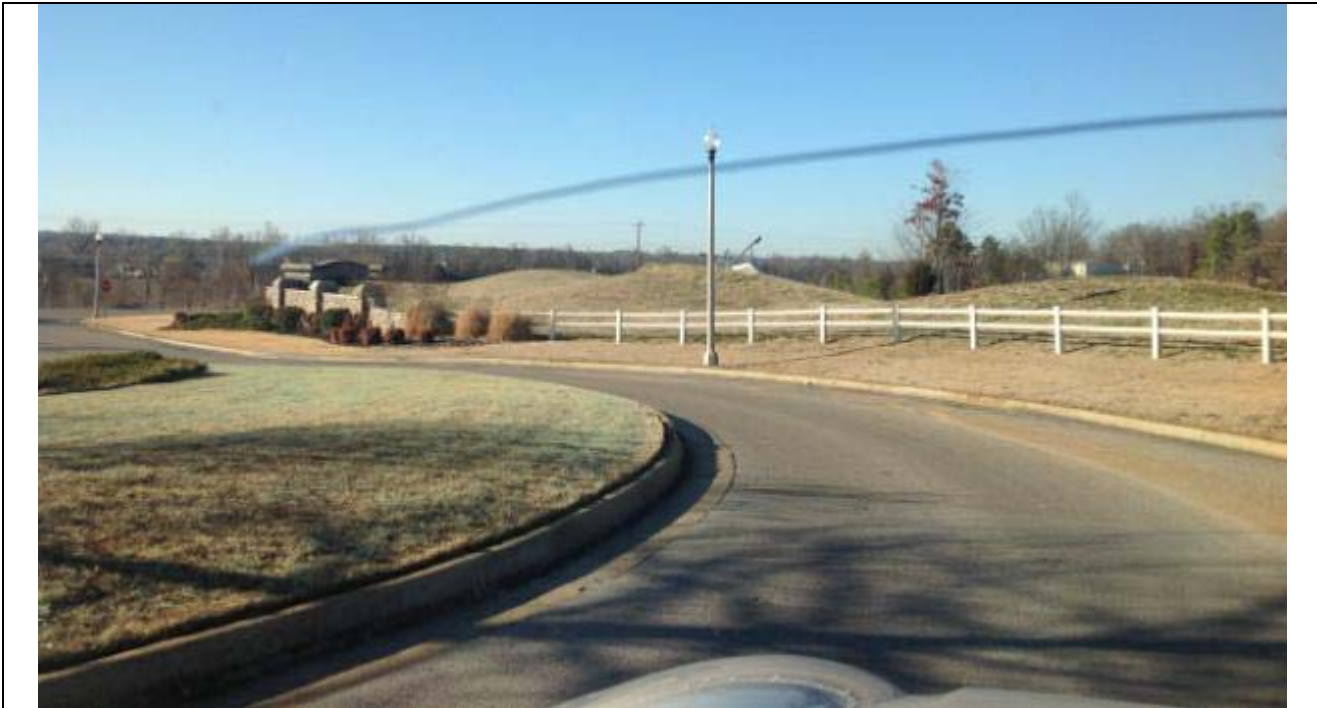
View looking west on Sage Meadows Blvd. towards main entrance