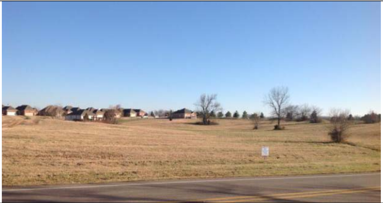
View looking east at site from Hwy. 351