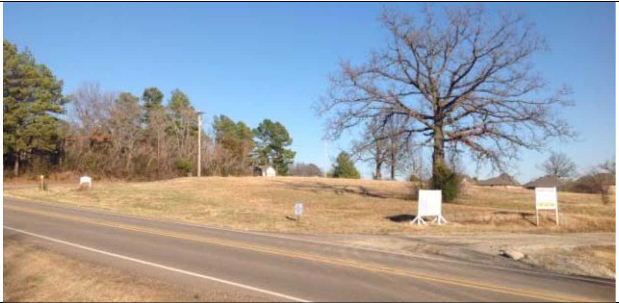
View looking North from Church Entrance at intersection of Macedonia & Hwy #351 (Site on Right)