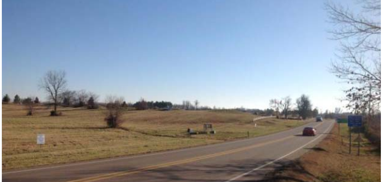
View looking south along Hwy. 351 Site on left