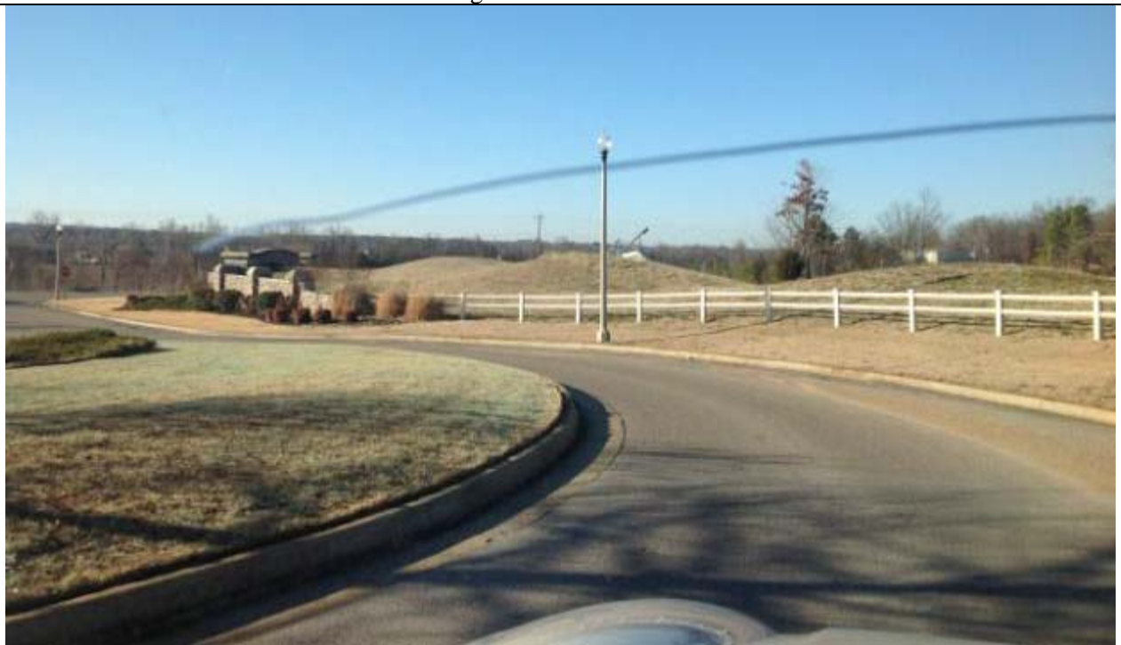
View looking west on Sage Meadows Blvd. towards main entrance