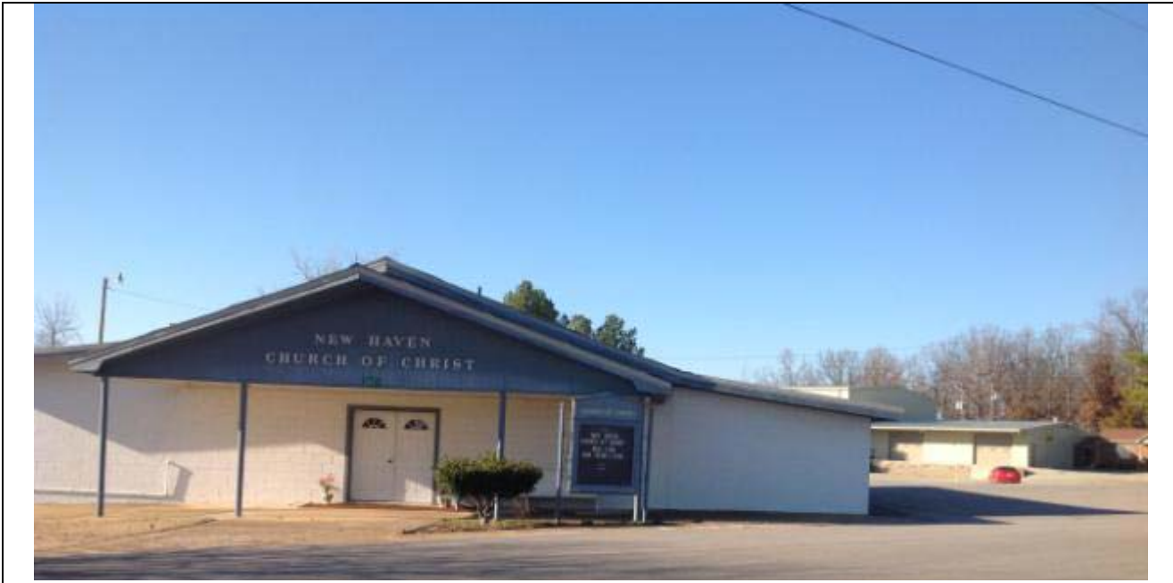
View looking West of Site