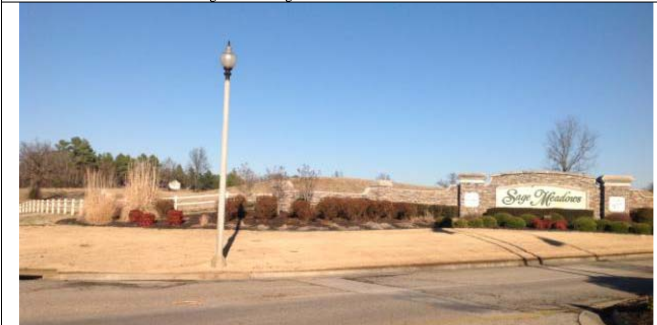
View looking Northeast towards Sage Meadows main entrance (Site in Background)