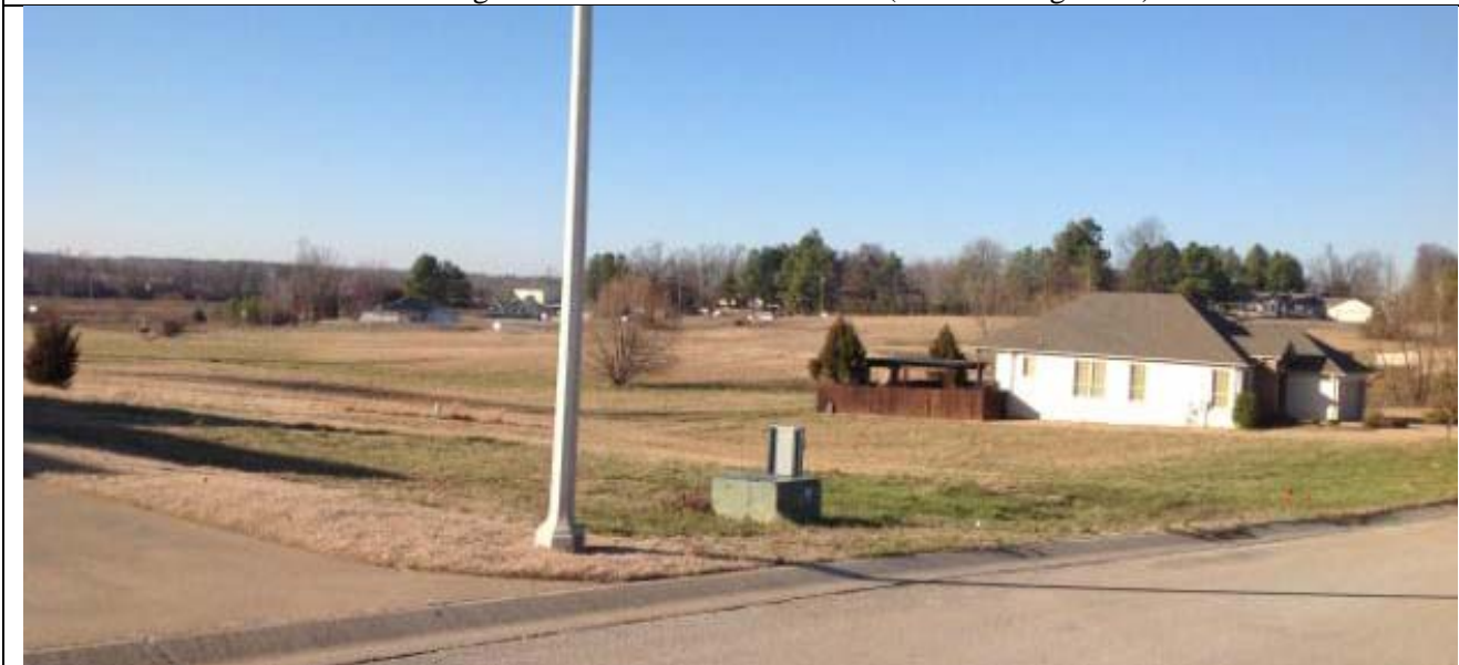
View looking Northwest from Gales Dr. (Site in background)