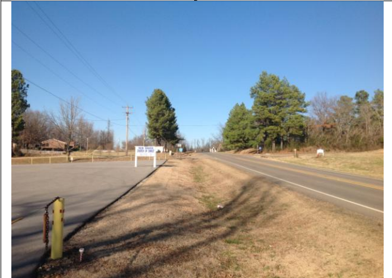
View looking North from Church Entrance at intersection of Macedonia & Hwy #351