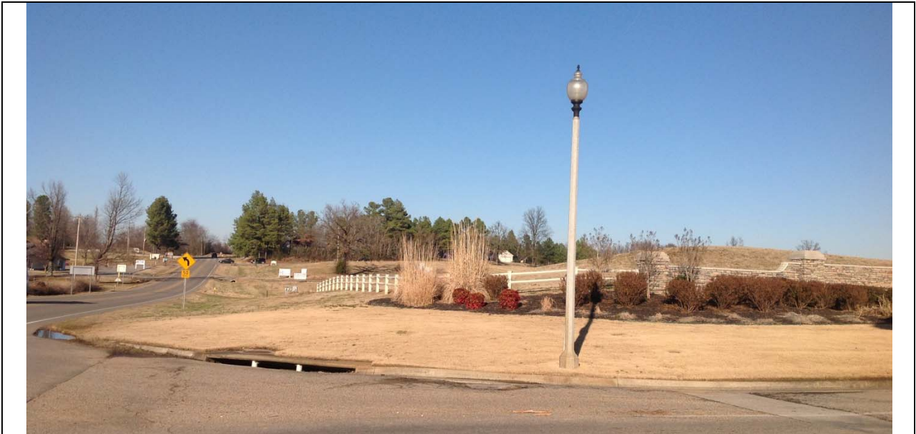
View looking North along HWY 351 frontage at the Sage Meadows main entrance (Site in Background)