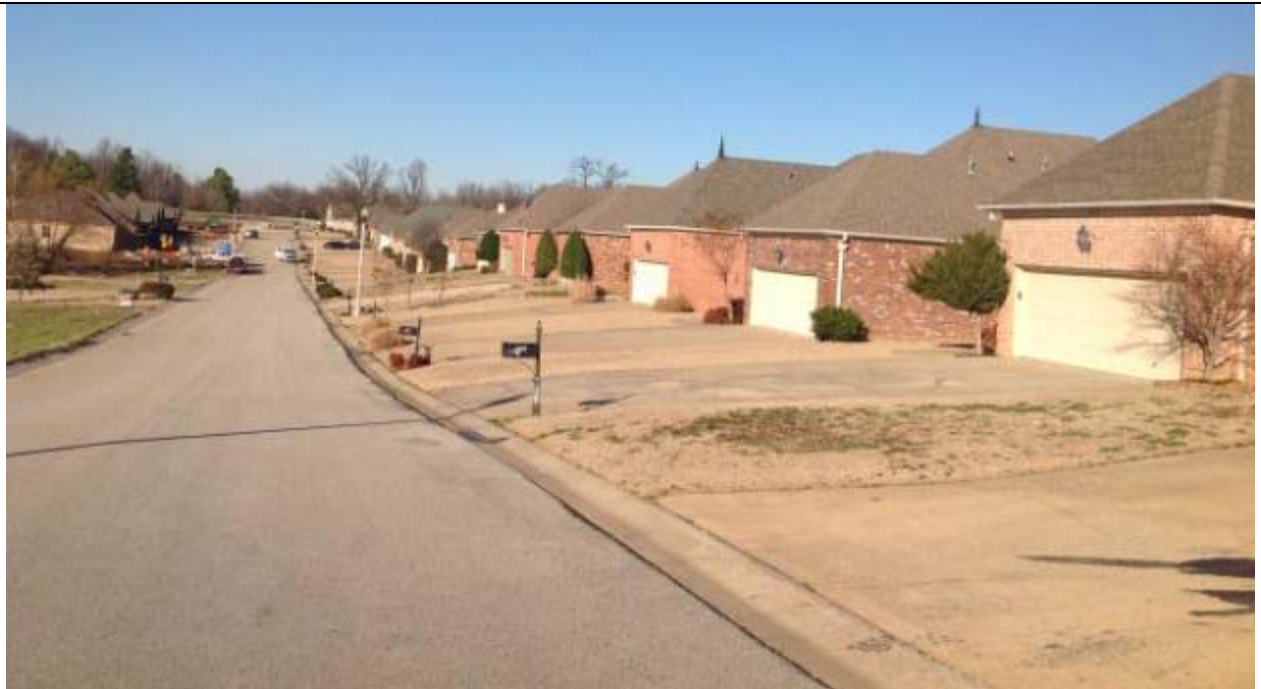
View looking north on Western Gales Dr.