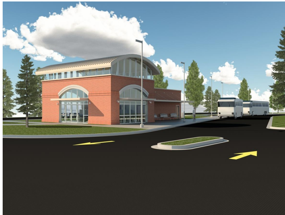
JET Multi-Modal Central Transfer Facility - Completed October 2015