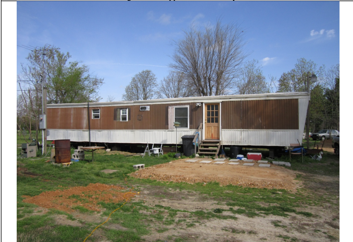
View looking North of Applicant's existing mobile home.