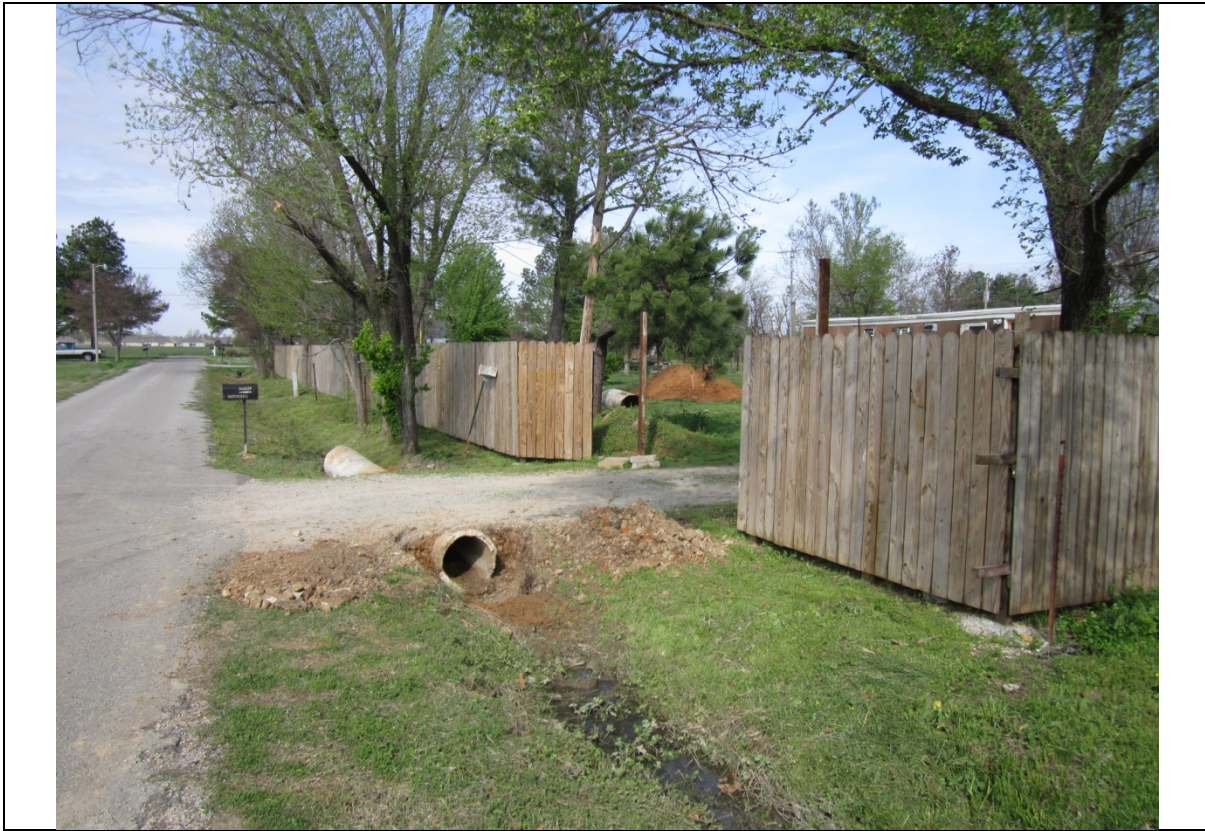
View looking West of Applicant's driveway entrance.