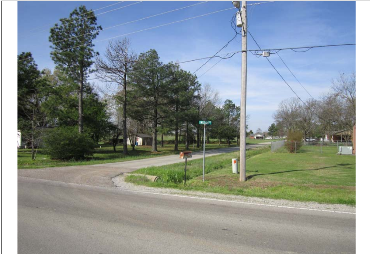
View looking West at the intersection Hargis Dr./Willow Rd.