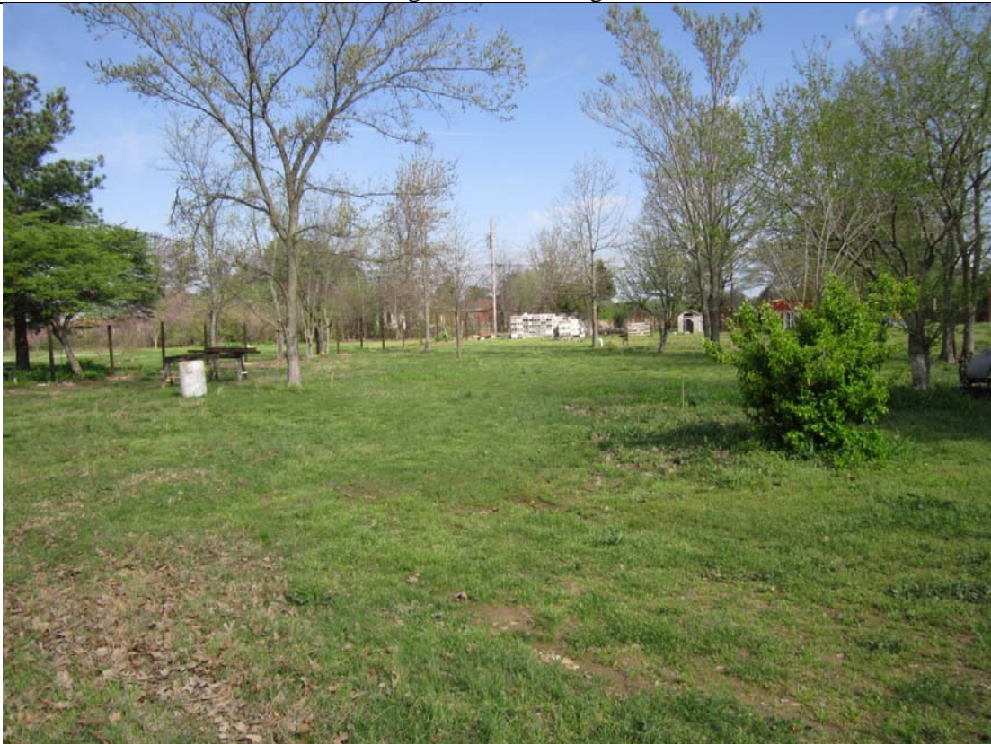
View looking North of proposed mobile home location.