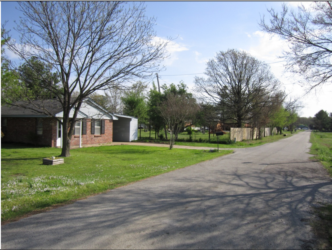
View looking East of Hargis Rd. from the end of the road.