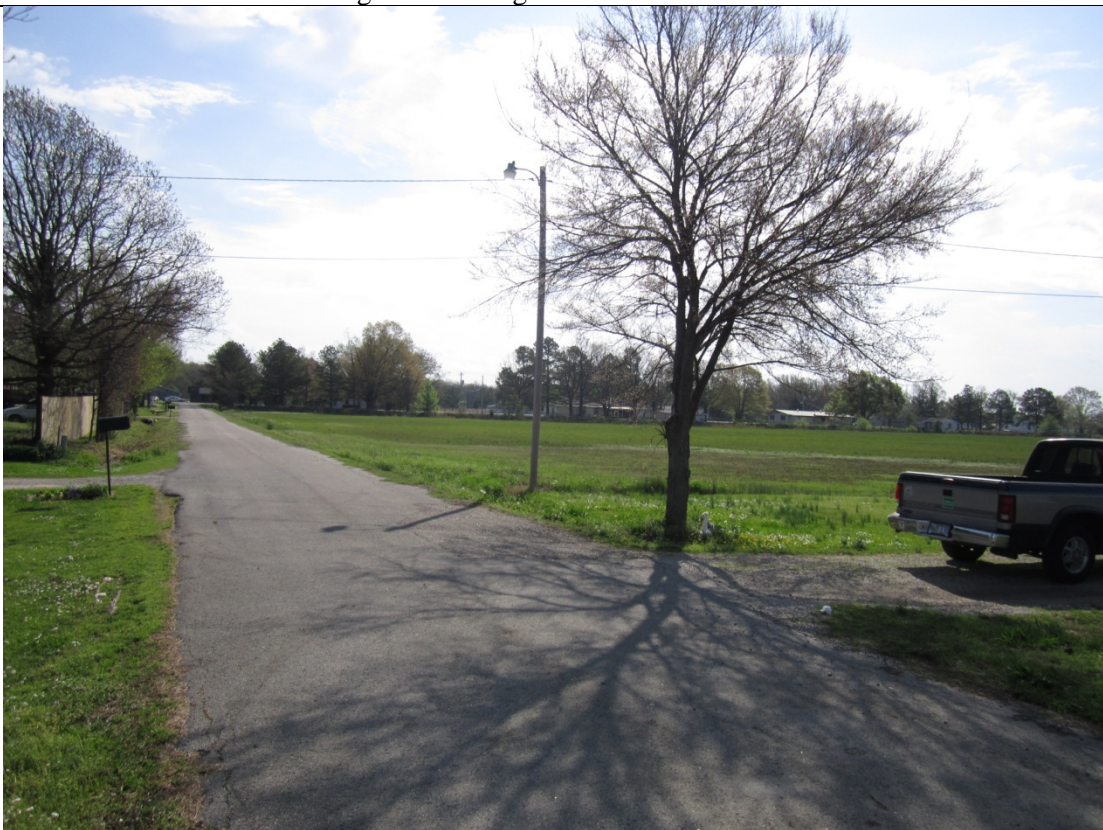
View looking East of Hargis Rd.