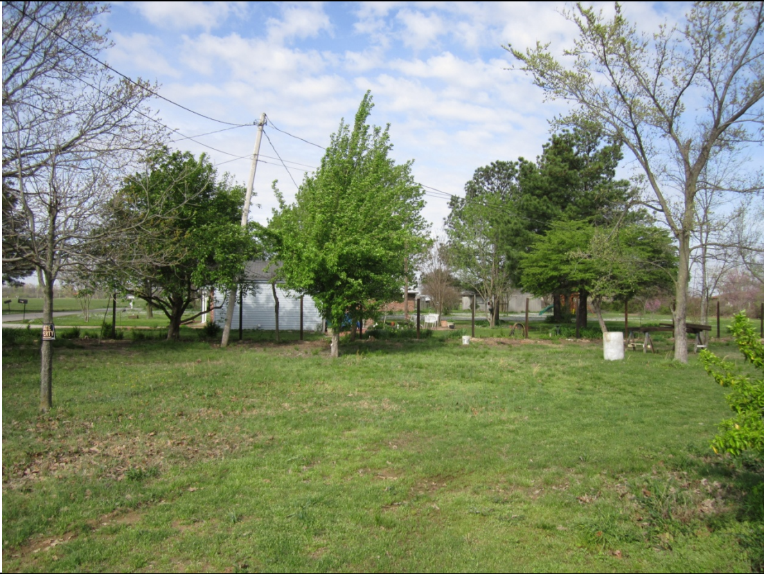
View looking West of abutting residence.