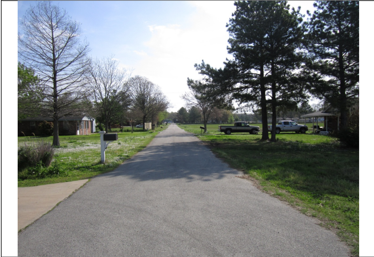
View looking East of Hargis Rd. from the end of the road.