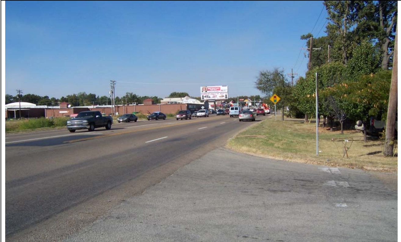
View Looking north along Stadium Blvd.