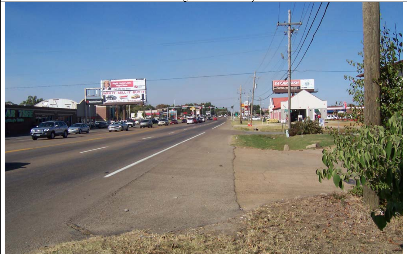
View looking north along Stadium Blvd.