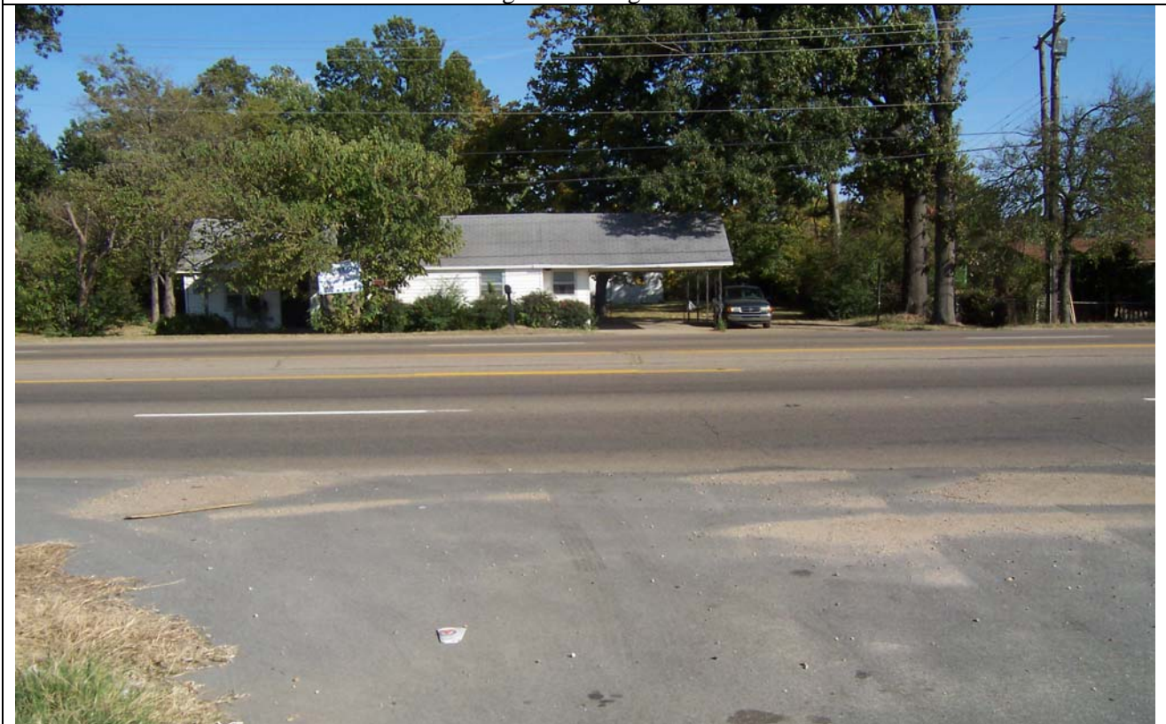
View Looking east at the subject property.