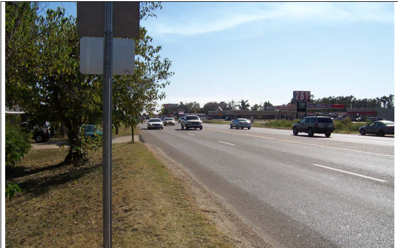
View looking north along Stadium Blvd.