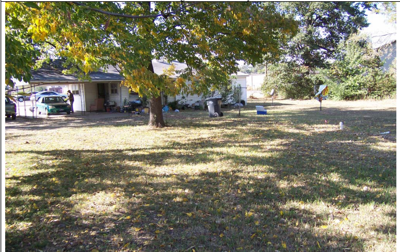
View looking west of the home from the rear.