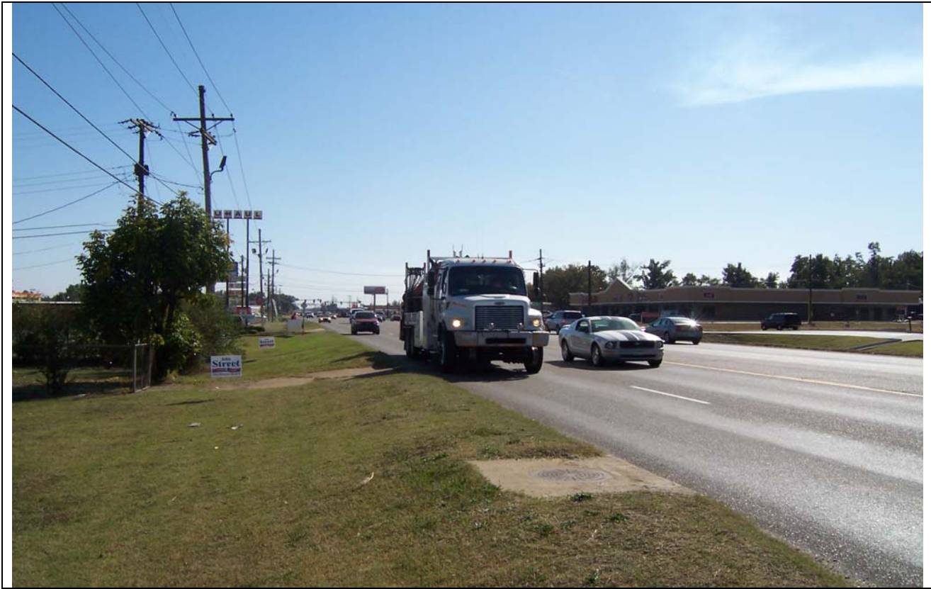
View looking south along Stadium Blvd.