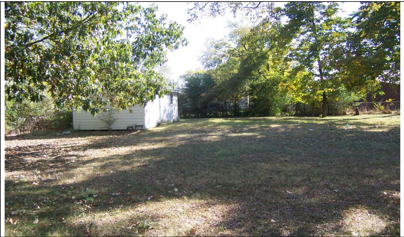
View looking south of the rear yard.