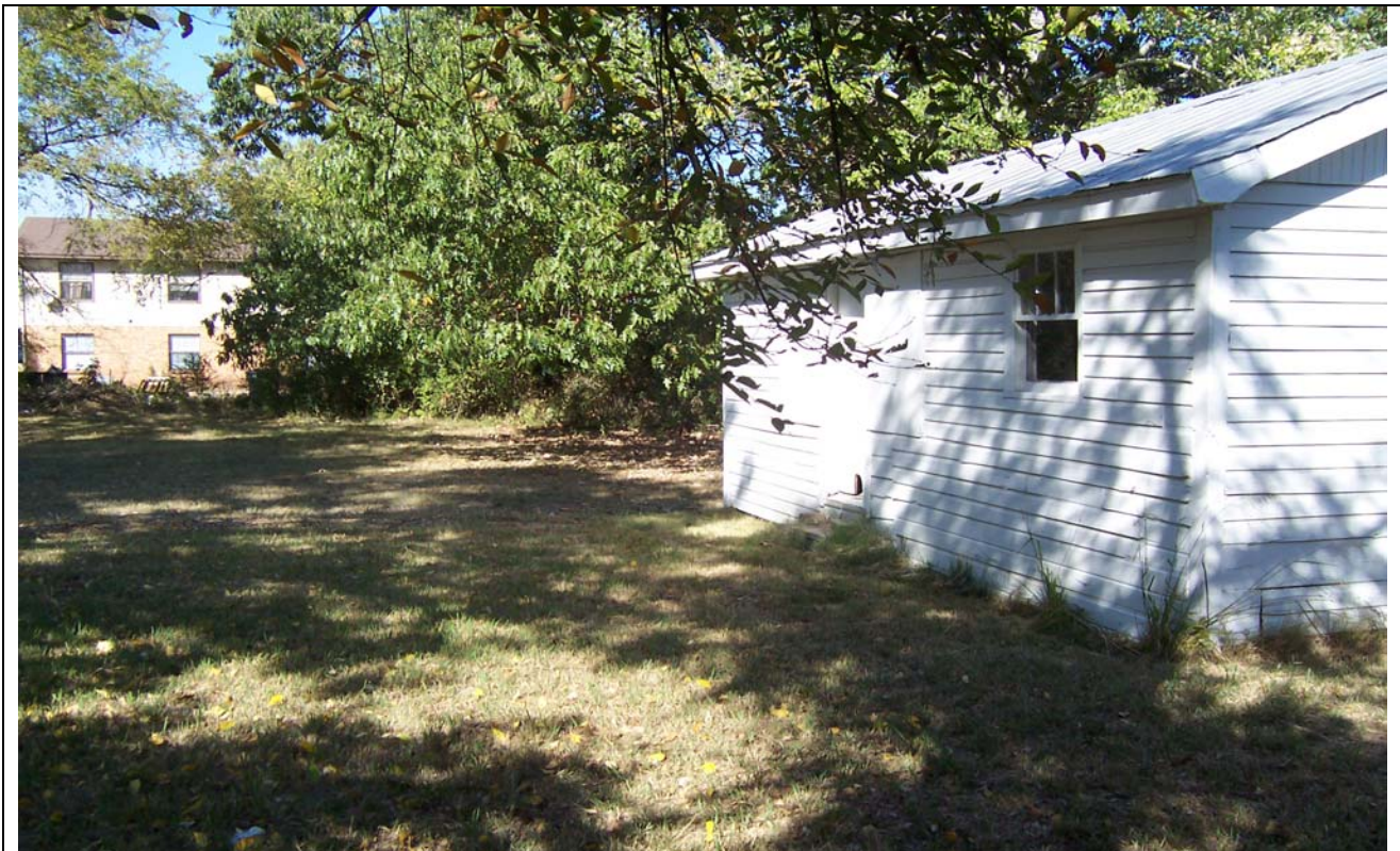
View looking north of the rear yard.