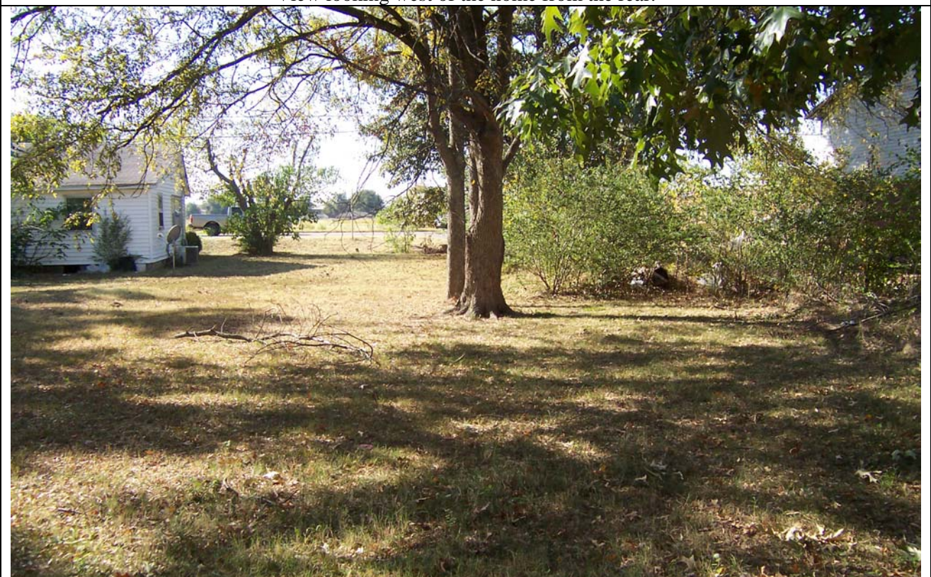
View looking west of the subject property from the rear.