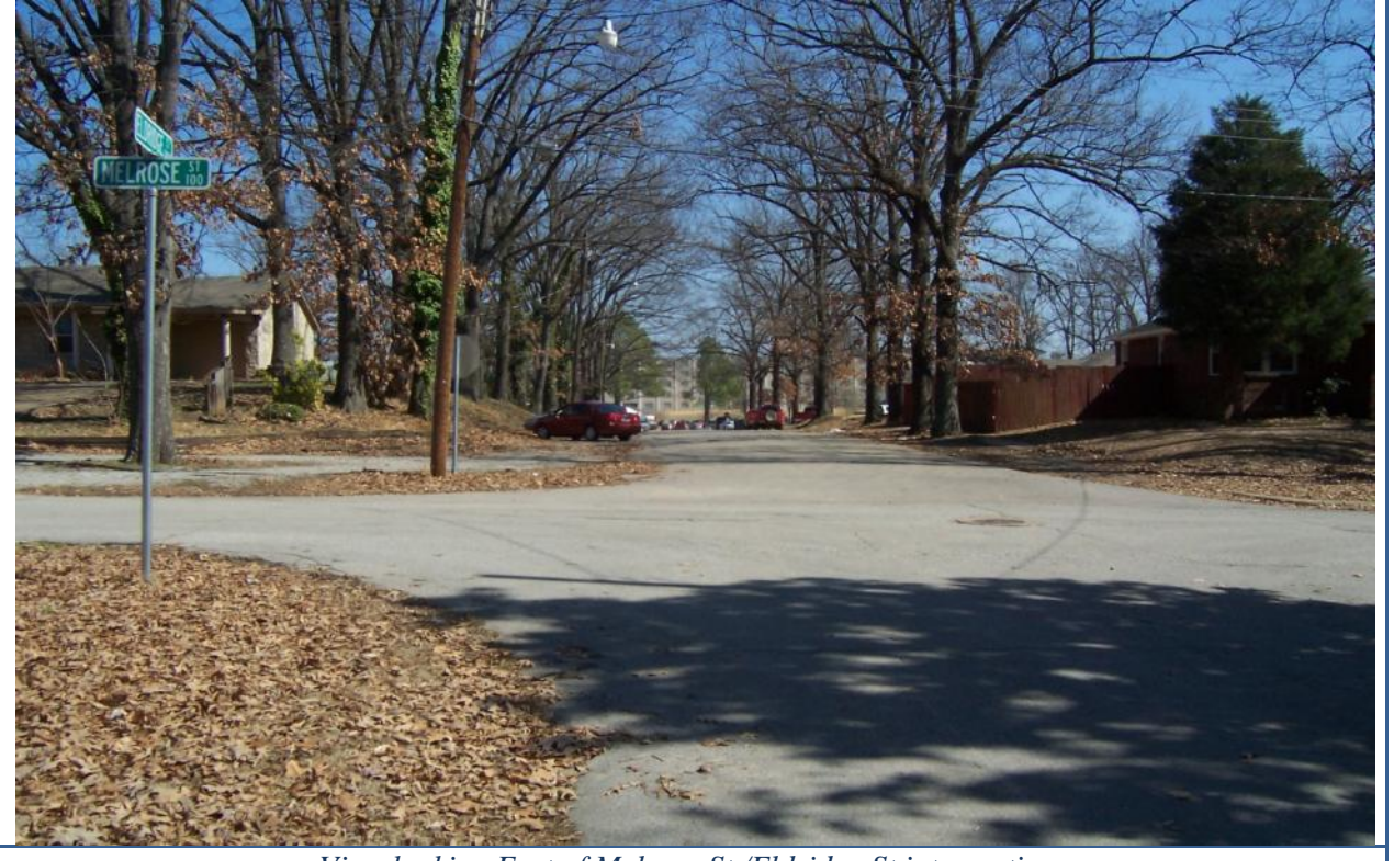
View looking East of Melrose St./Eldridge St.intersection.