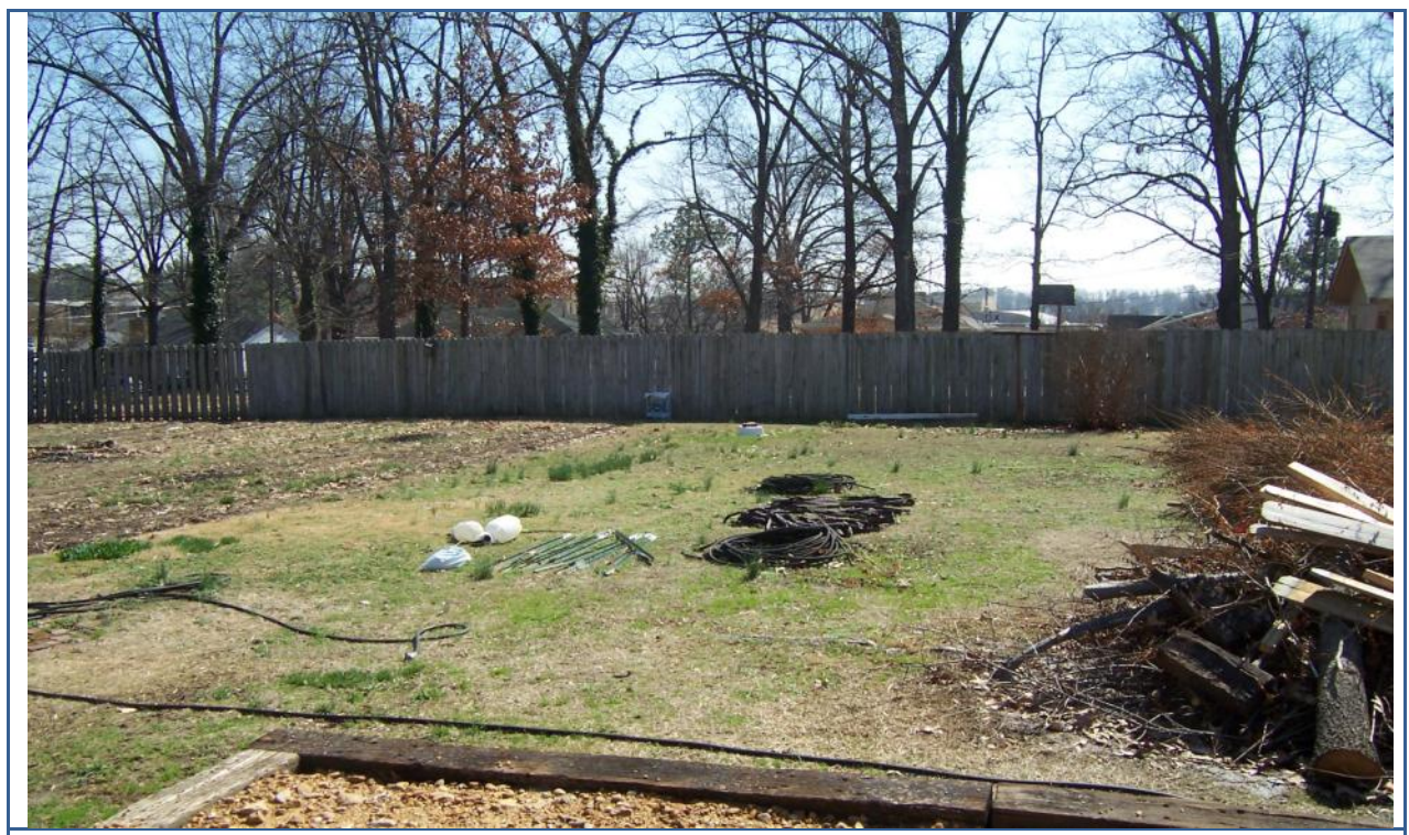
View looking Southeast of rear yard and abutting land.