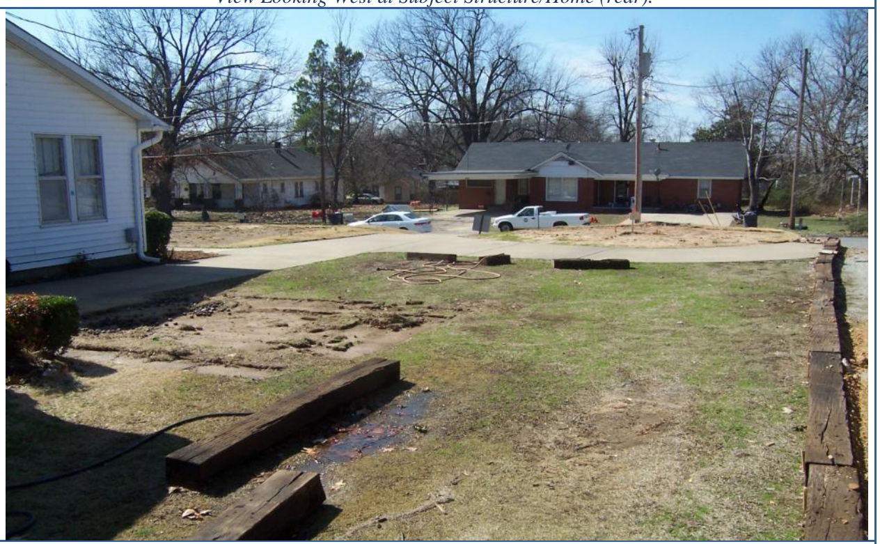
View of front yard and parking area.

View Looking West at Subject Structure/Home (rear).