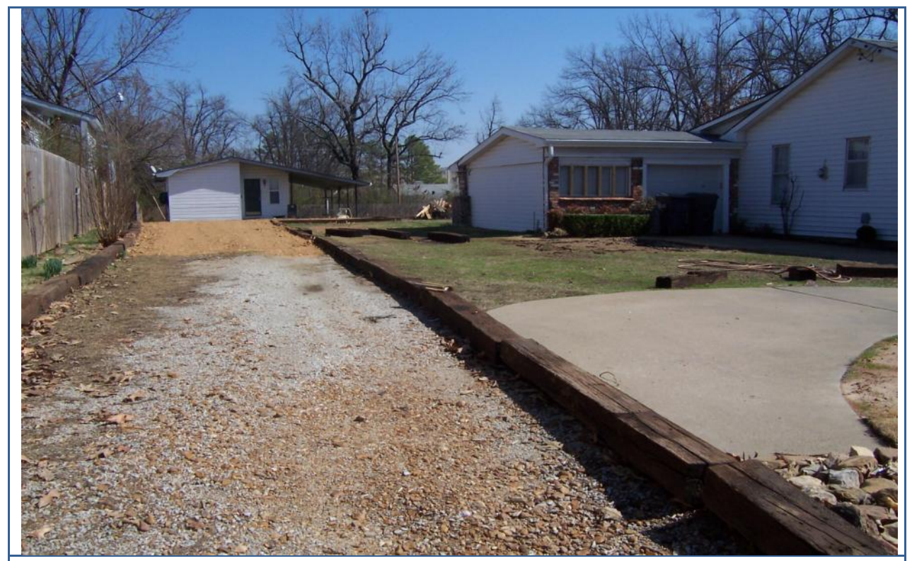
View looking East of secondary structure and driveway.