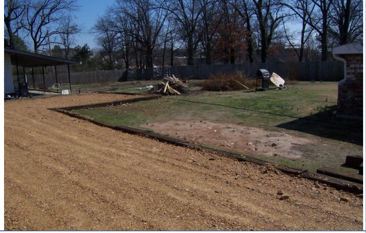
View looking Southeast of rear yard and abutting land.