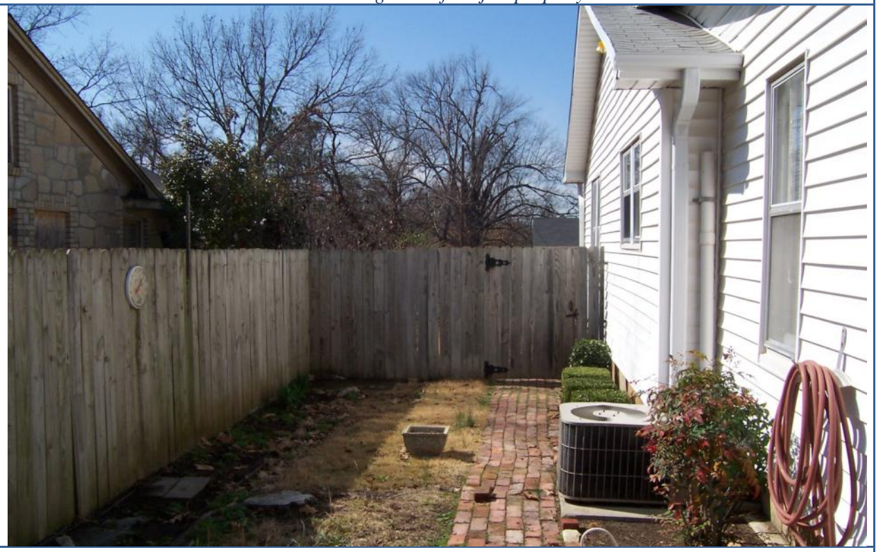
View looking West from rear yard of the side yard..