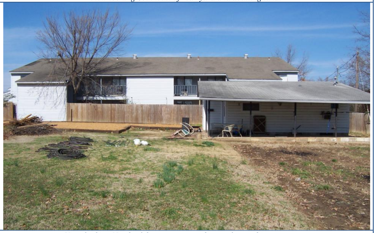
View looking North of the apartments adjacent from subject property.