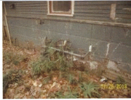
photo taken: 12/09/2013 - 100E4115.JPG