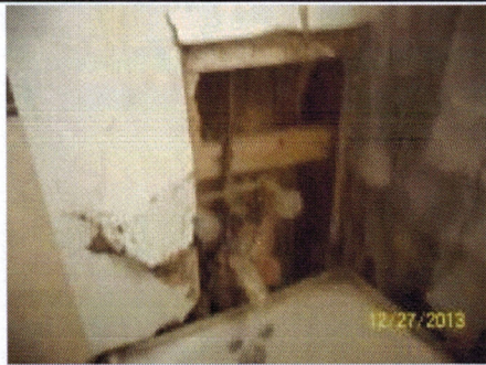
photo taken: 12/30/2013 - 100E4252.JPG