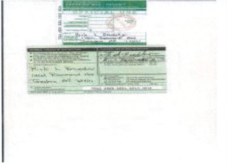
photo taken: 12/13/2013 - Certified_mail_receipt135Certified_mail_receipt.jpg

City of Jonesboro Code Enforcement File # 804 Chestnut Street