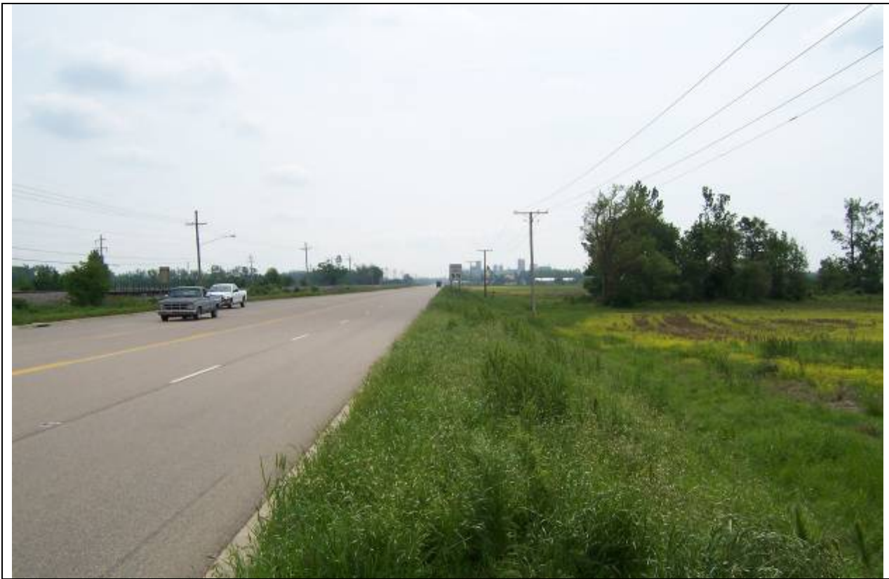
View looking east along Dan Ave. Frontage