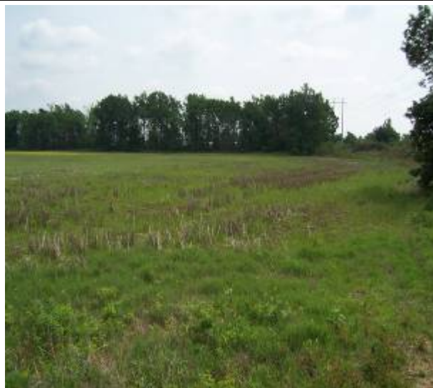
View looking east at project site