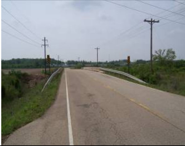
View looking South along Lacy Rd.