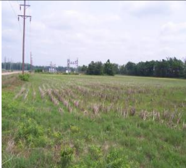
View looking North on Lacy at Site