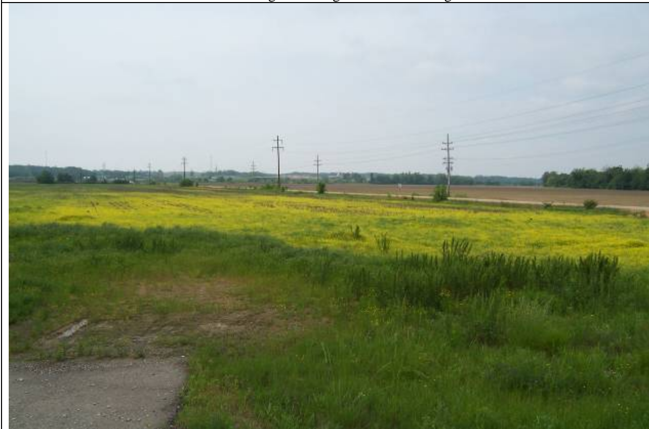
View looking from south from Dan Avenue towards Site