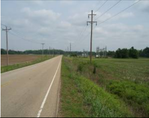
View looking North along Lacy Rd.