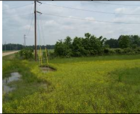
View looking North from southern portion