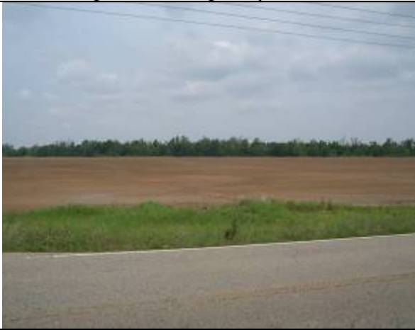
View looking West across Lacy from Site