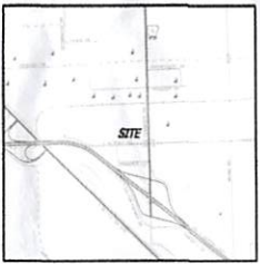
VICINITY MAP (N.T.S)