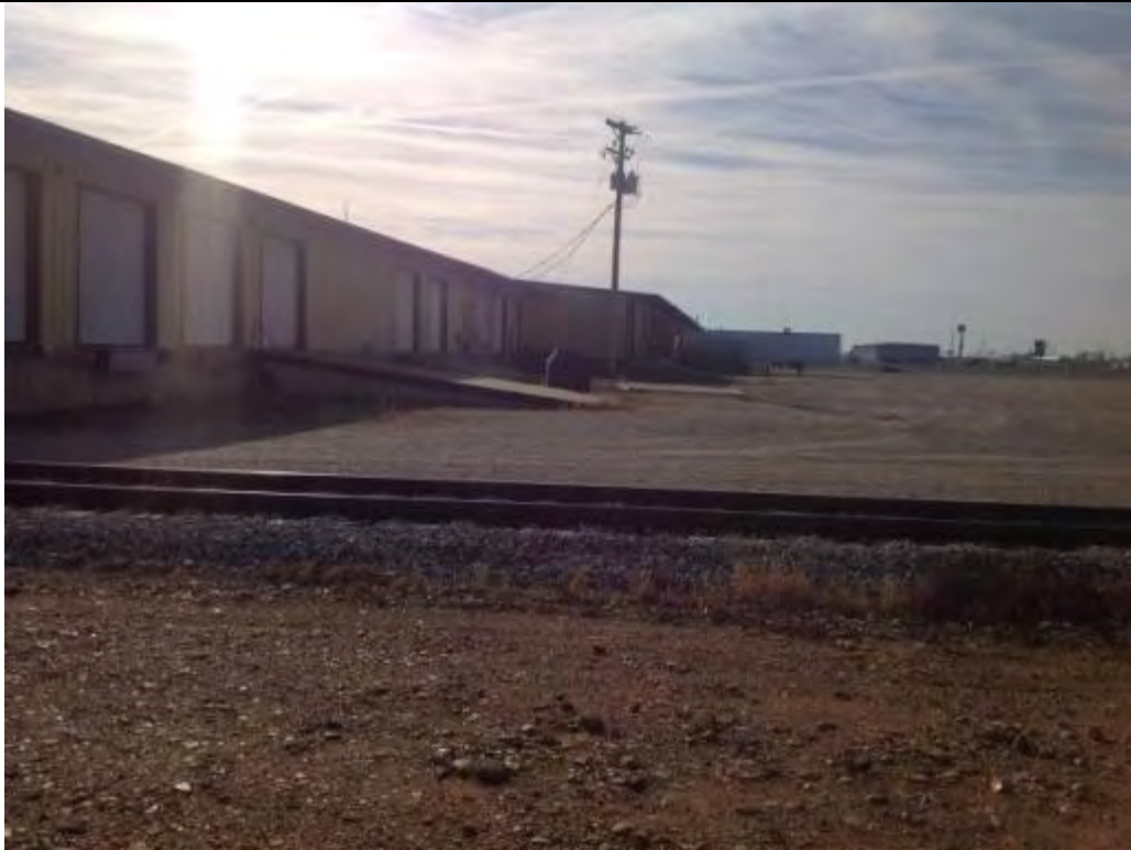
View looking south from adjacent industry north of site.