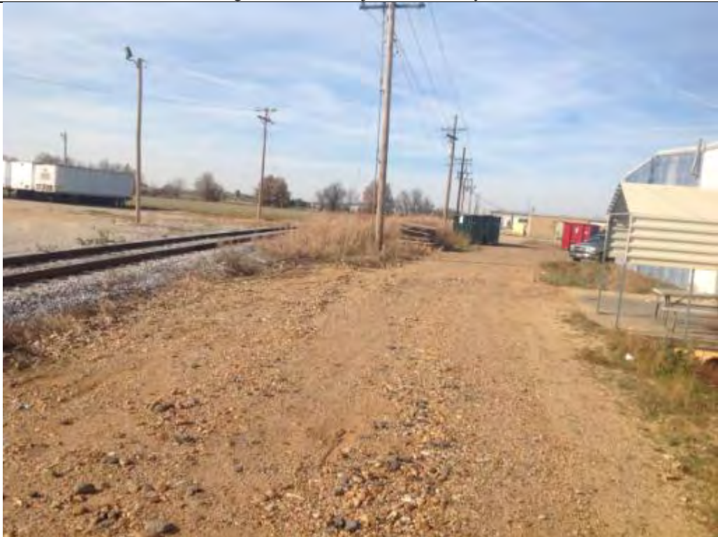
View looking west along railroad towards the north boundary of site.