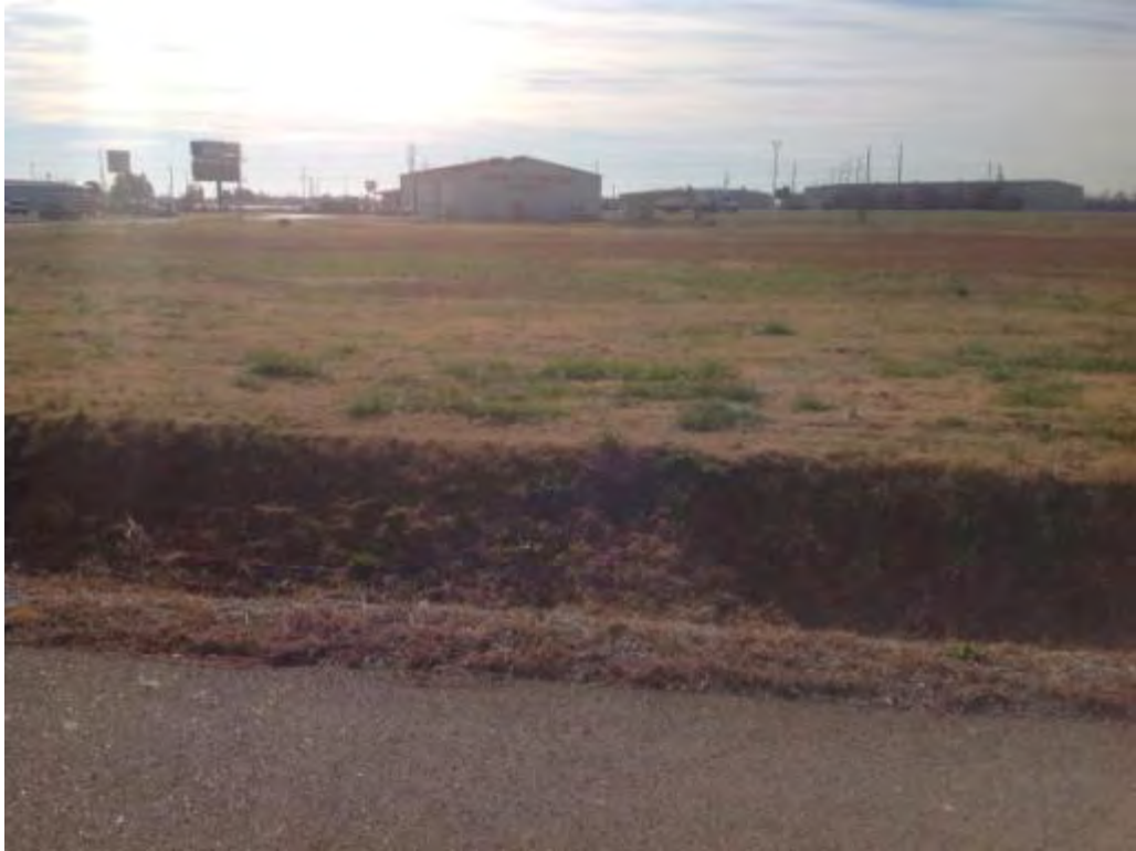
View of subject property looking North