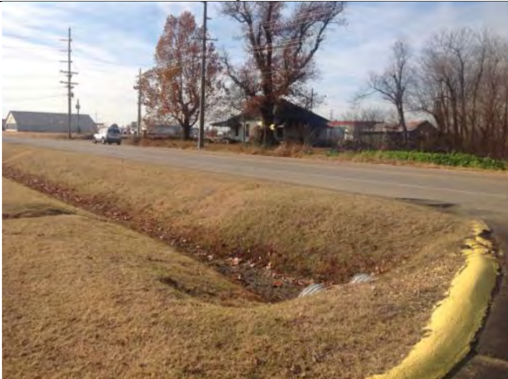
View at Post Cereal looking South towards I-63- Site is to right.