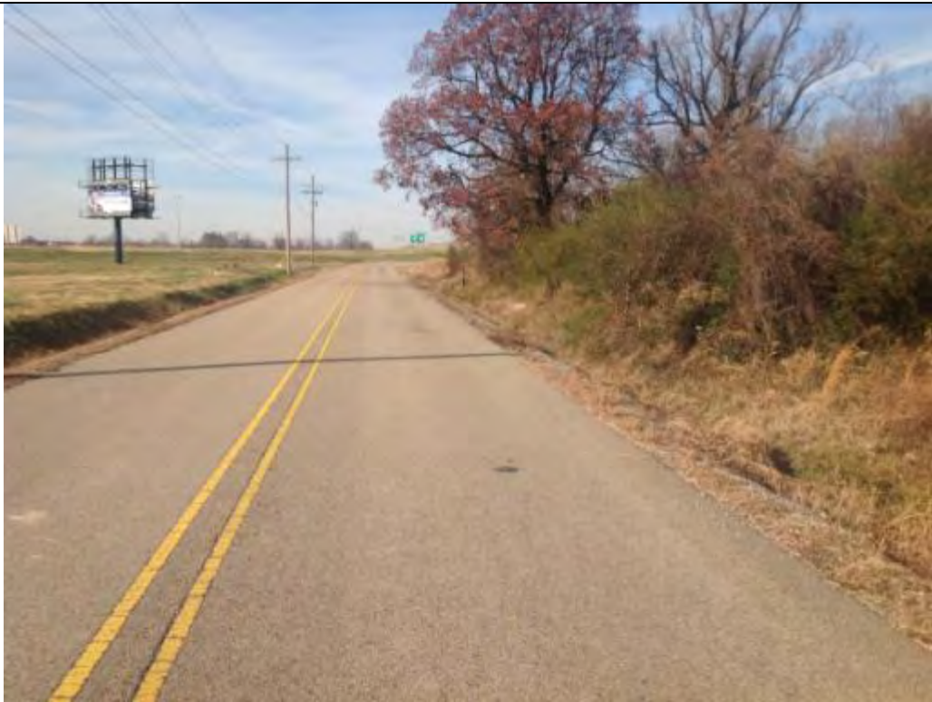
View looking west, site frontage to the right