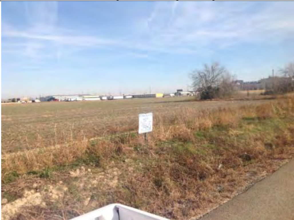
View looking northeasterly toward subject site from CW Post Rd.