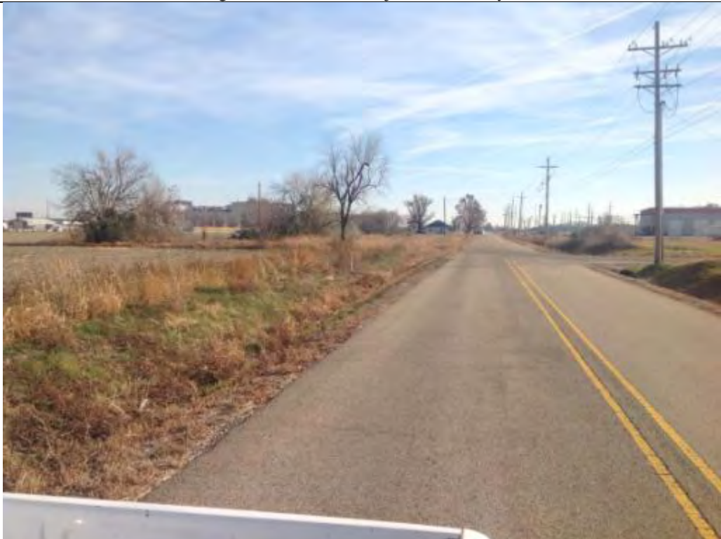
View looking East along CW Post – Property site to right