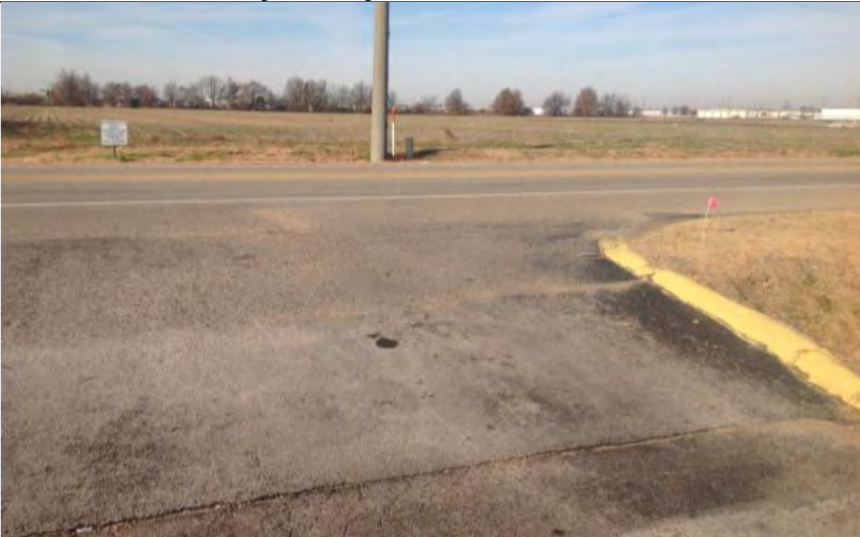
View looking West toward Site from Post Cereal