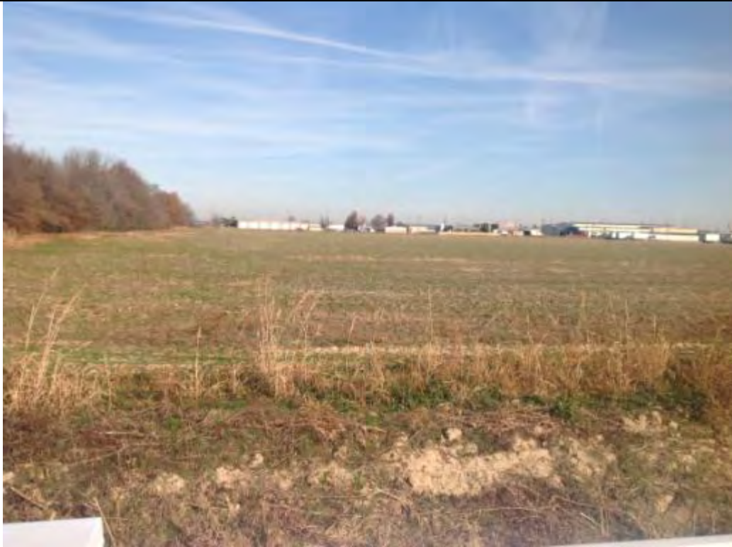
View looking North toward site