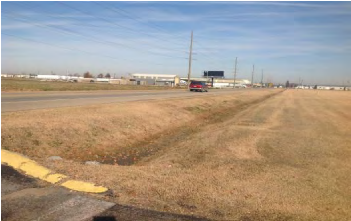
View looking North along Commerce at Post Cereal, Site is to left