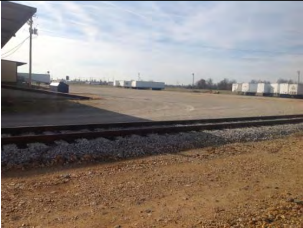
View looking southwest from adjacent industry towards site