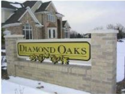
Figure 11.8.1: Development Sign