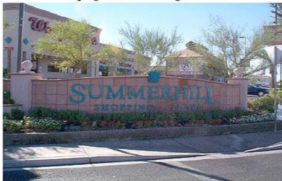
Figure 11.5.5: Landscaping for Monument Signs

(B) The landscape area for permanent freestanding signs shall consist of shrubs, flowers, sod and/or ground cover.