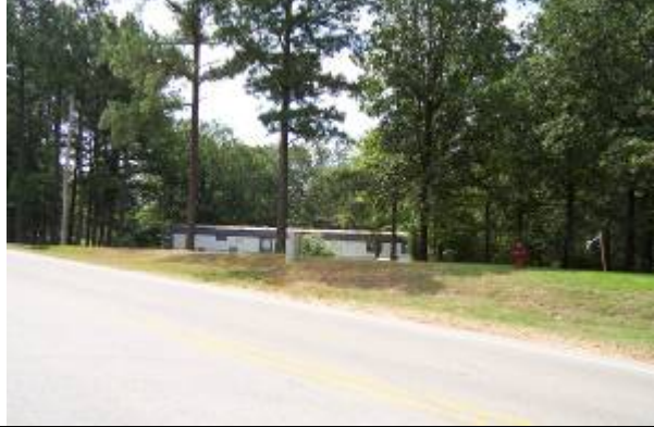
View looking east and south from entrance on Casey Springs