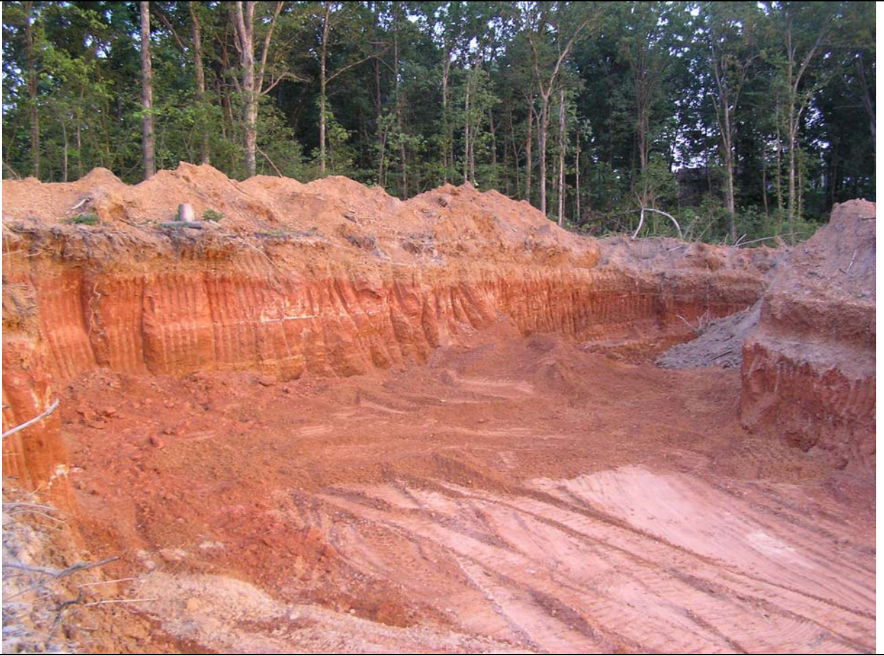
View on property site