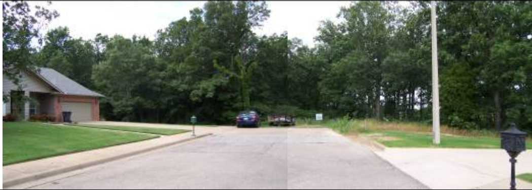
View at terminus of Nottingham Way Looking West