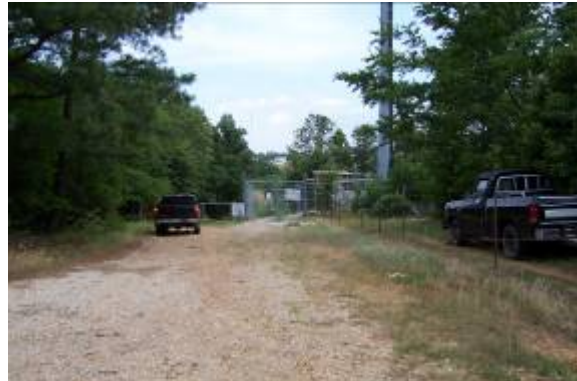
View looking North at Entrance/Casey Springs