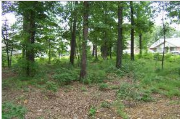
View looking towards Nottingham Way