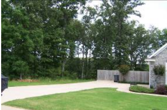
View looking North from Nottingham Way