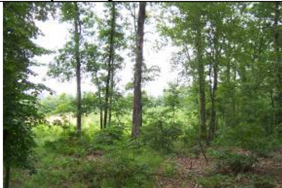
View looking North from Nottingham Way