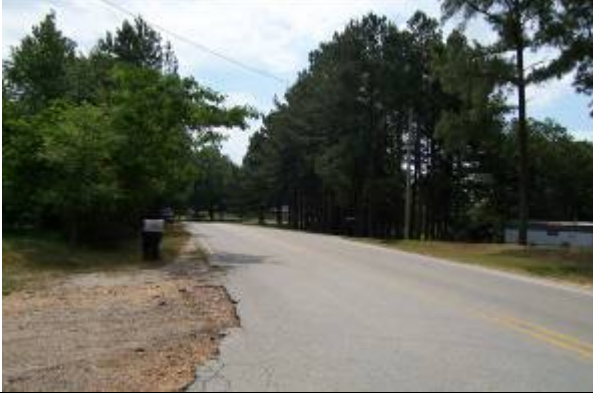
View from drive entrance looking West