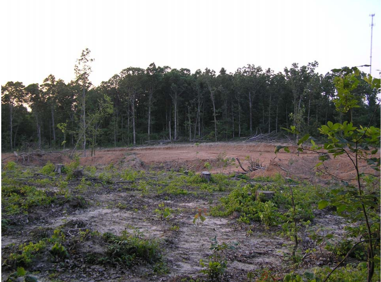
View from site