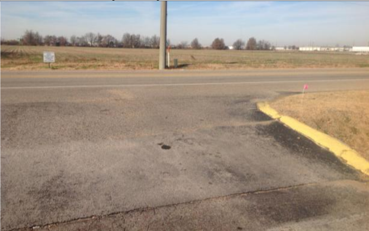
View looking West toward Site from Post Cereal