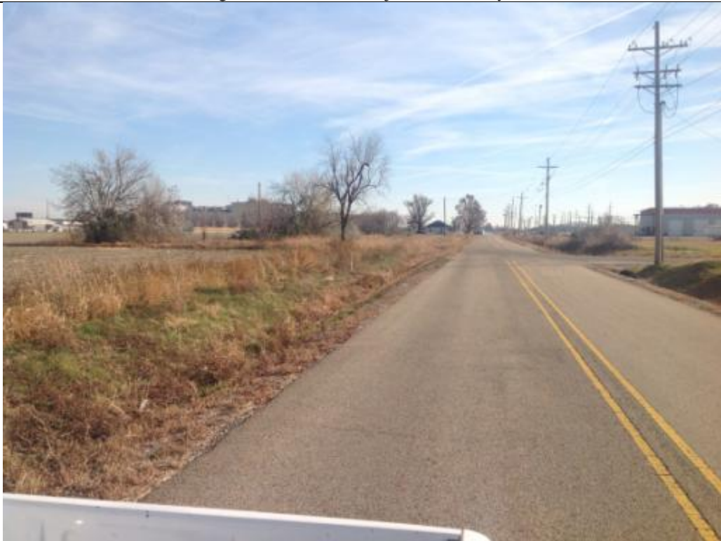
View looking East along CW Post – Property site to right