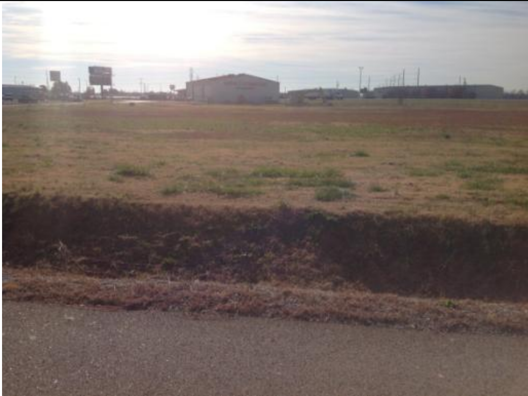
View of subject property looking North