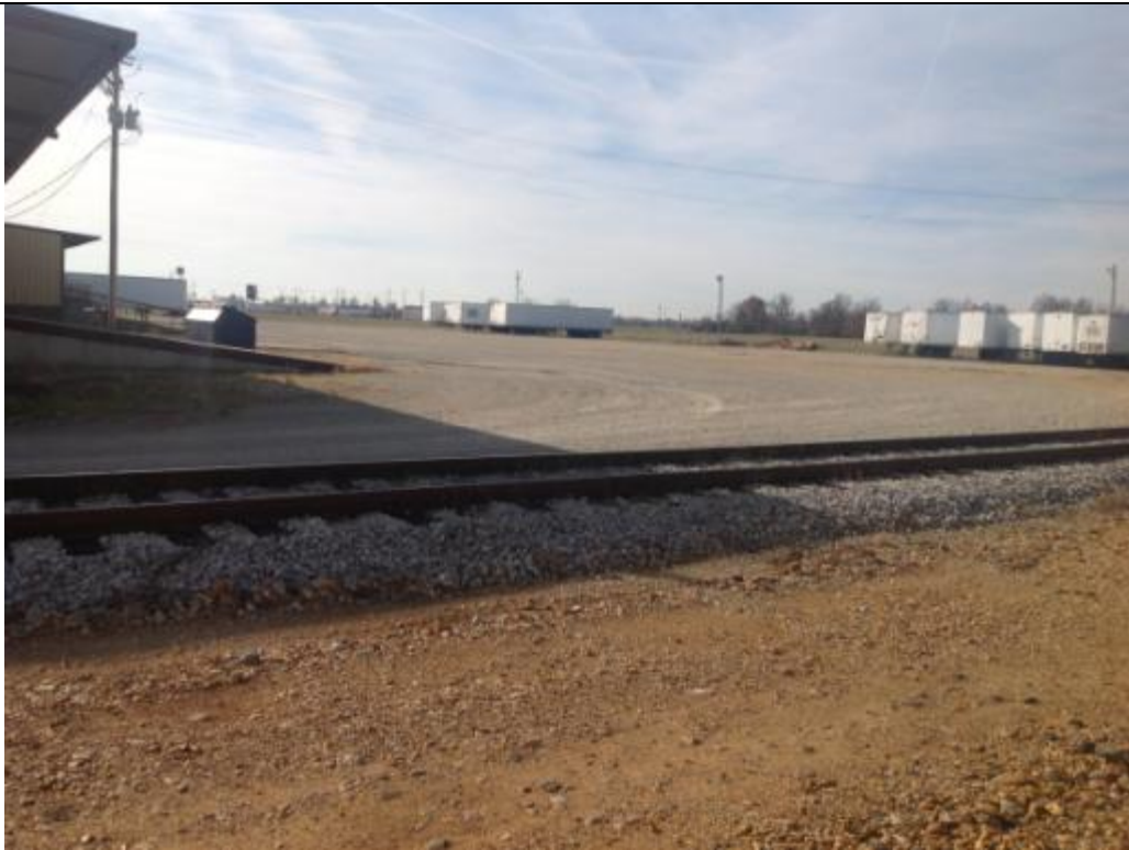
View looking southwest from adjacent industry towards site