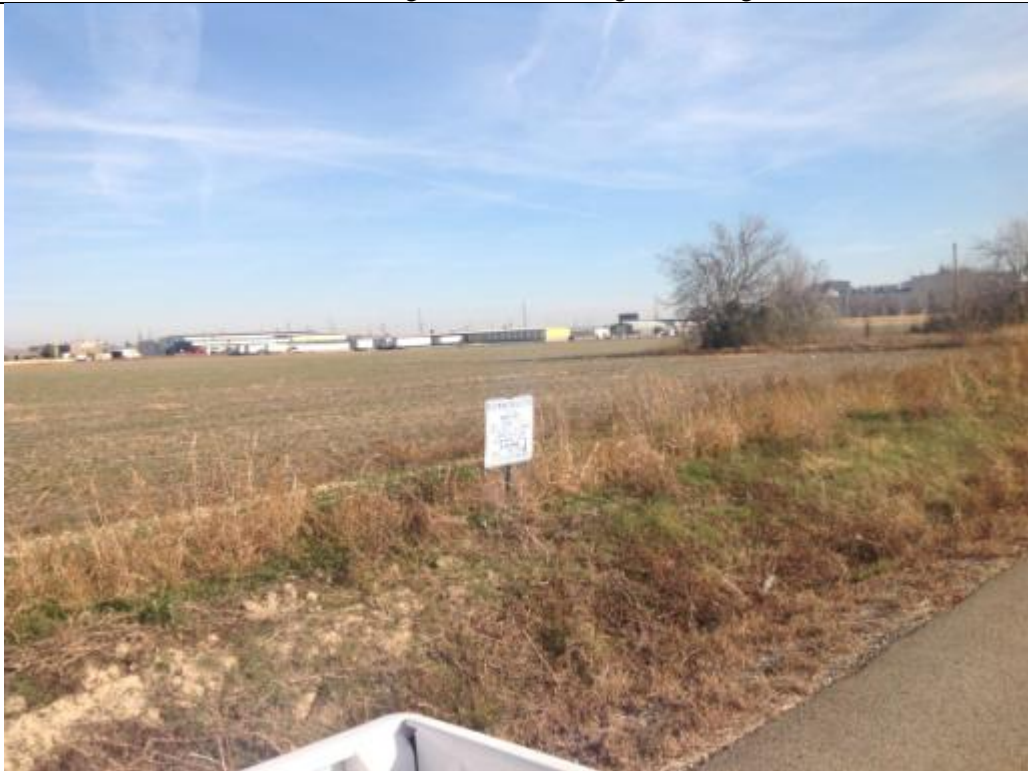
View looking northeasterly toward subject site from CW Post Rd.