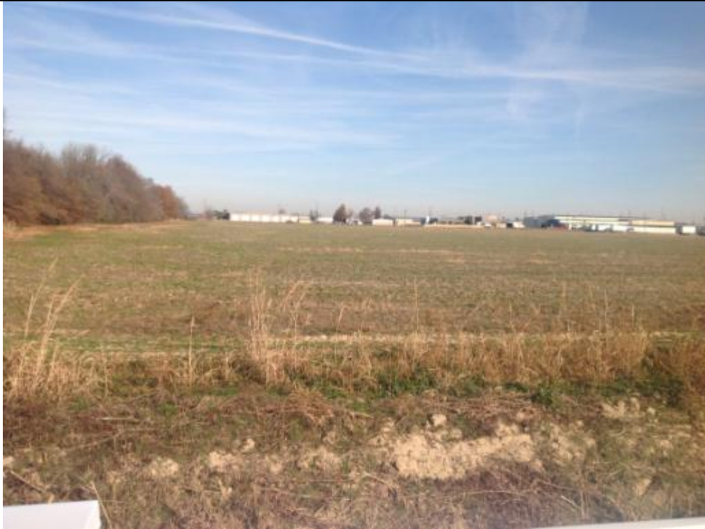
View looking North toward site