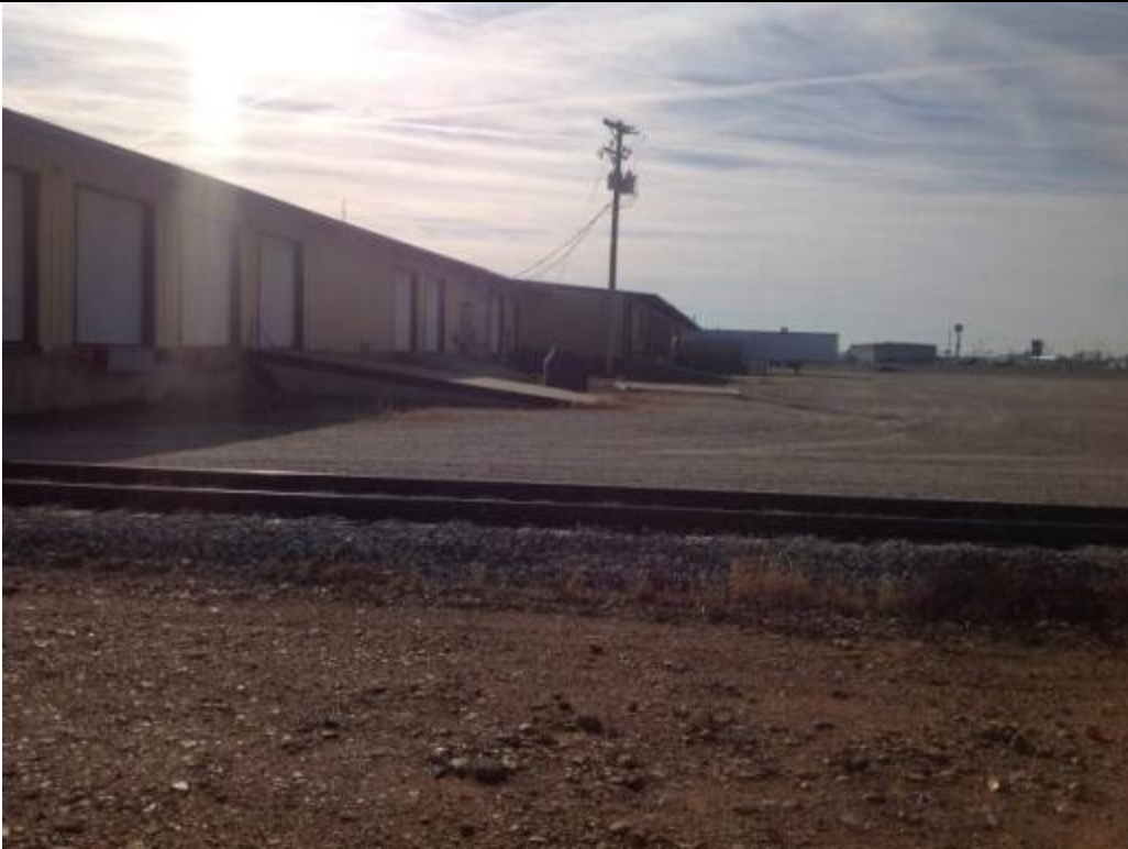
View looking south from adjacent industry north of site.