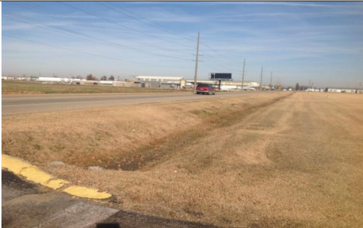
View looking North along Commerce at Post Cereal, Site is to left