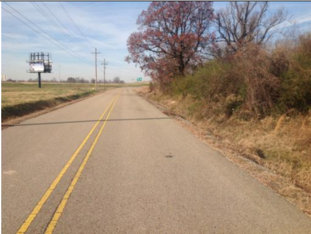
View looking west, site frontage to the right