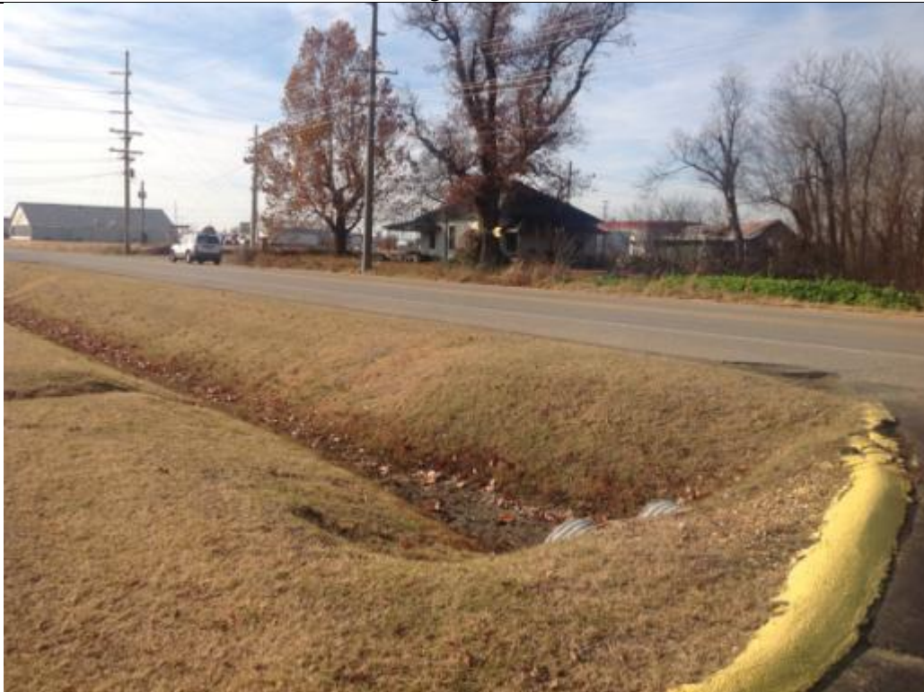
View at Post Cereal looking South towards I-63- Site is to right.