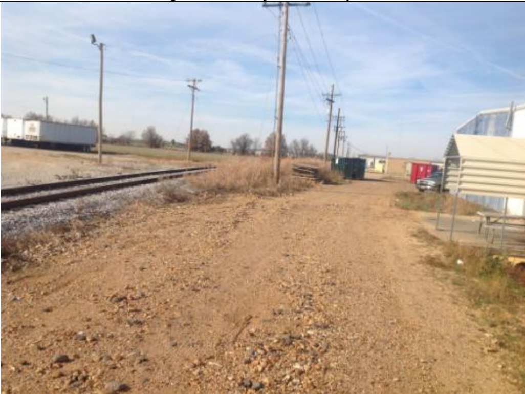
View looking west along railroad towards the north boundary of site.