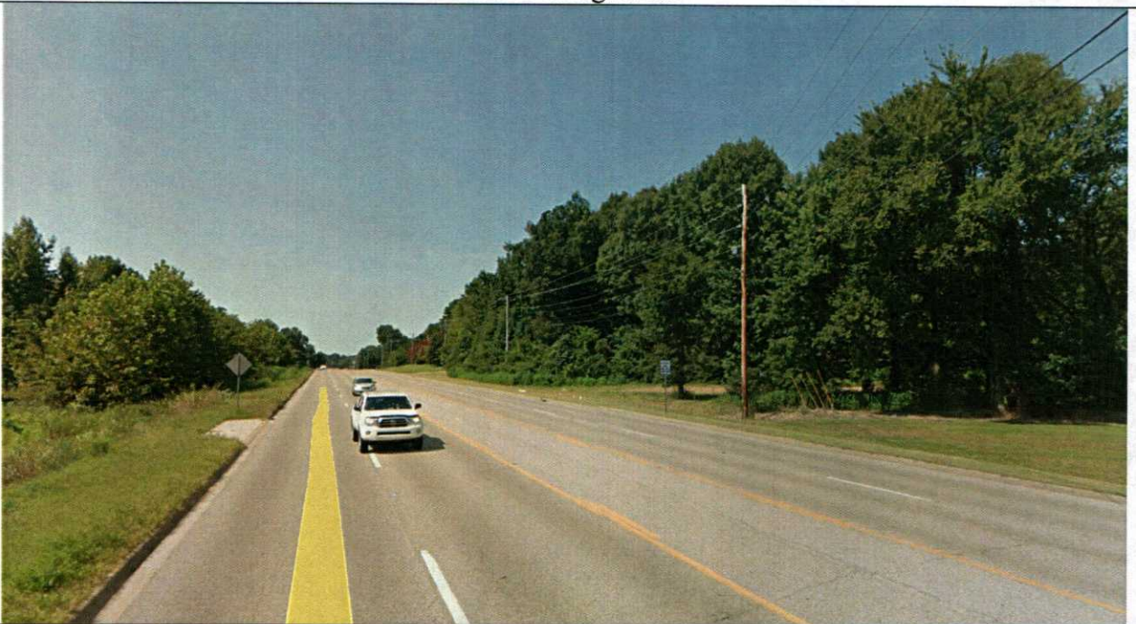
View looking West