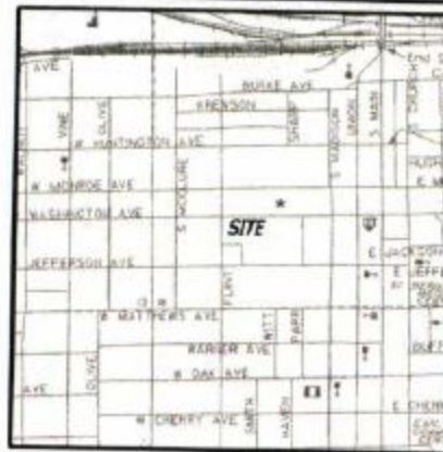
VICINITY MAP (N.T.S)

BEARINGS BASED ON ARKANSAS STATE PLANE GRID NORTH ZONE (0301)