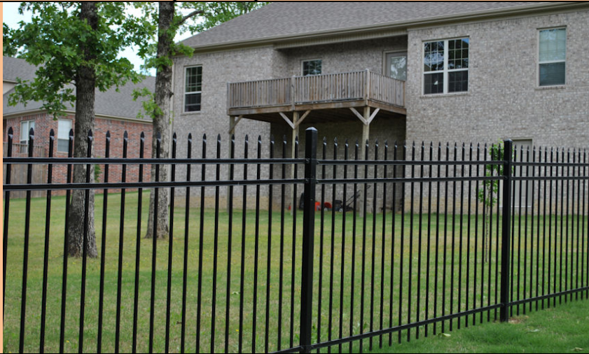
Sample of Proposed Ornamental Fence