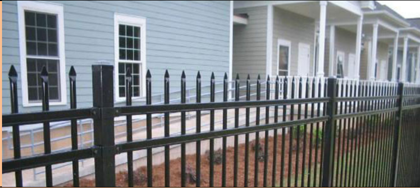
Sample of Proposed Ornamental Fence