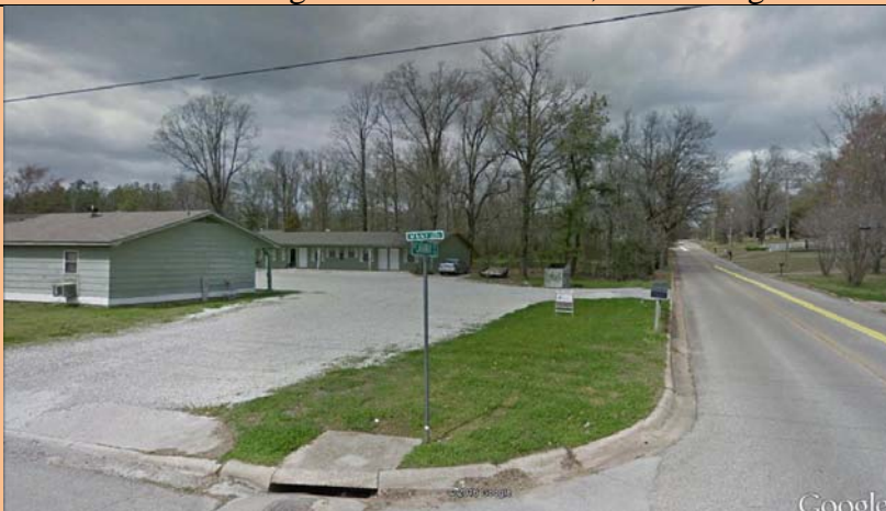
View Looking North on N. Caraway- Site on Left