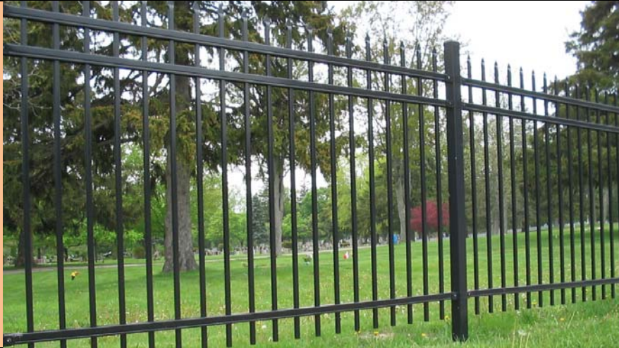
Sample of Proposed Ornamental Fence