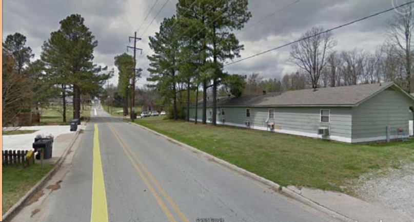
View Looking West on Belt Street, Site on Right

Joshua Moss, Moss Fencing LLC requests MAPC waiver of the 4 ft. height requirement to allow 6 ft. Ornamental Perimeter Fencing to surround 2 apartment complex subdivision lots for property located at 601 N. Caraway.