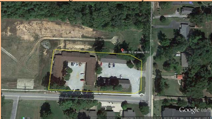
Aerial View Showing Proposed 6 ft. Ornamental Fence Location