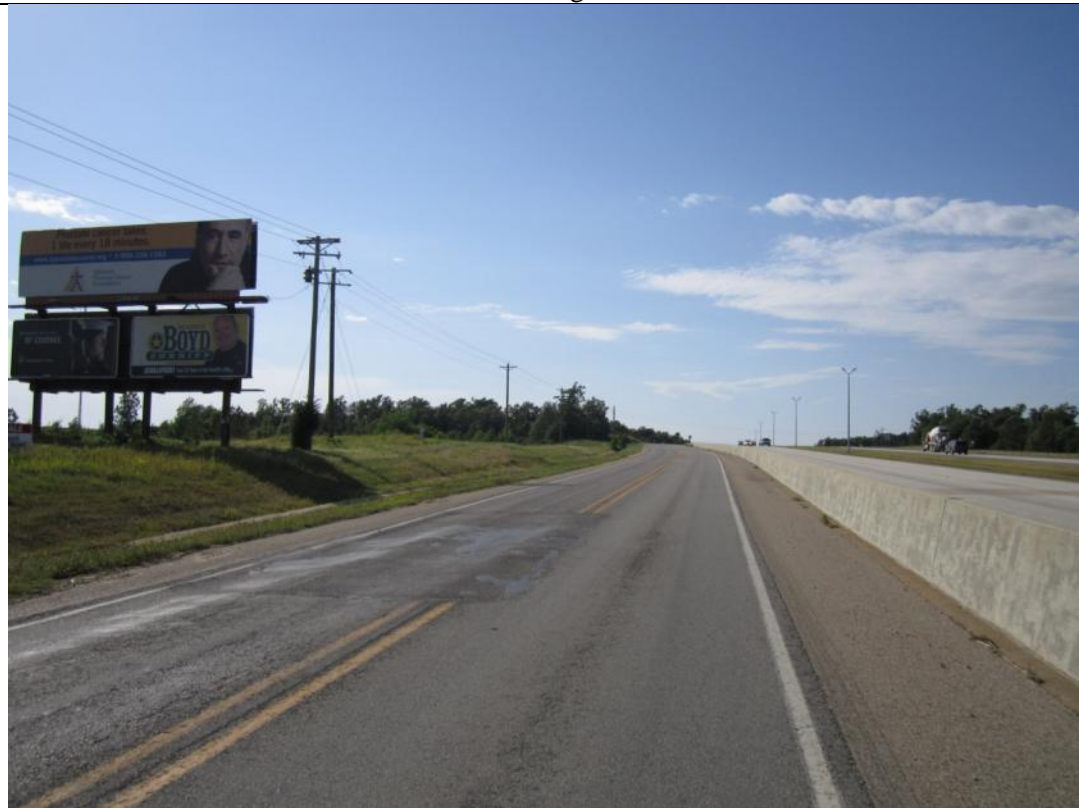
View looking Northwest along Parker Rd. Frontage & I-63