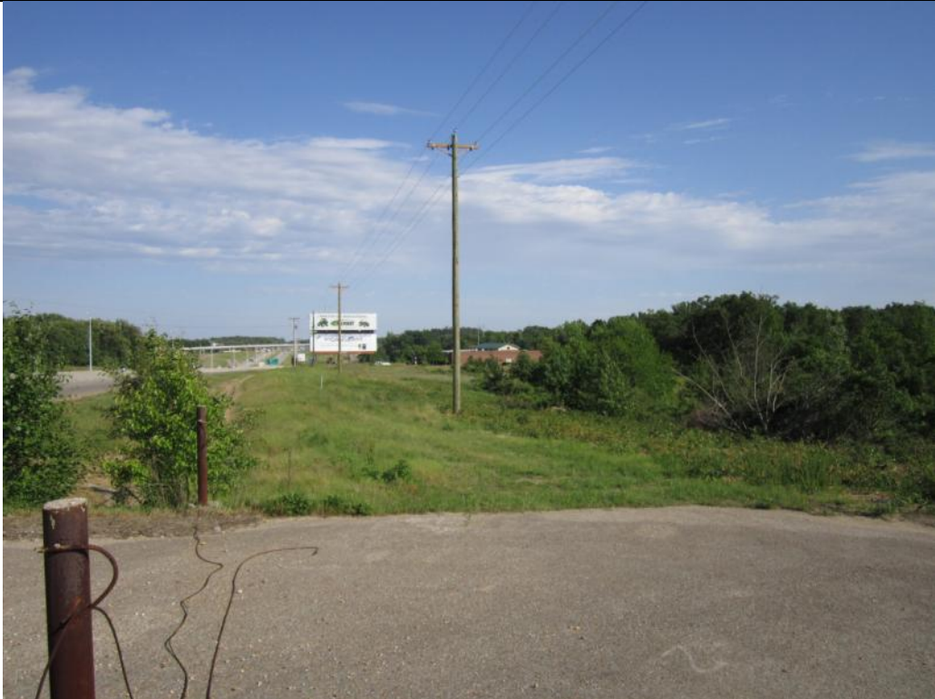
View looking Southeast from driveway on Subject Property