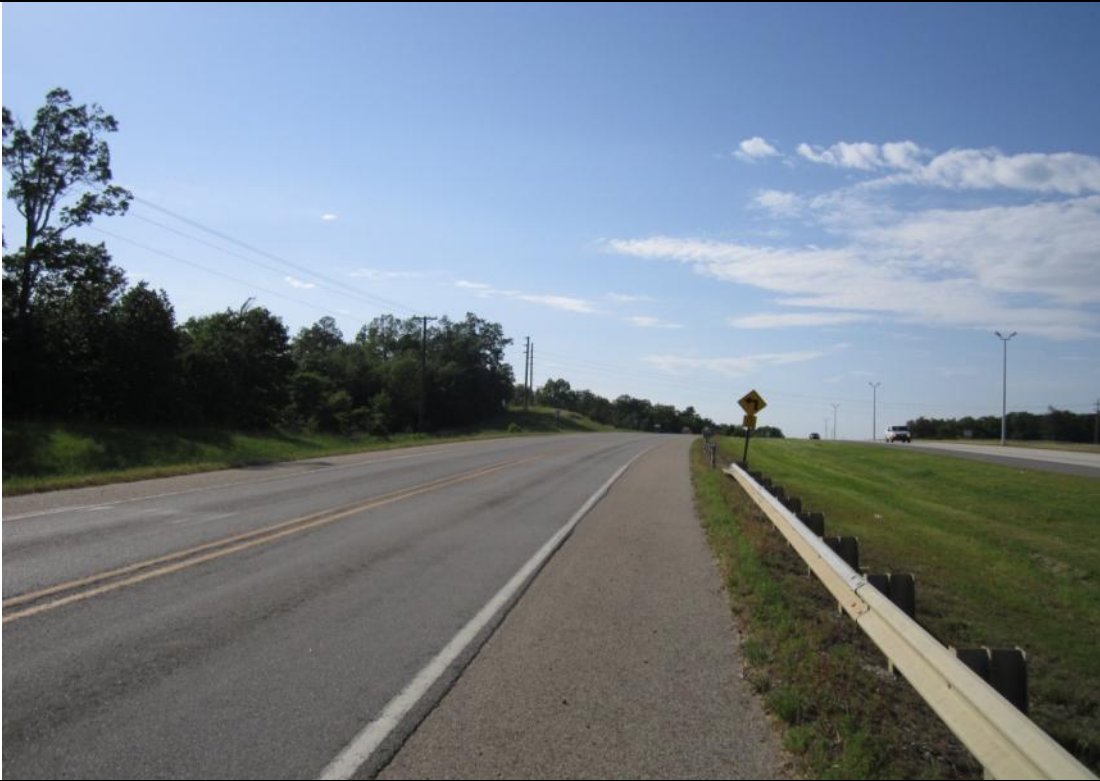
View looking Northwest along West Parker Road near Strawfloor Rd.