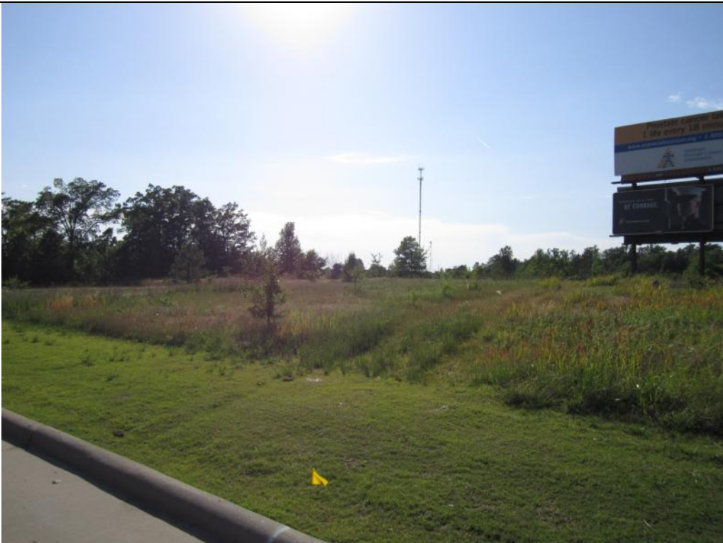
View looking West from abutting property.