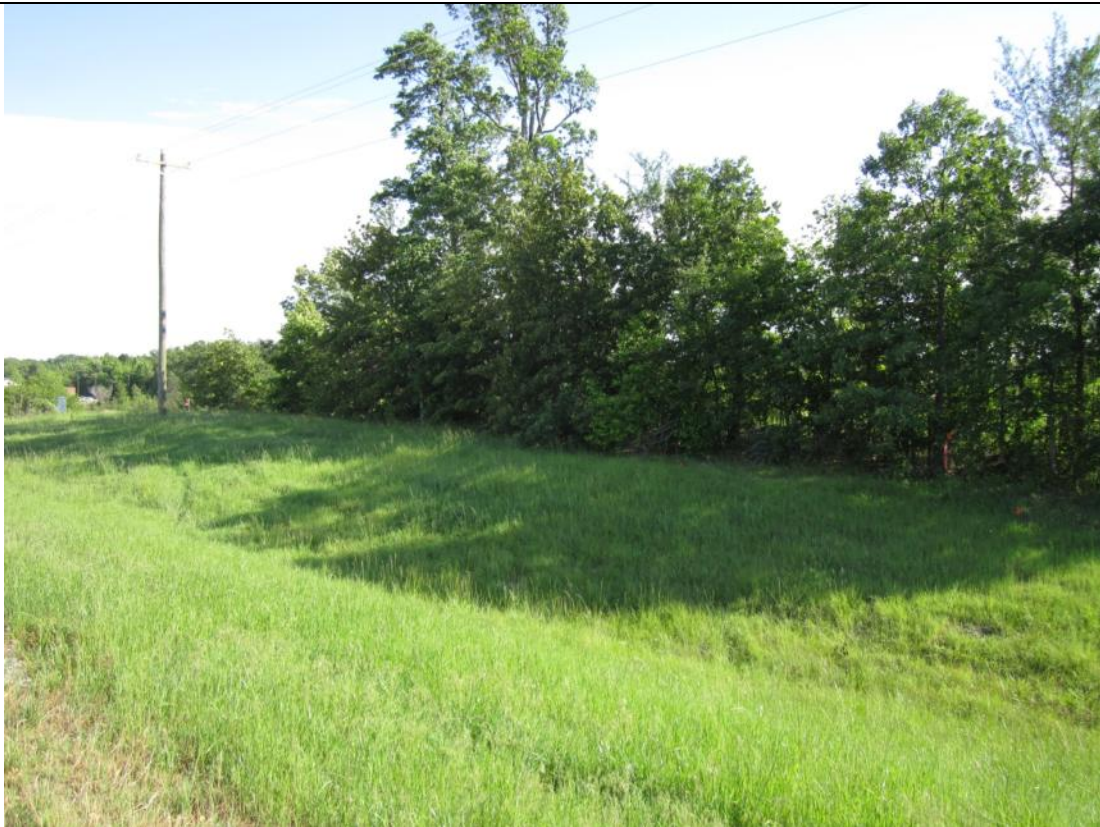
View looking Southeast along property frontage on West Parker