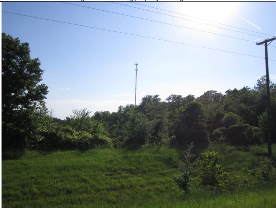
View looking west from property frontage