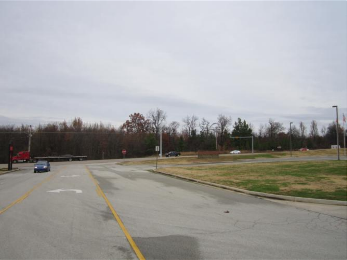
View looking North from Fire Station entrance toward project site