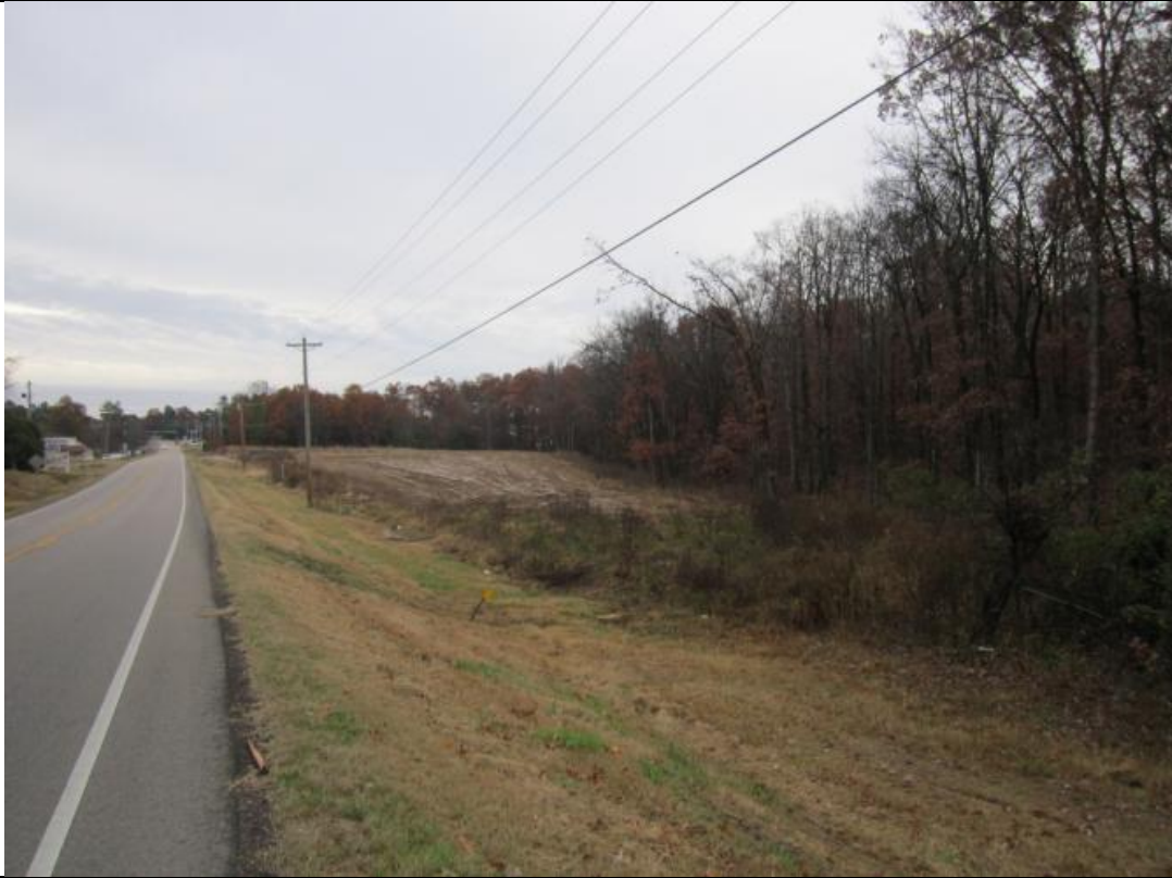
View looking Southwest on land zoned C-3 LUO East of the site (along Hwy. 351 N)