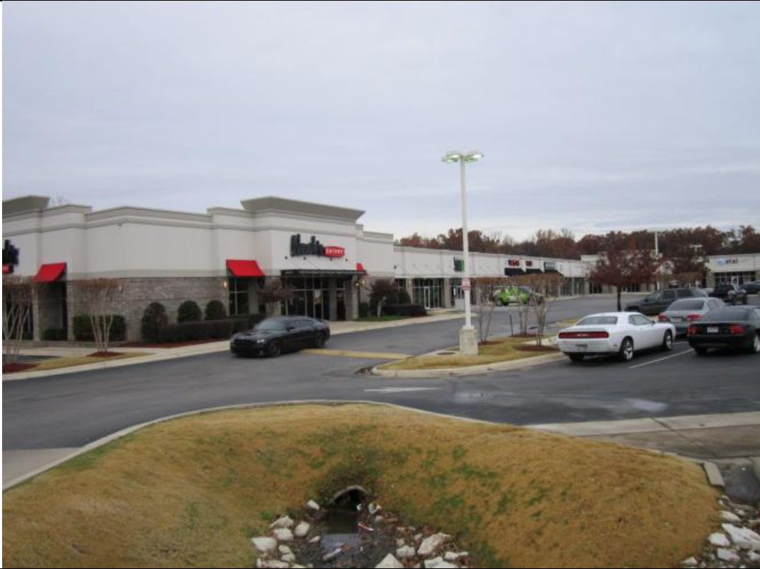
View looking North at Quinn development East of project site