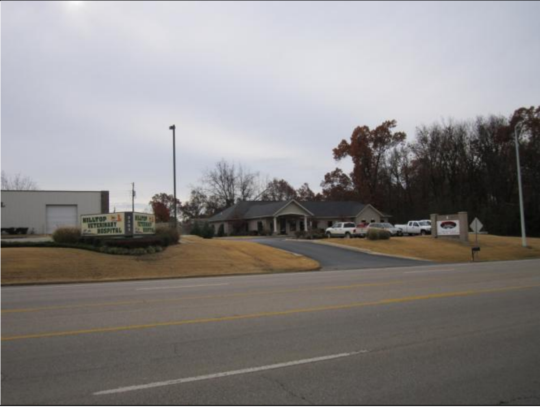
View looking toward Commercial on South side of E. Johnson Ave.