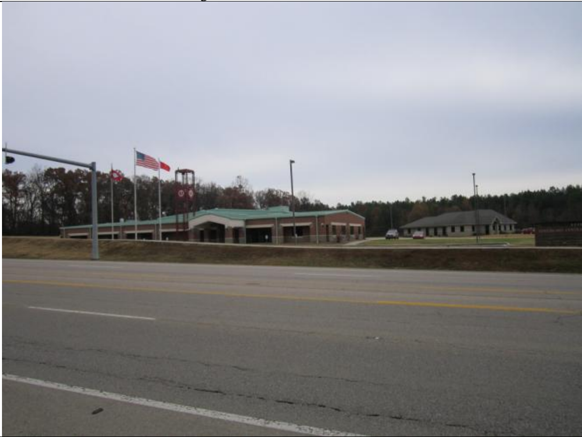
View looking South from site towards Fire Department location