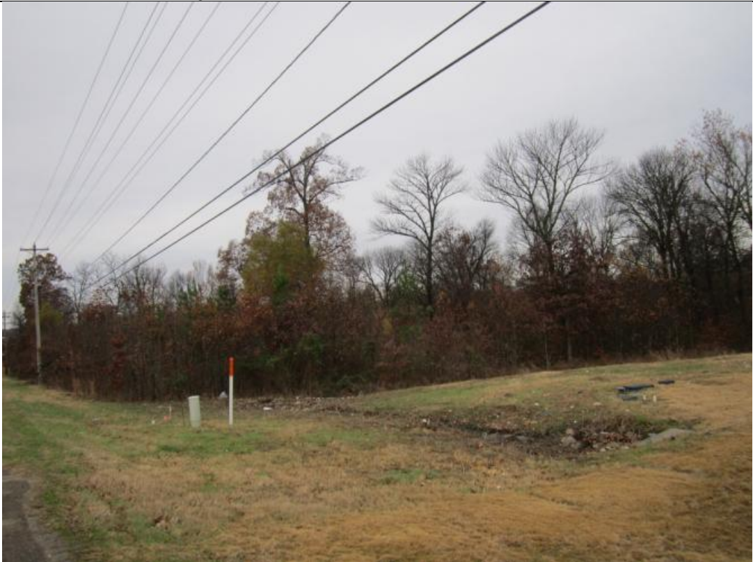
View looking West along site frontage along Hwy. 49 N/E. Johnson