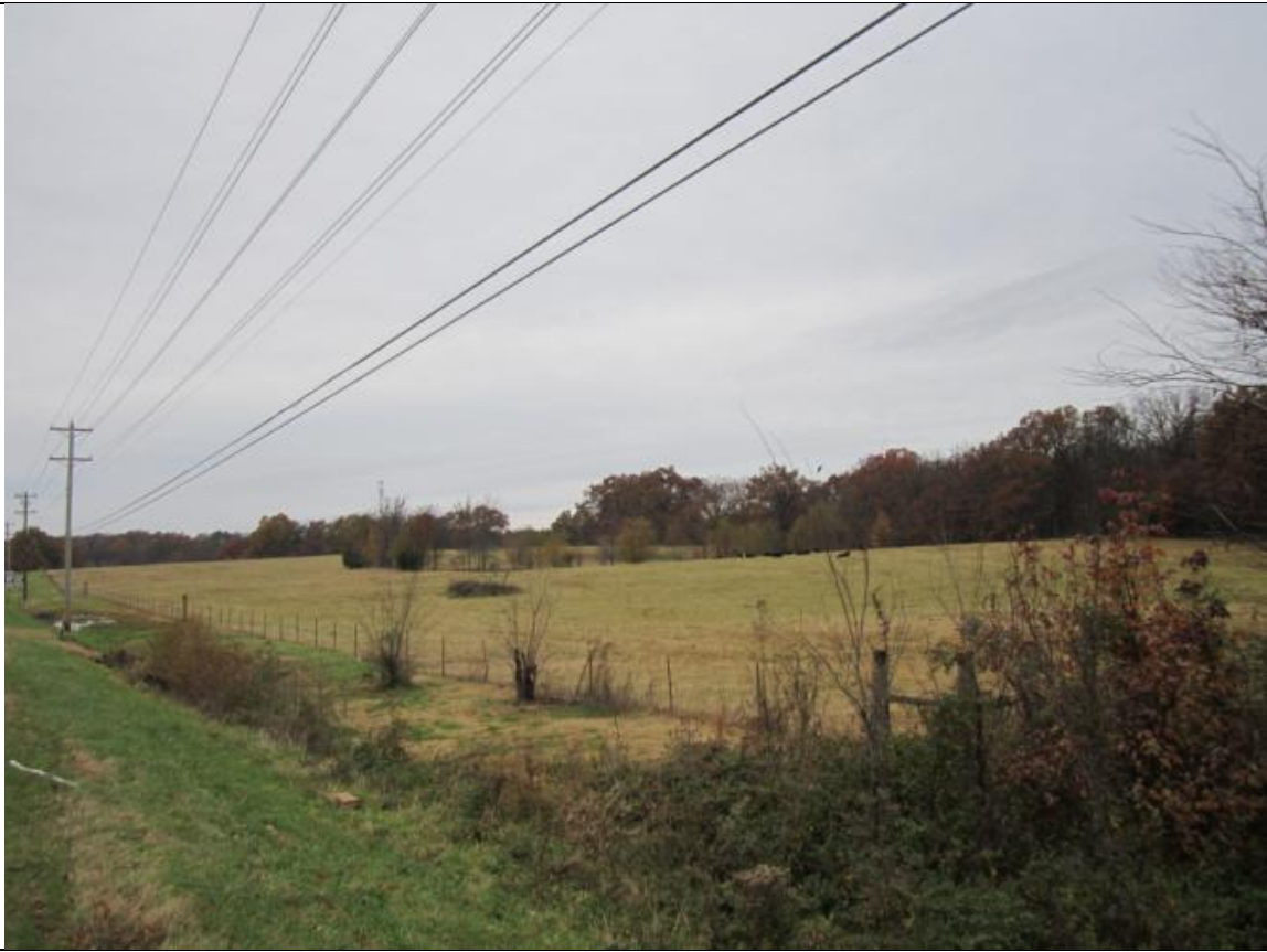
View looking Northwest toward site from Johnson Ave.