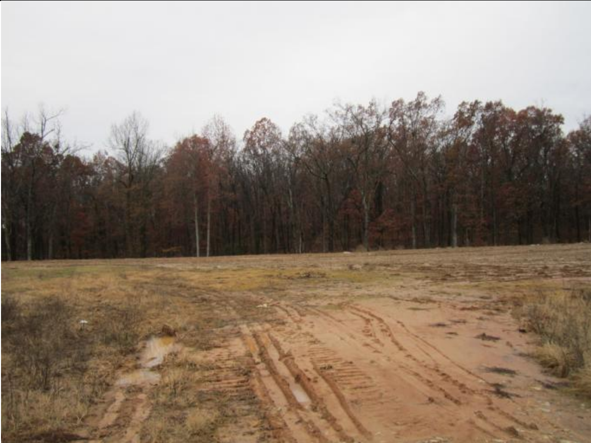
View looking west toward site, on land zoned C-3 LUO East of the site