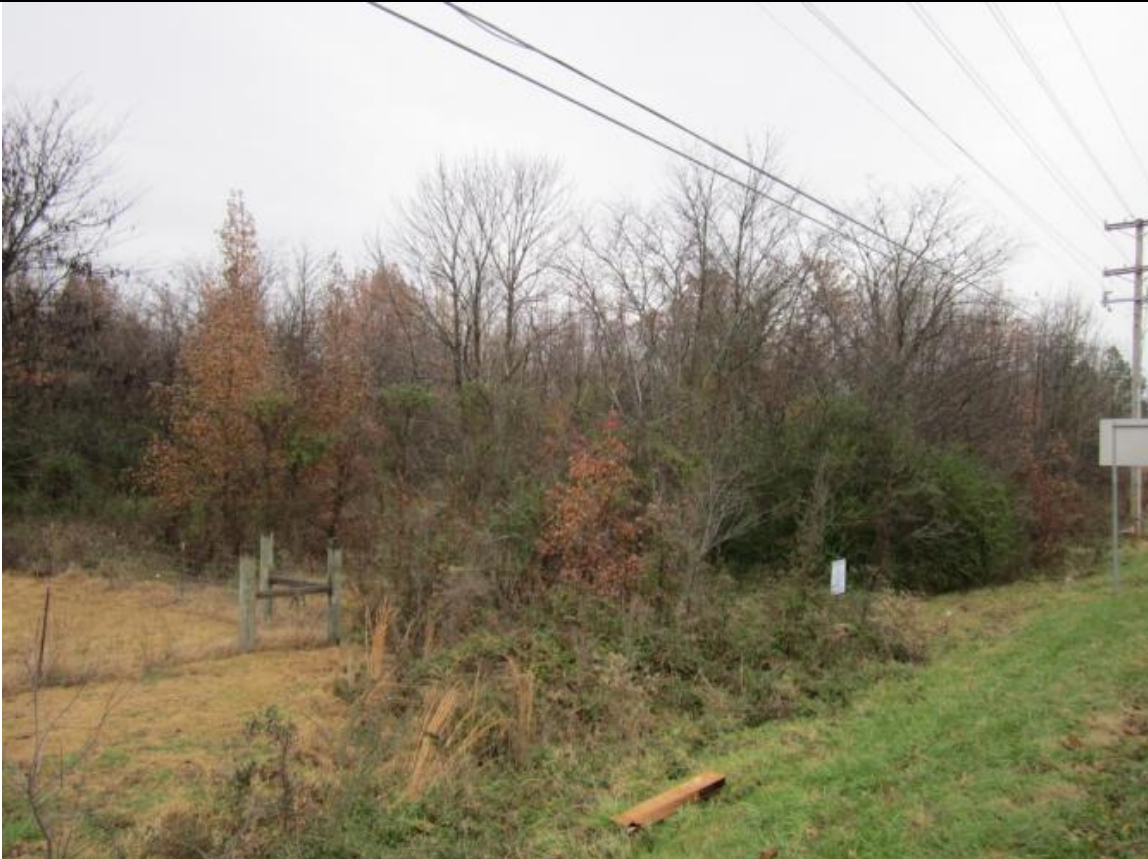
View looking Northeast along Johnson Avenue property frontage