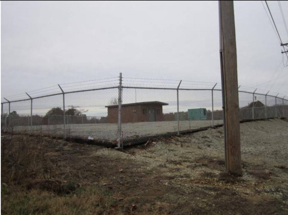
View looking east towards a CWL Power Station directly northeast of site along Hwy. 351