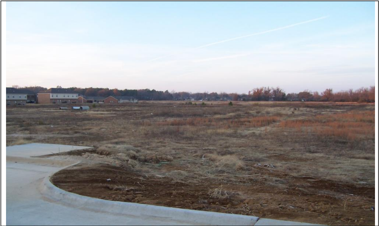
View looking north along Stadium Blvd.