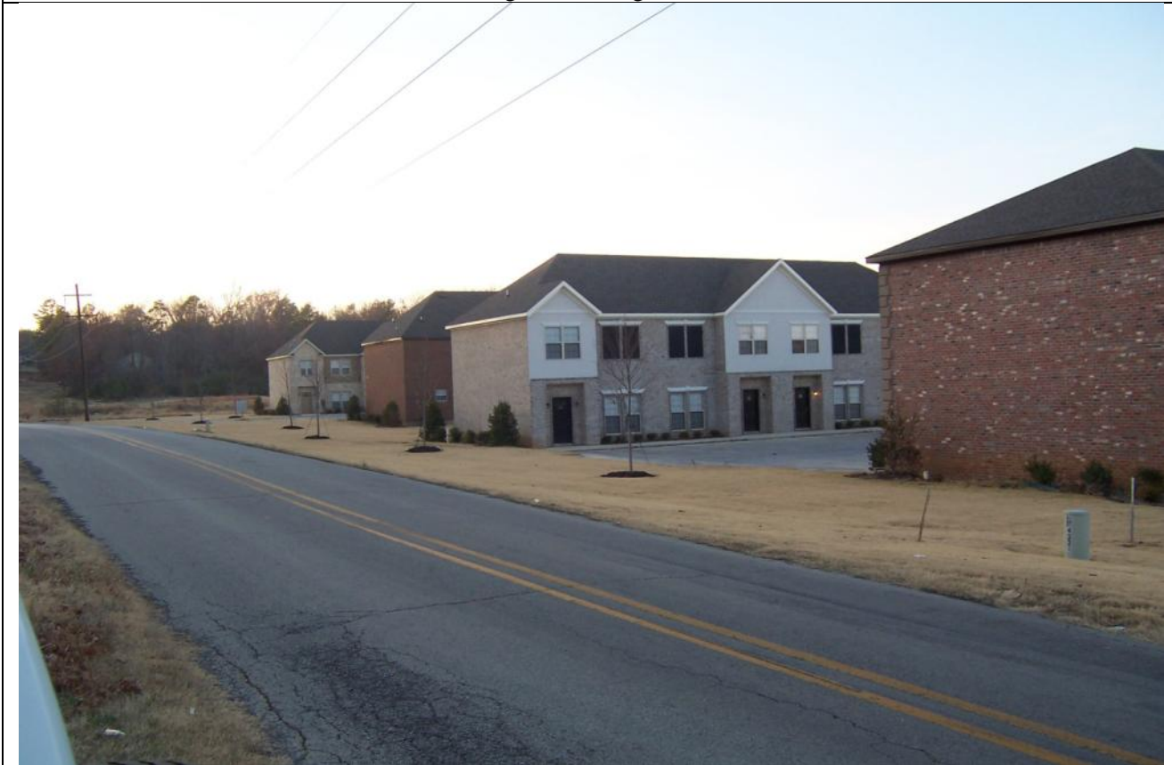
View Looking north along Stadium Blvd.