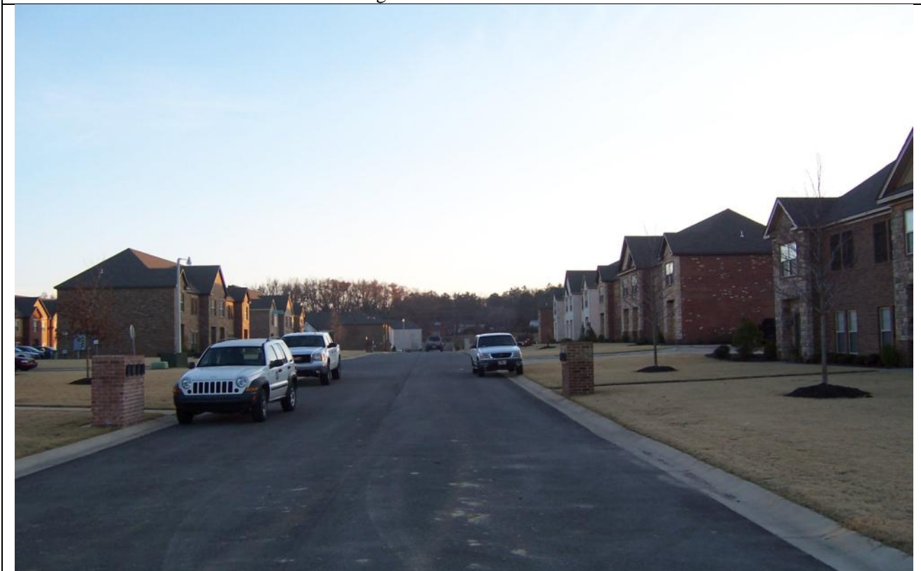
View looking west of the subject property from the rear.