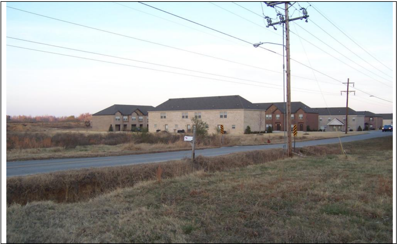
View looking south of the rear yard.