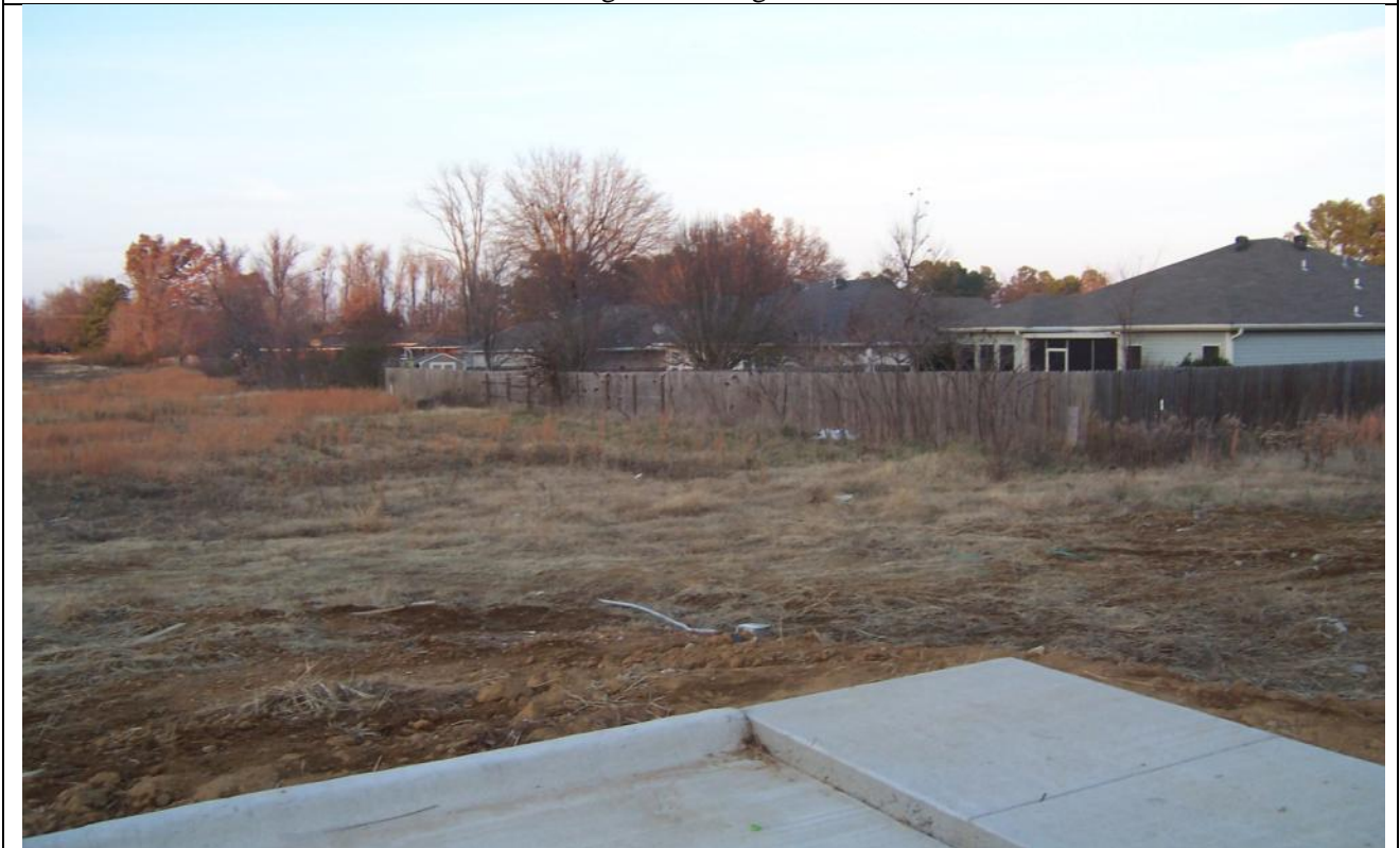
View Looking east at the subject property.