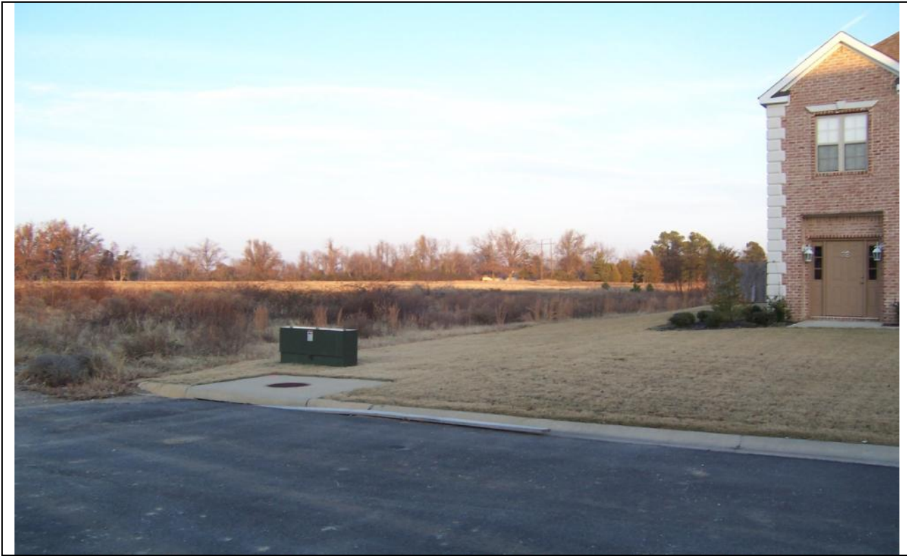
View looking west of the home from the rear.