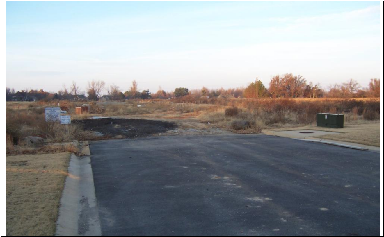
View looking north of the rear yard.