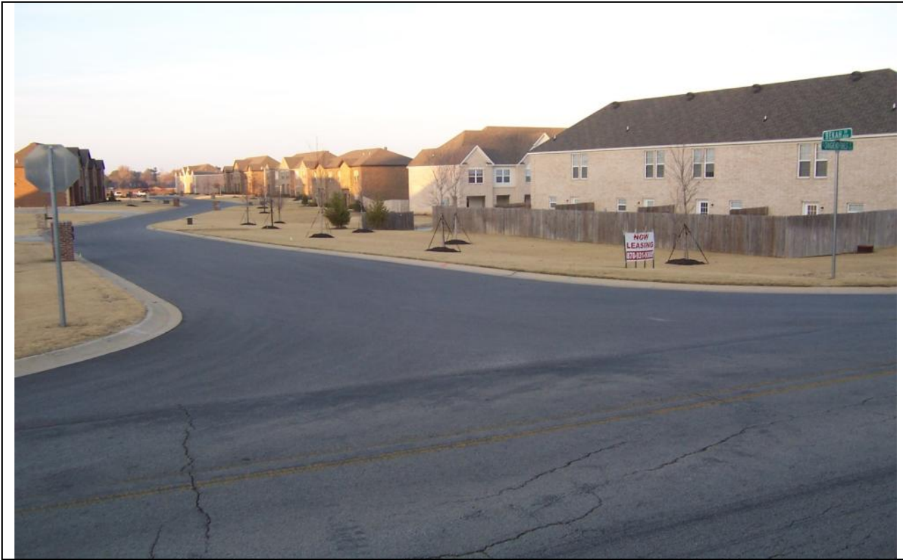
View looking south along Stadium Blvd.