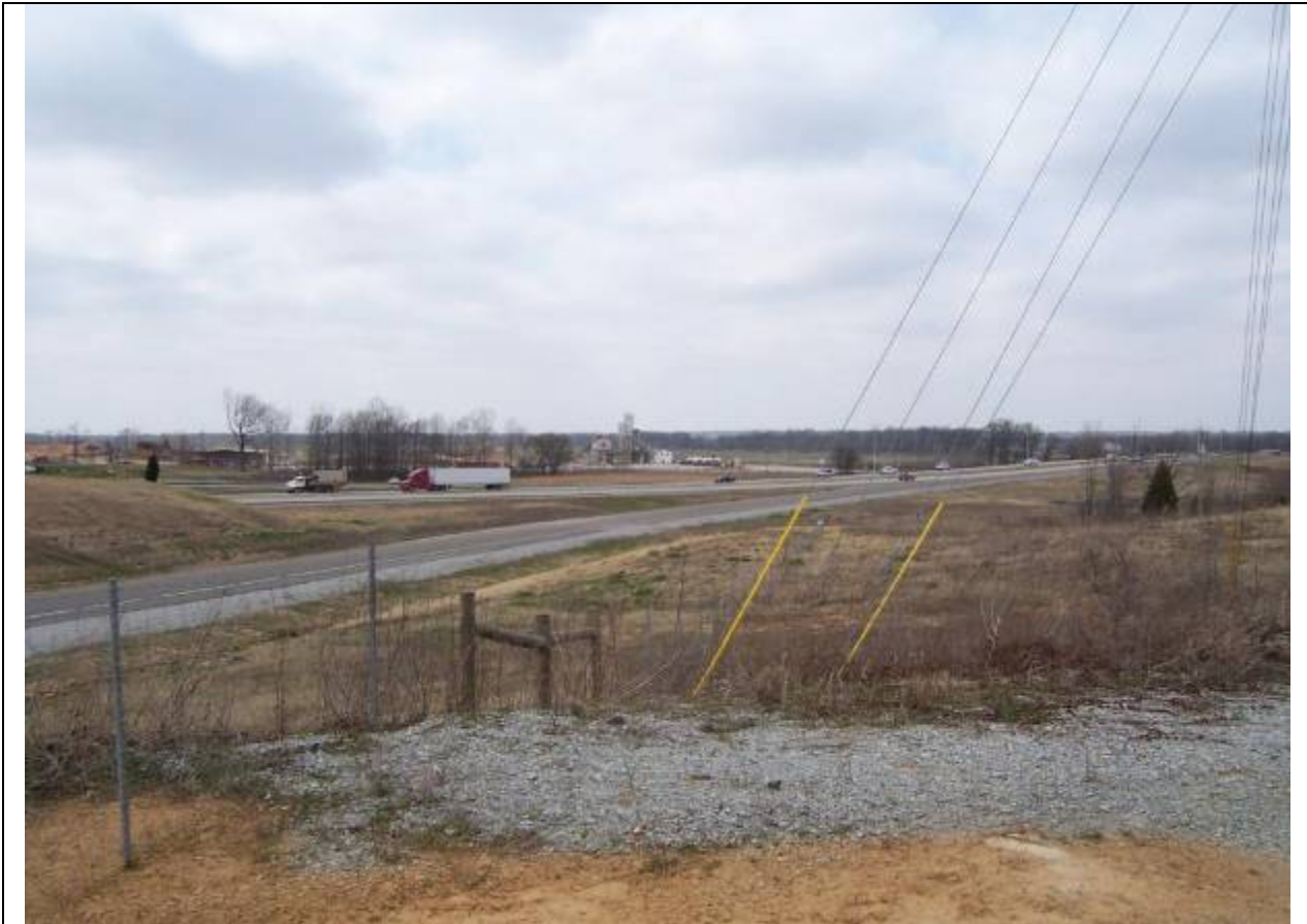
View looking Northwest toward property