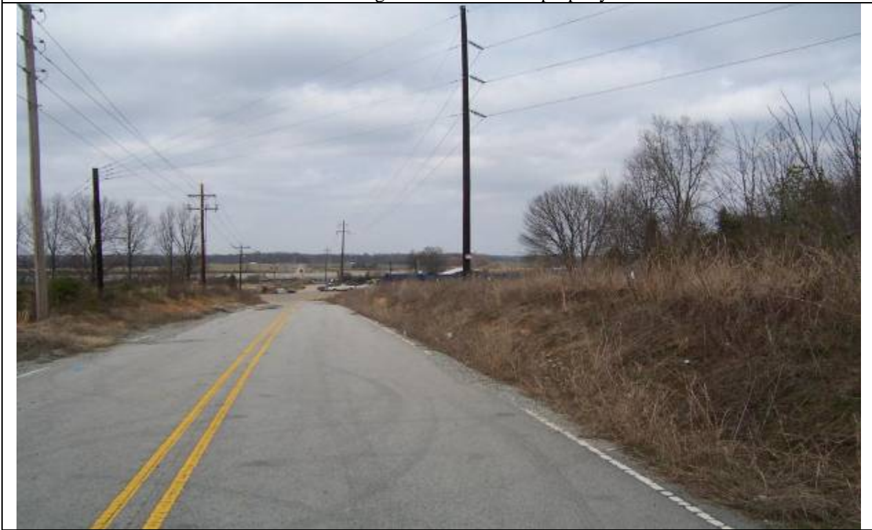
View from the site looking toward the north along Lacy Dr. Frontage