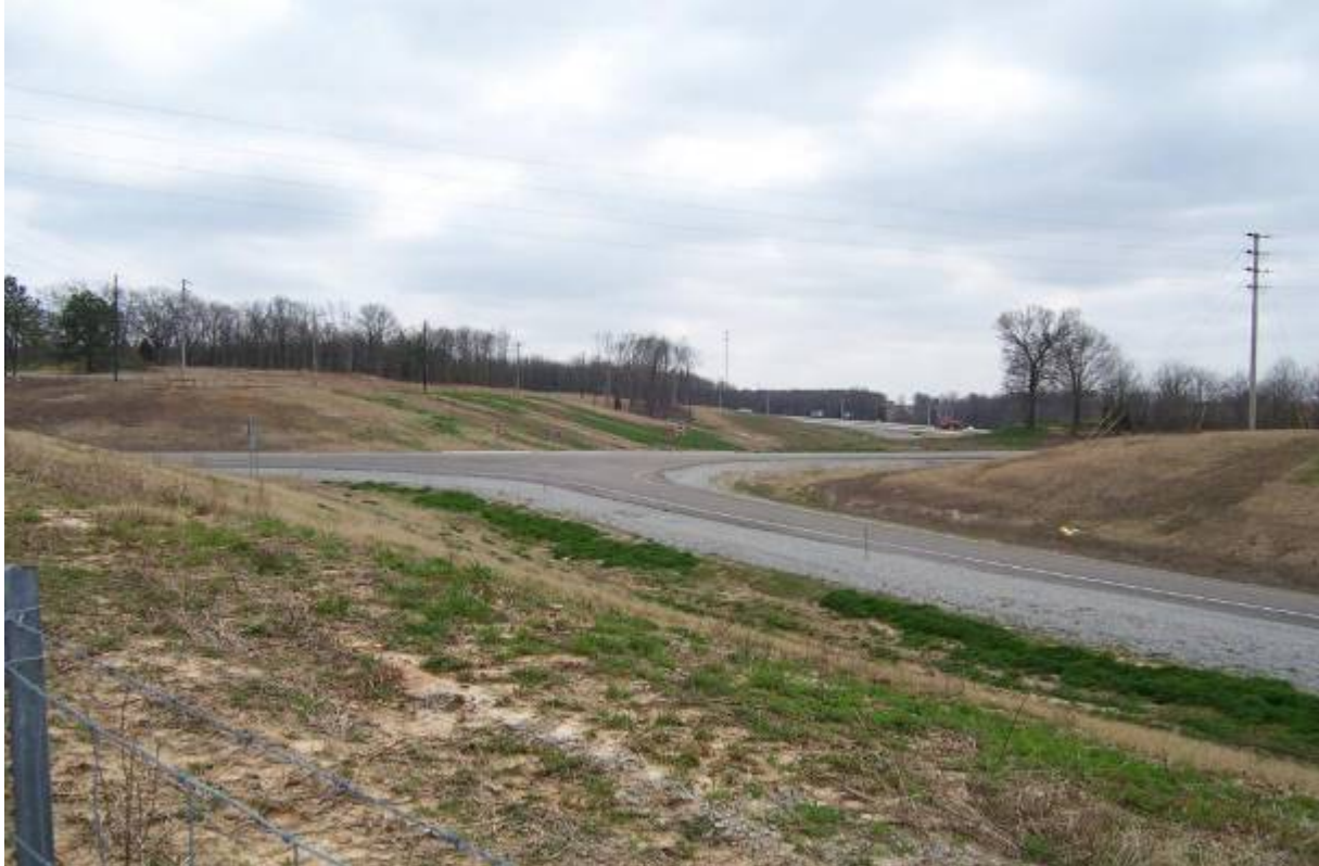
View of the site looking Southwest