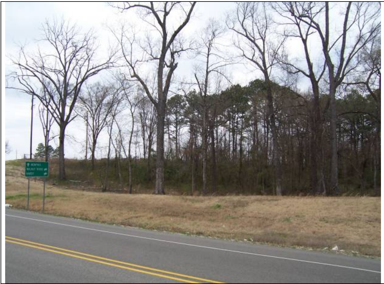
View looking toward the site Northwest along W. Washington Ave.