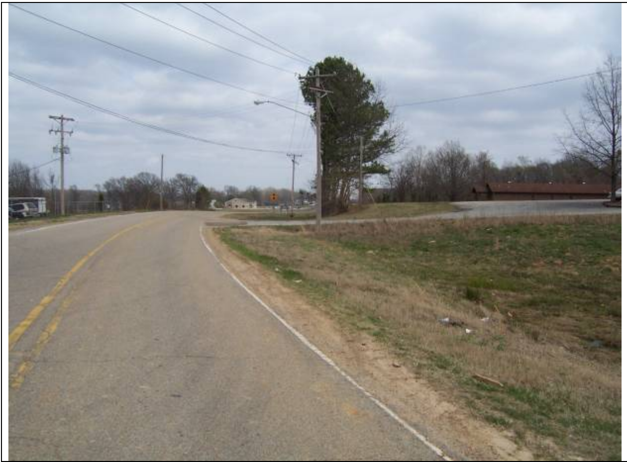
View looking East along W. Washington Spur