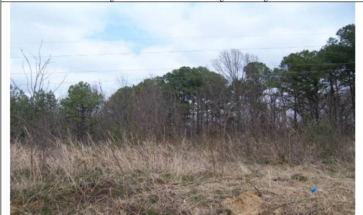
View of the site looking East along Lacy Dr.