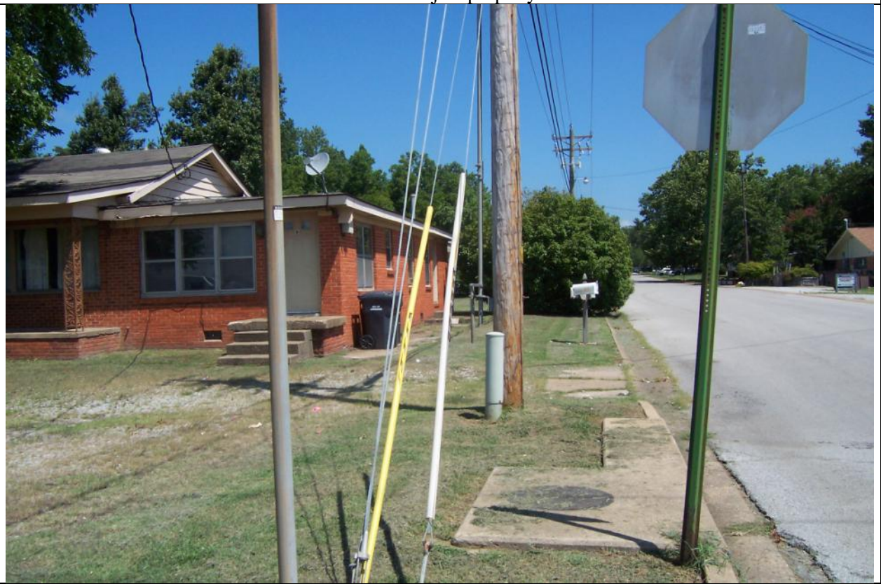
View of frontage along Pardew St.