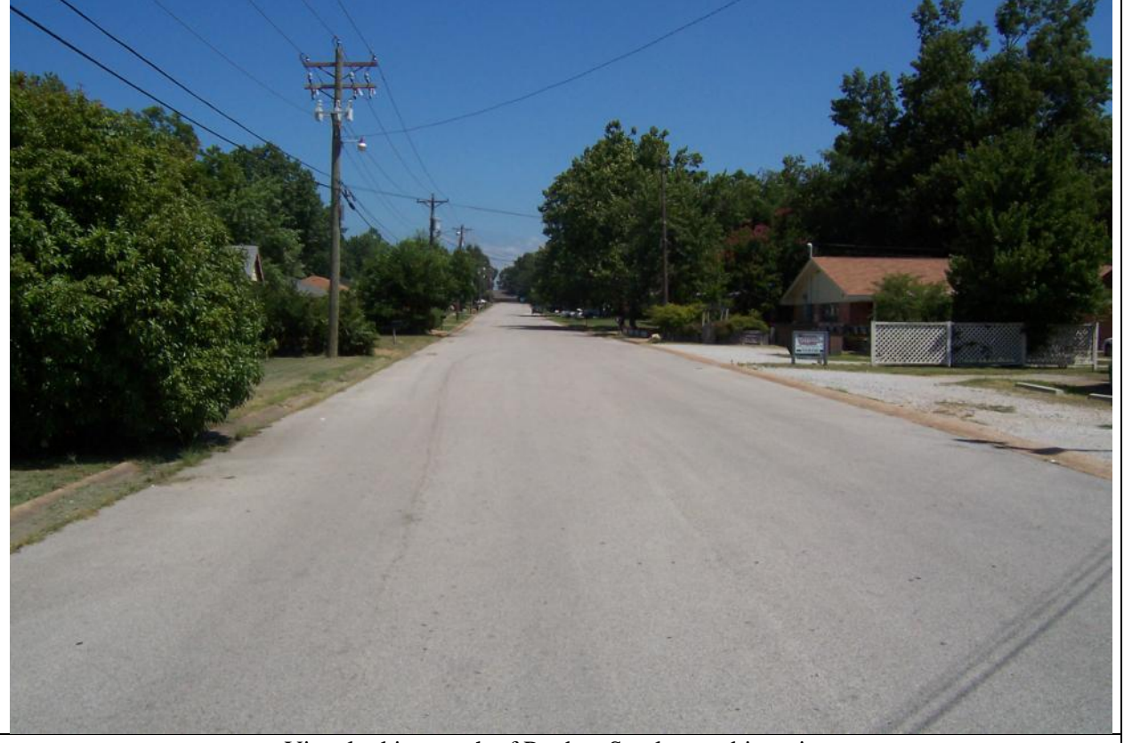
View looking north of Pardew St. along subject site.

View looking east from the subject site.