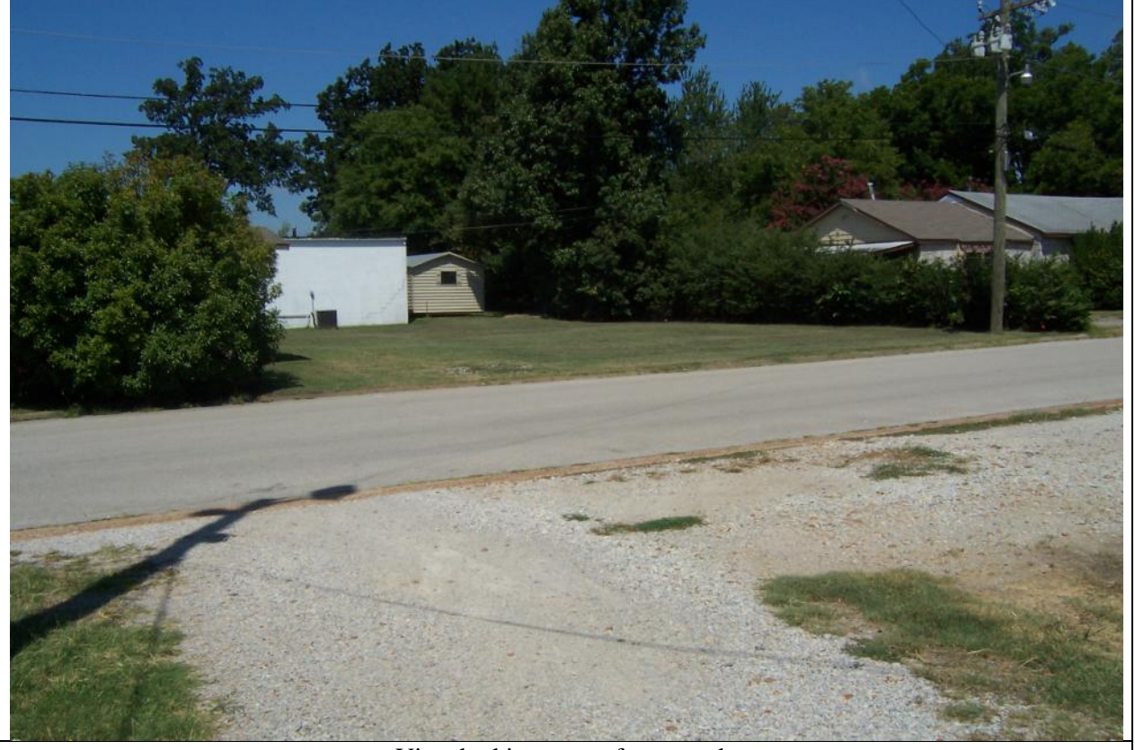
View looking west of rear yard.