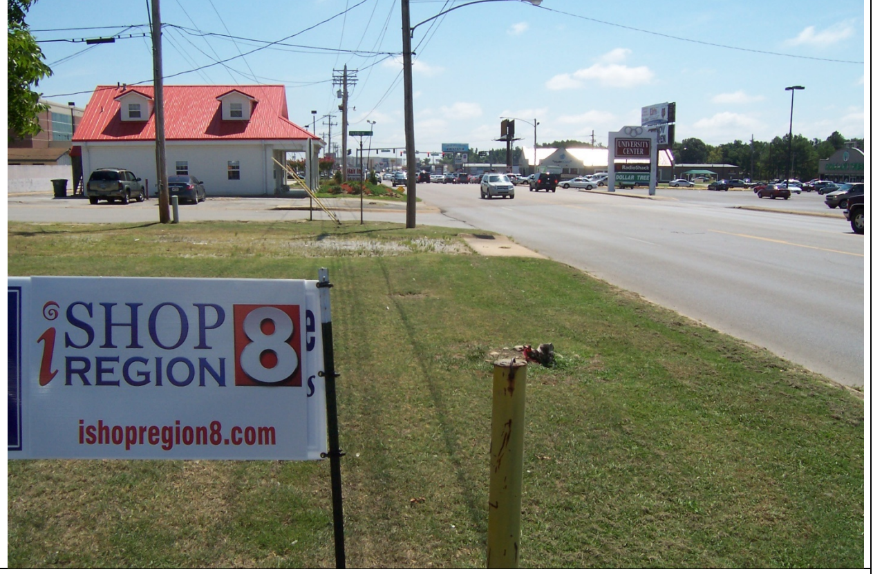
View of frontage along Nettleton Ave.