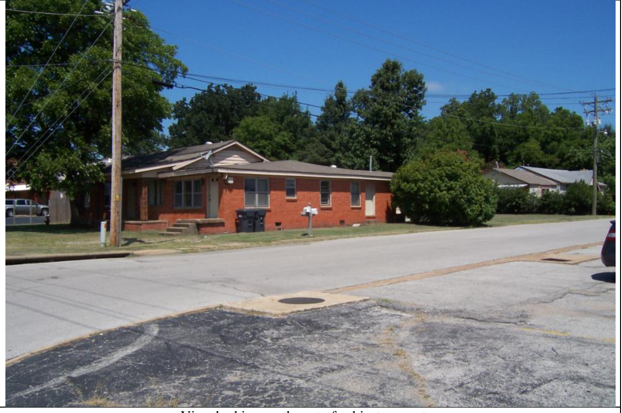
View looking northwest of subject property.