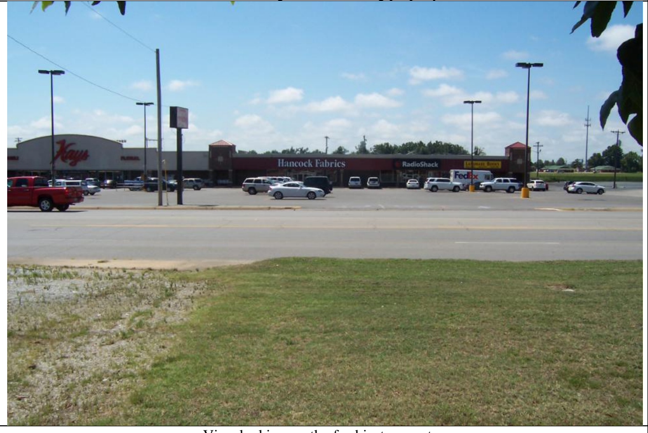
View looking south of subject property.