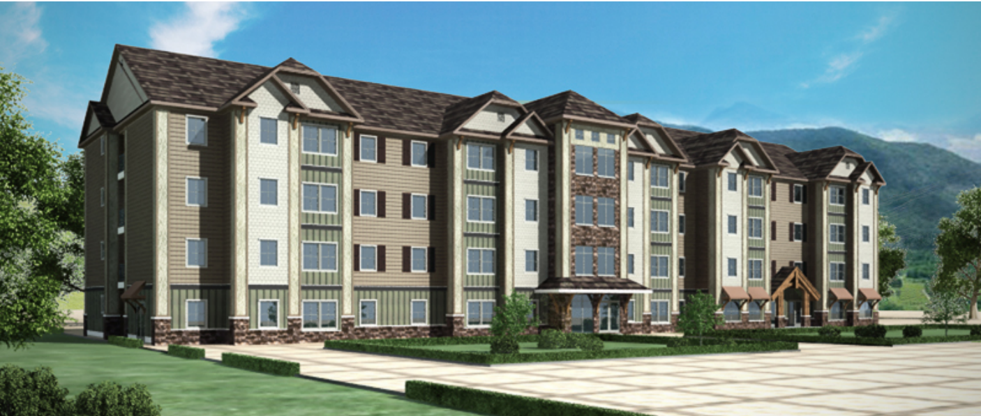
Mountain View | Asheville, NC