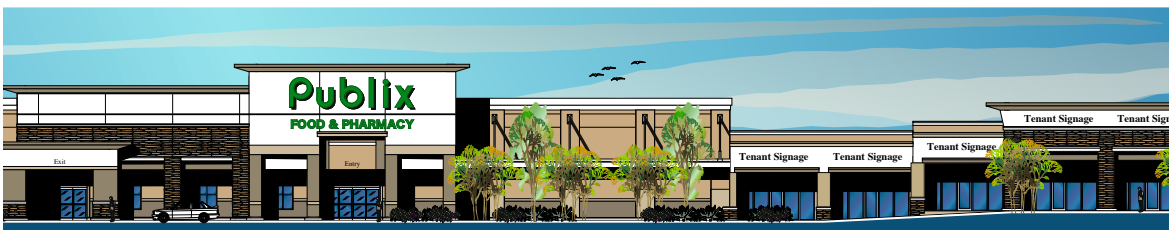
Publix | Greenwood, SC