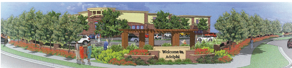
Adelphi | Adelphi, MD