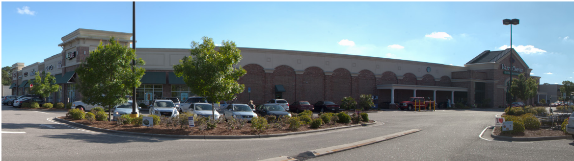
Long Leaf Mall | Wilmington, NC