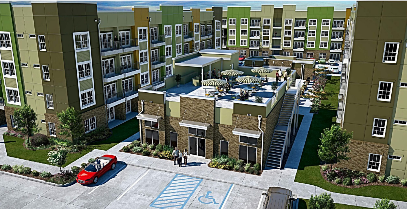
City View Apartments | Knoxville, TN