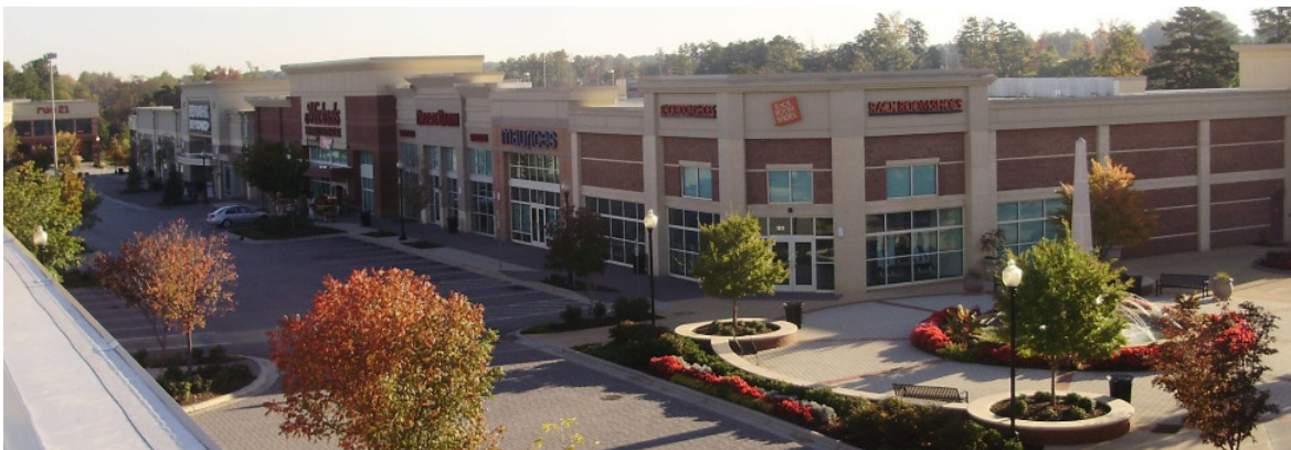
Jefferson Village | Greensboro, NC