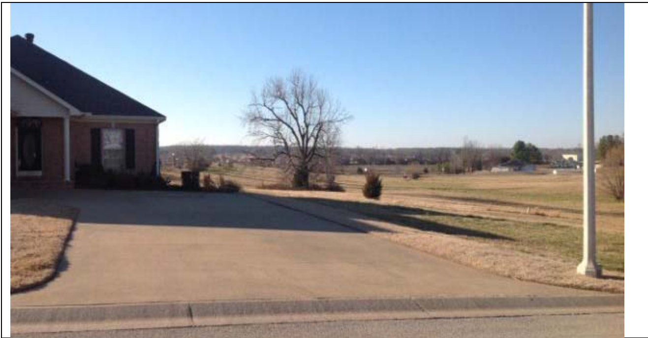
View looking west from Western Gales Dr. (Site in background)