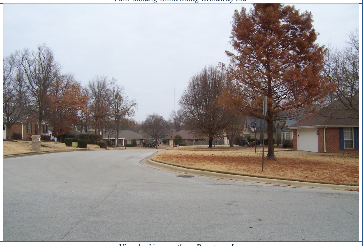
View looking north on Brentway Ln.