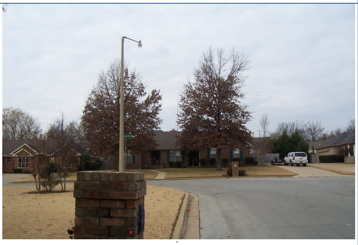
View looking west of the site (from Greenmeadow Ln).