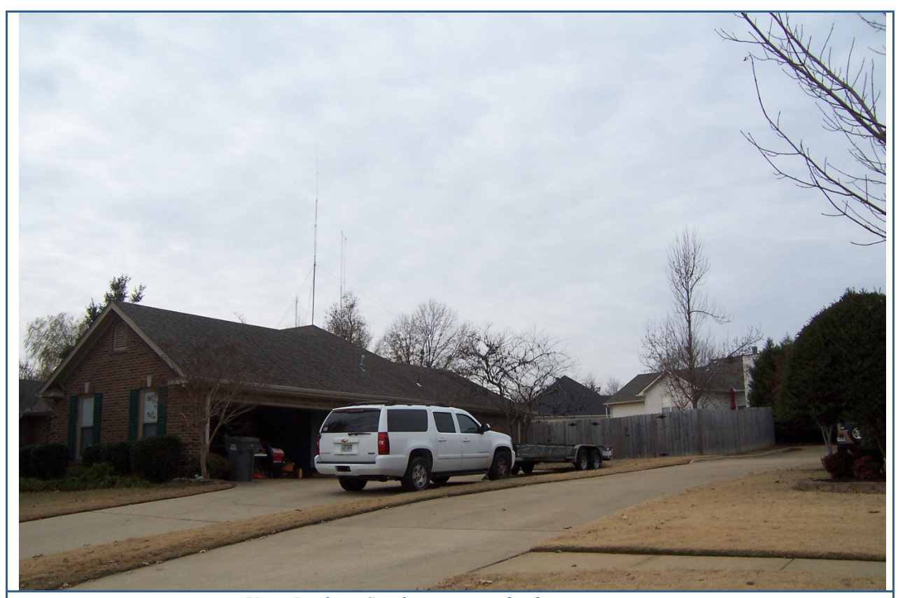
View Looking Southwest toward subject property.