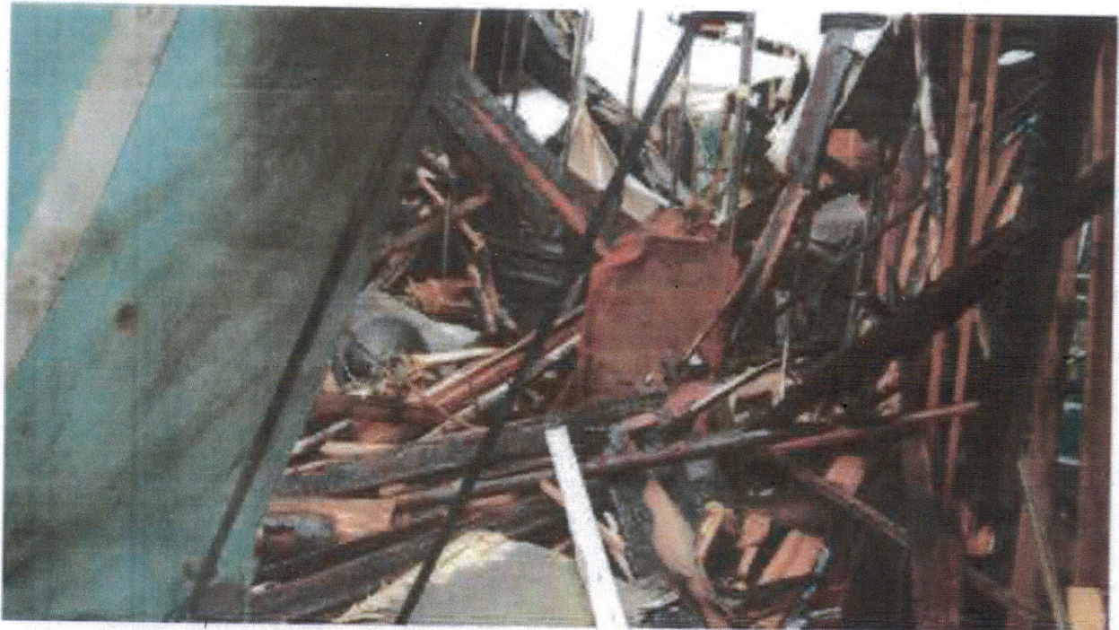
Photo 29 - Loft southwest unit looking west. Collapsed ceiling and walls.