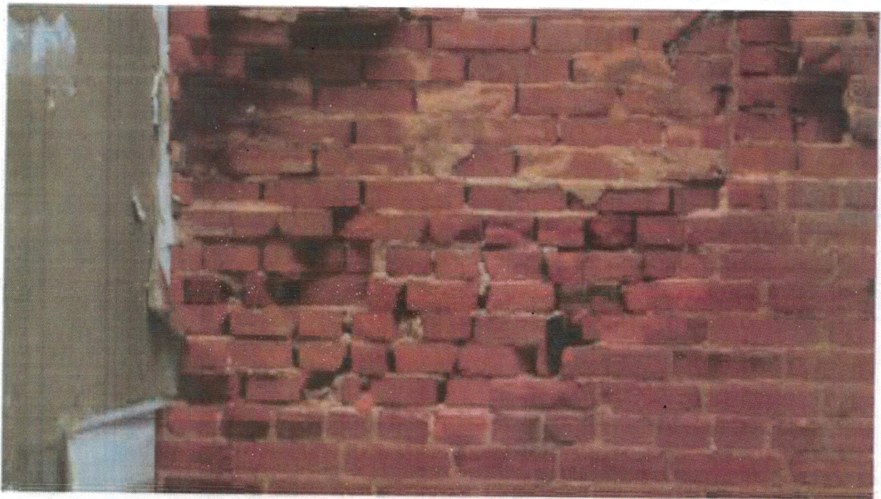
Photo 36 - Loft northeast unit looking east. Example of brick construction - missing bricks are piled on the floor not just below the bottom of this picture.