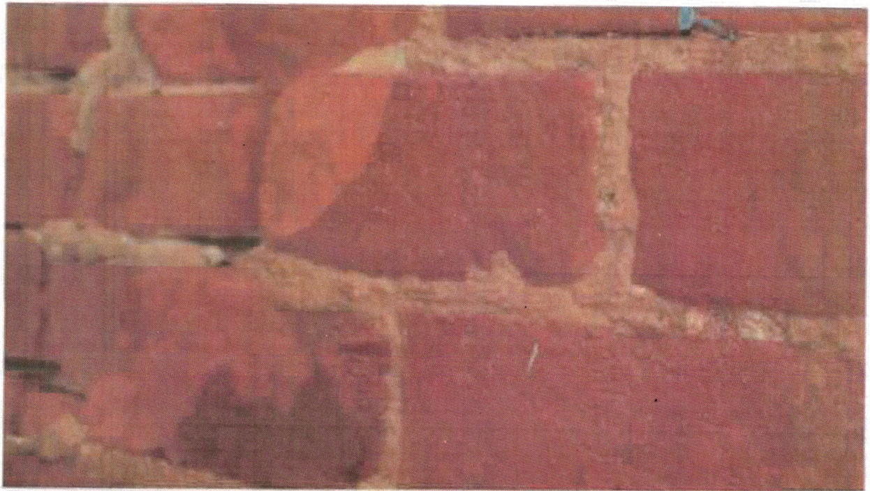
Photo 37 - Loft northeast unit looking east. Example of brick construction - sealant is evident in the darker colored brick. Where sealed the mortar is hard on the exterior of the brick, but soft 1/2" or so within the brick wall.