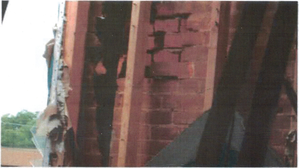
Photo 32 - Loft southwest unit looking south along west wall at window. Window & frame knocked out, damaged brick