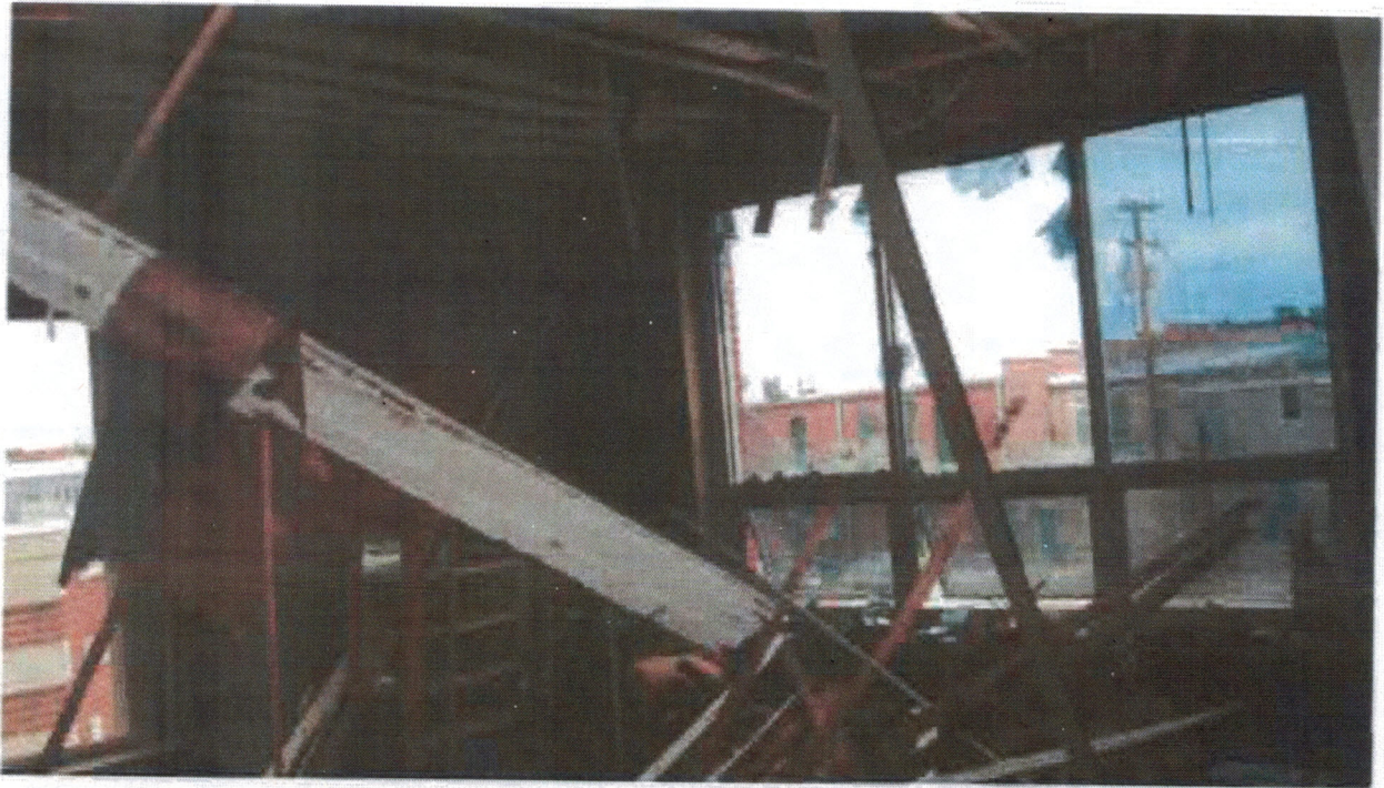
Photo 35 - Loft northeast unit looking at northeast corner of building. Ceiling collapse.