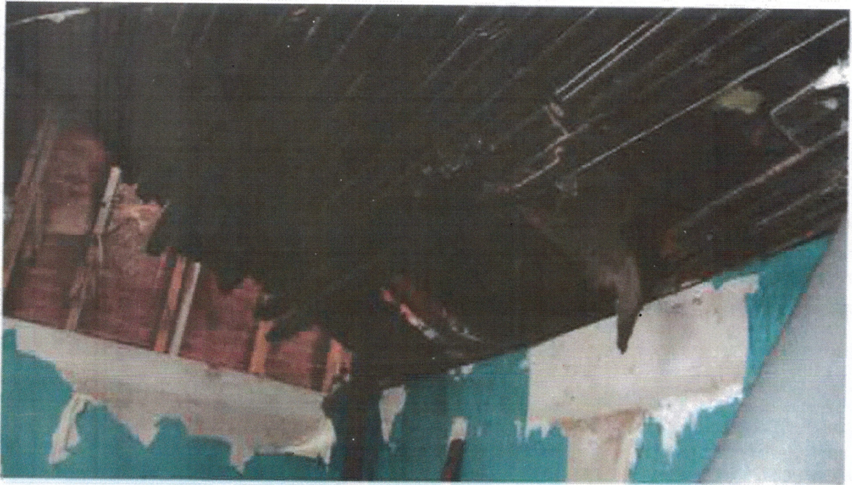
Photo 30 - Loft southwest unit looking north. Ceiling joists consumed by fire has fallen onto interior partition