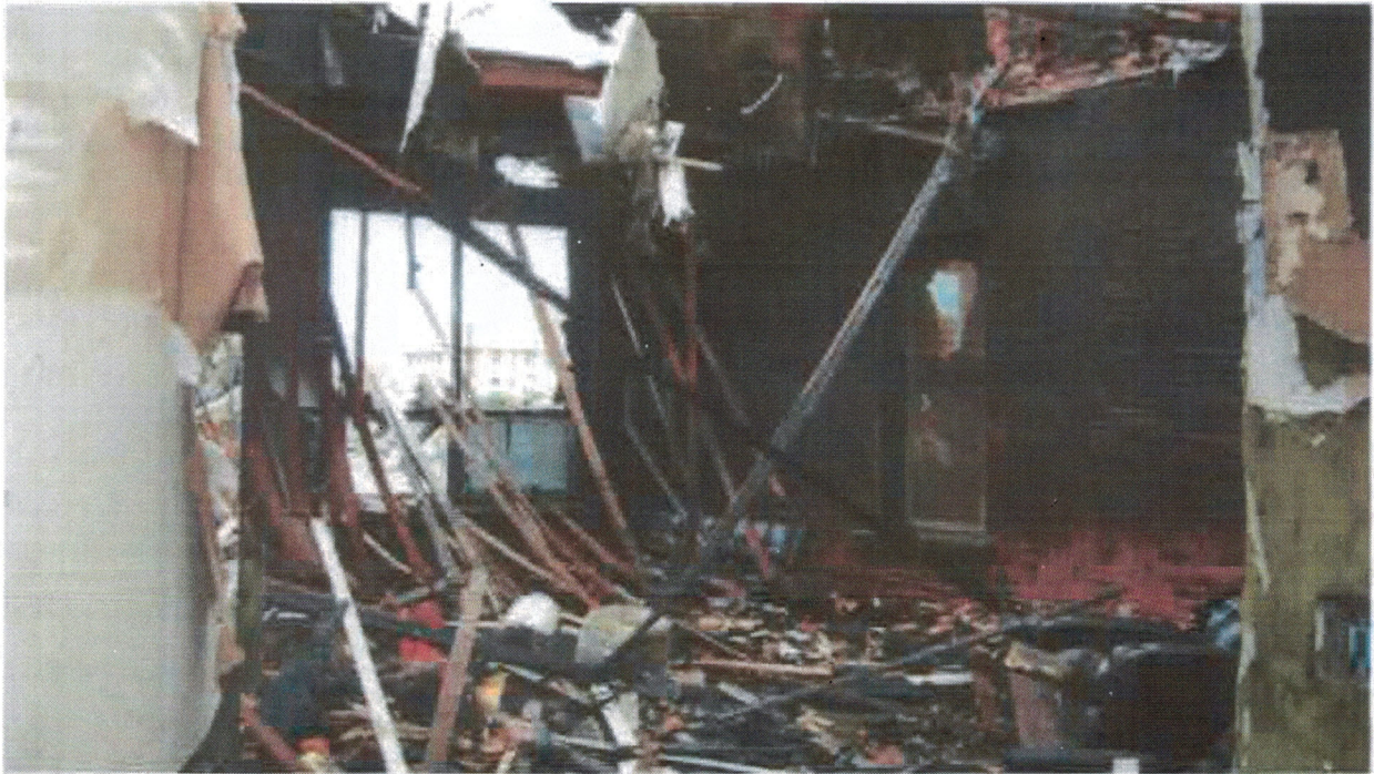
Photo 26 - Loft southeast corner. Ceiling consumed by fire and collapsed onto floor. Noticed wood timber lintel. Parapet above front windows is unstable.