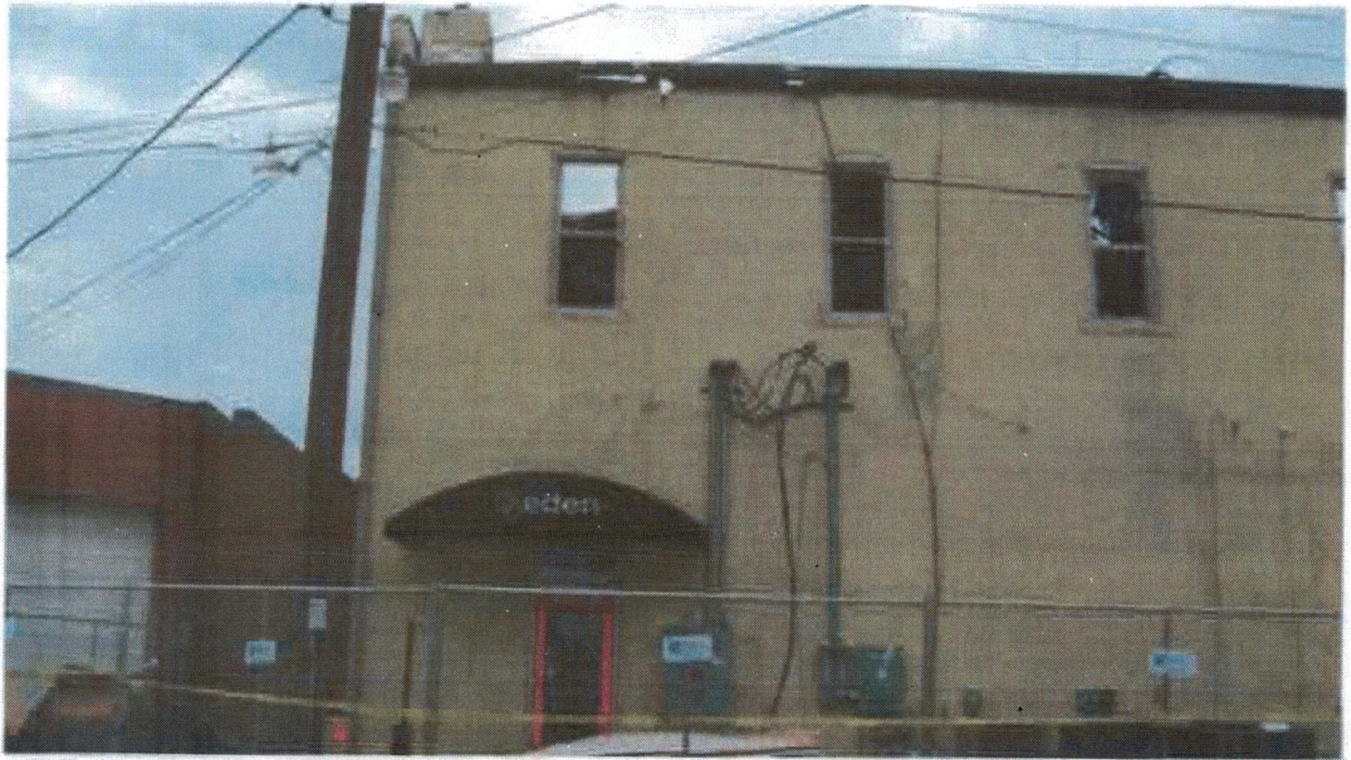
Photo 41 - West face of building.