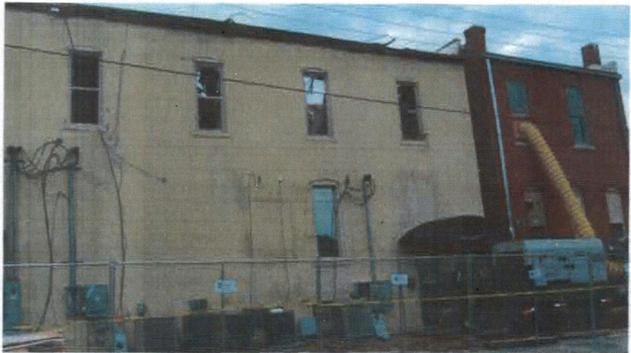
Photo 42 - West face of building.