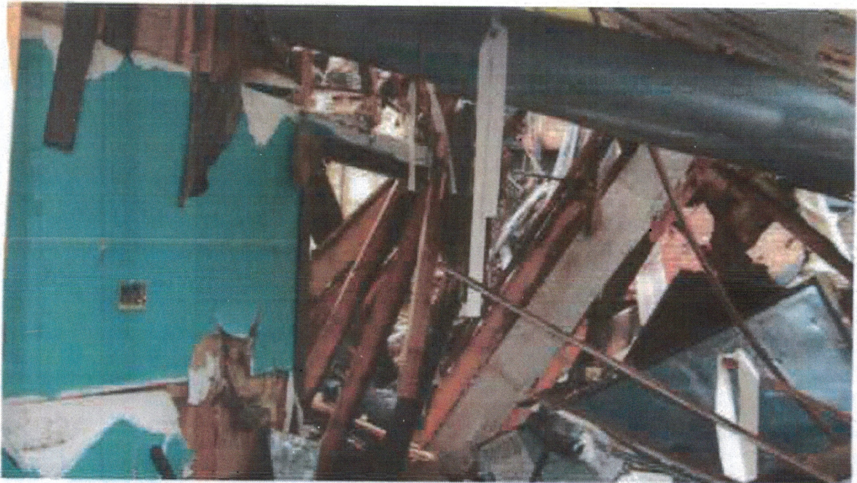
Photo 31 - Loft southwest unit looking south. Ceiling and walls collapsed onto floor.