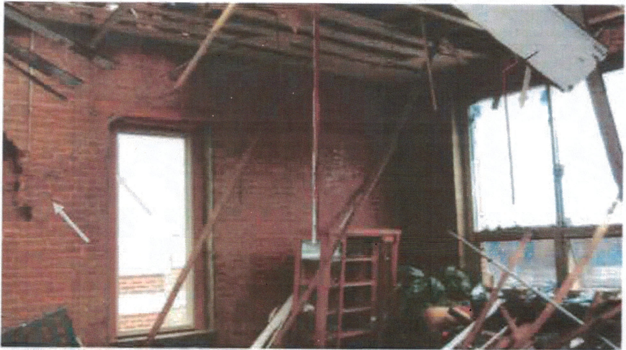
Photo 34 - Loft northeast unit looking north: ceiling collapse. Location where delaminated brick was noted.