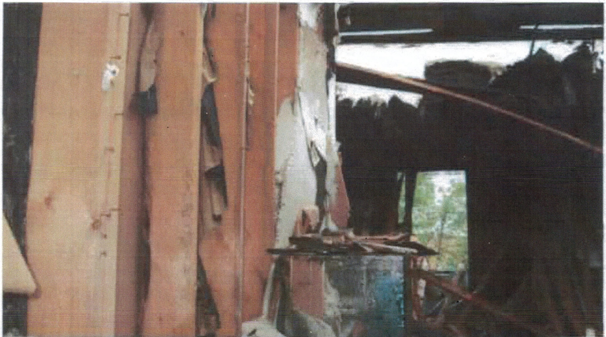
Photo 27 - Loft southeast corner. Ceiling consumed by fire and collapsed onto floor. Gypsum board has been pulled off of interior partition.