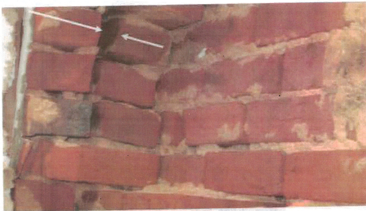
Photo 39 - loft northeast unit looking at same damaged area to brick. Interior face of brick has moved approximately 1" or more from interior wythes. Mortar not bonding - notice the lack of mortar on the face of brick units