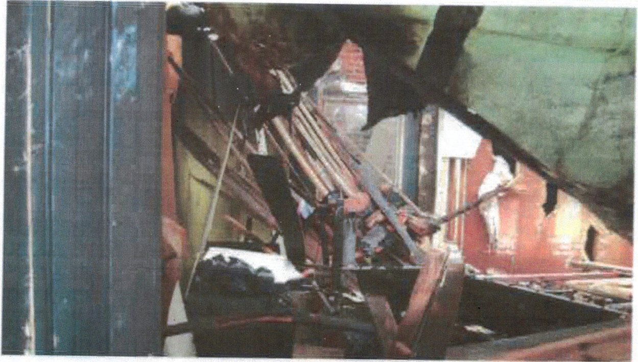
Photo 28 - Loft southwest unit. Collapsed ceiling and walls.