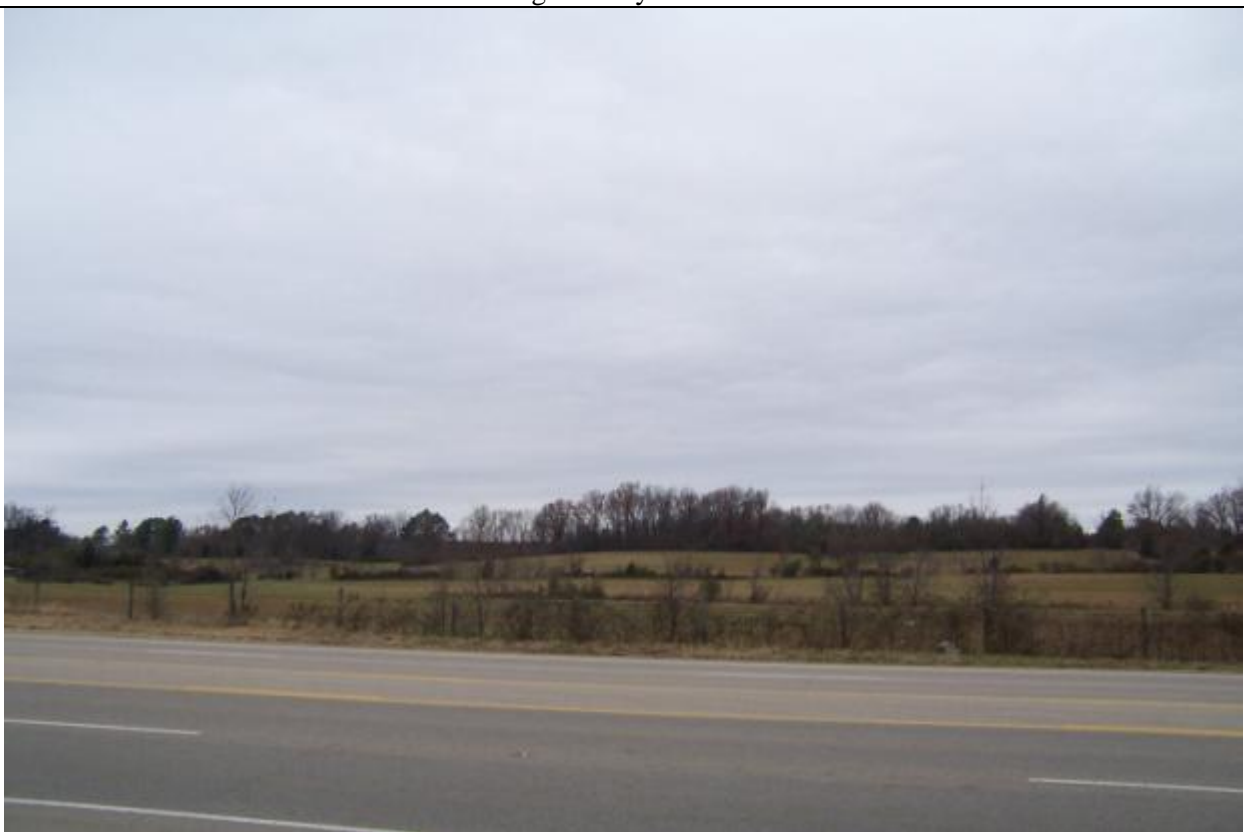
View of the site looking toward the north