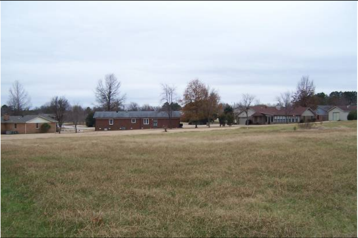
View looking south at existing at abutting existing Single Family Subdivision