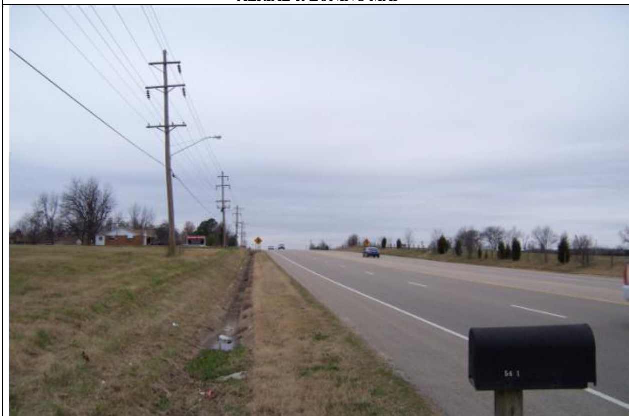
View of the site looking west