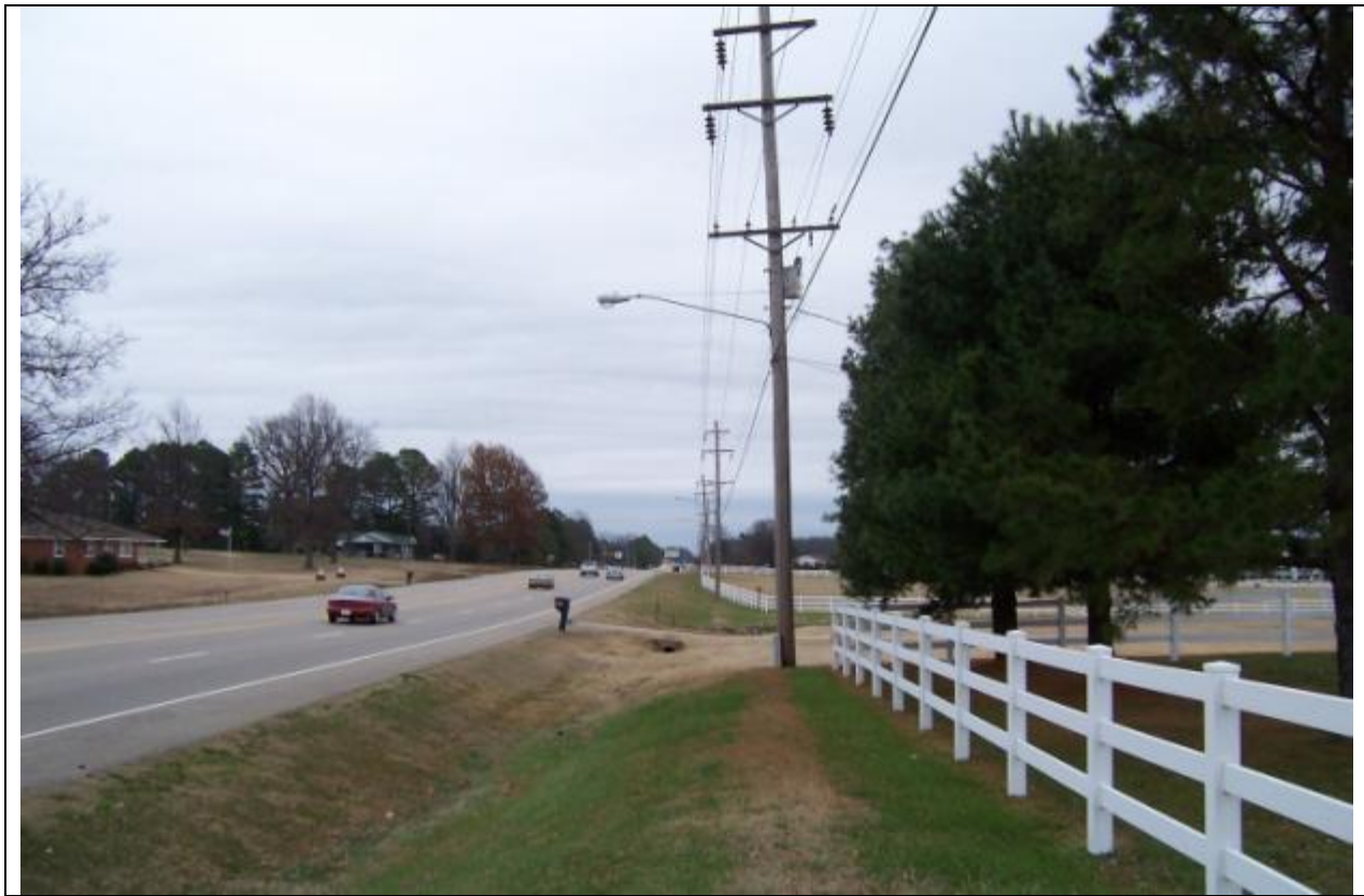
View looking Easterly